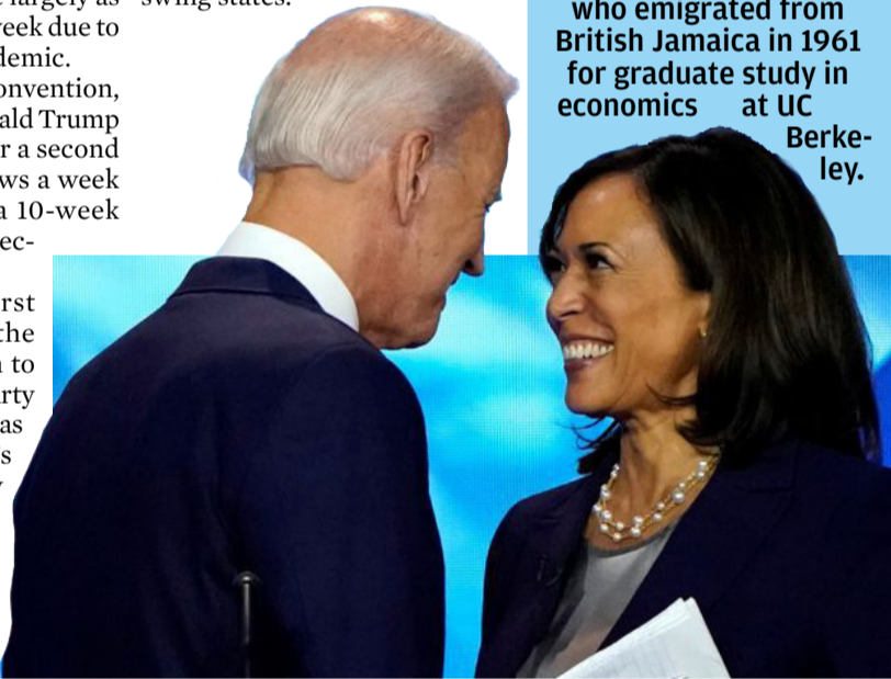
Former Vice President Biden talks with Senator Harris after the conclusion of the 2020 Democratic US presidential debate in Houston

But Harris was regarded as a relatively safe choice. She is a more dynamic campaigner than Biden and will be relied upon to help energize Black voters, who represent a crucial constituency for Biden in key swing states.