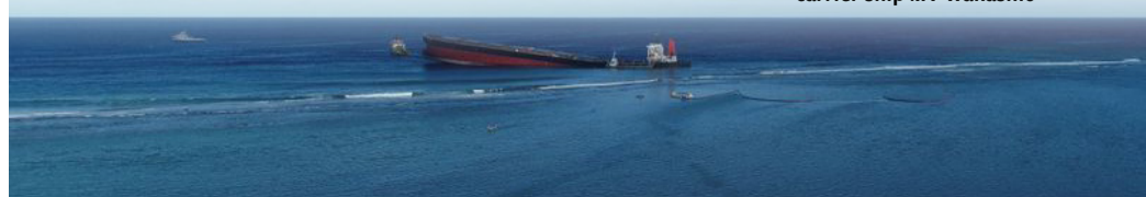
A general view shows the bulk carrier ship MV Wakashio