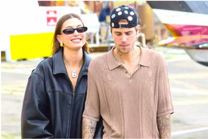
Justin Bieber and wife Hailey

Justin Bieber has declared his love for wife Hailey after the couple were hit by split rumours. The singer, 31, and his model partner, 28, tied the knot in 2018 and welcomed their son Jack Blues in August last year but the pair have recently been the subject of widespread reports over the state of their relationship amid fears for Justin's wellbeing after he was caught in incidents including a clash with paparazzi confrontations and posted social media updates hinting at drug use. Justin now appears to have dispelled persistent rumours his life and marriage is in turmoil by sharing a photo of him with Hailey cuddling up on holiday in Spain.