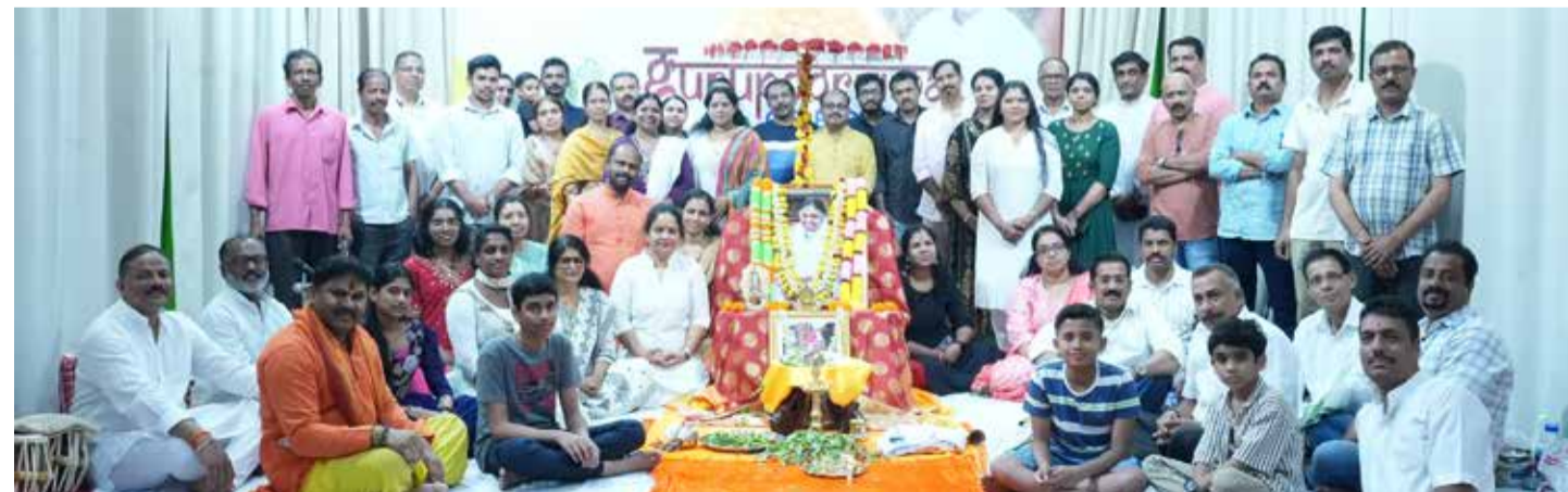
Mata Amritanandamayi Seva Samiti Bahrain officials and members