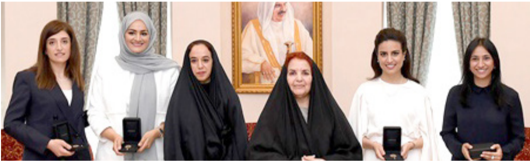
HRH Princess Sabeeka bint Ibrahim Al Khalifa with young Bahraini women entrepreneurs

A strong emphasis is placed on export potential, creativity, sustainability, and readiness for digital transformation. Support system ‘Imtiaz’ does more than recognise excellence. It offers branding benefits, access to investors, expert mentorship, and media visibility to winners. Participants gain tools to refine their products, develop marketing strategies, and meet international standards - helping them compete beyond Bahrain’s borders. Eligibility conditions include submitting financial documenta-