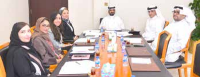
HH Shaikh Khalifa bin Salman chairs the regular committee meeting