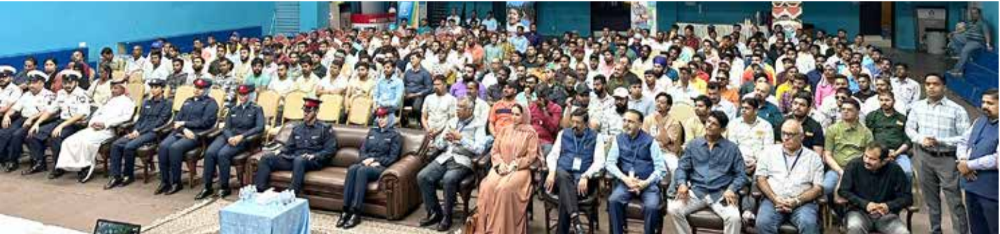
Ministry of Interior, ICRF Bahrain and Indian Club officials with workers