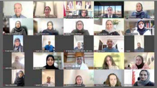
H.E. Dr. Jalila bint Al-Sayed Jawad Hassan presides over the online discussion TDT | Manama

The Ministry of Health, in partnership with the International Center for Genetic Diseases at Harvard Medical School, has launched an advanced clinical training program focused on the responsible return of genetic test results.