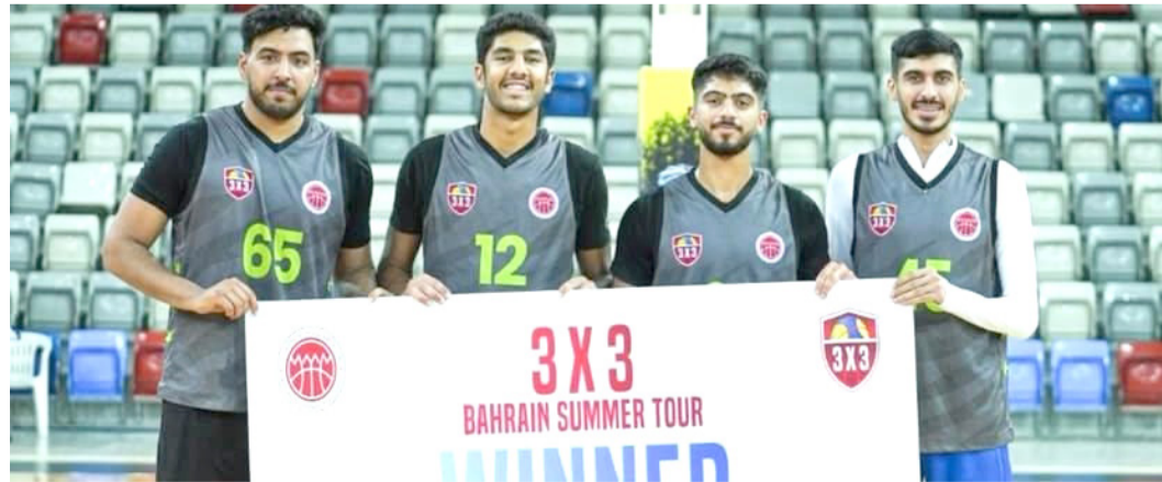
Saar players after being awarded

The tournament, organized by the Bahrain Basketball Association (BBA),