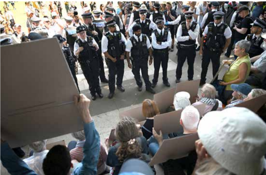
Police line up in front of protesters gathered to support the "Palestine Action", in Parliament Square, London.

"We will not be deterred from opposing genocide, nor from defending those who refuse to be bystanders," the group said in a statement, referring to ac-