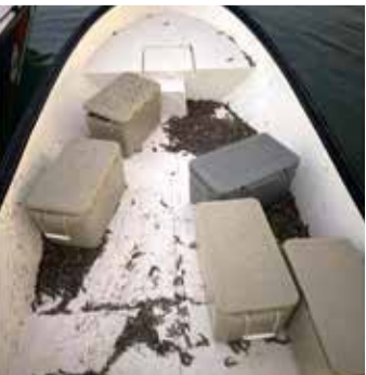
Evidence seized from the suspects

The shrimp were caught using banned bottom trawling