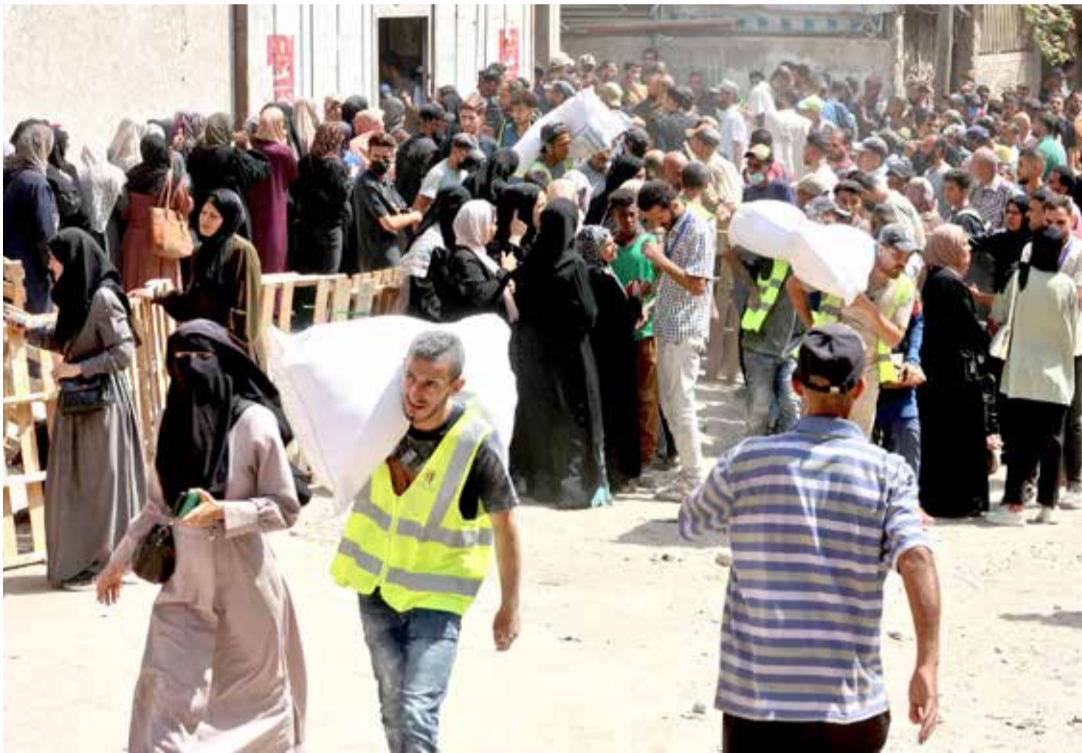
A Palestinian man carries a bag of flour at a UN World Food Programme (WFP) warehouse on Al-Jalaa street in Gaza City

was an explosion... where two boys, a girl and their mother were staying. We found them torn to pieces, their remains scattered," he added.