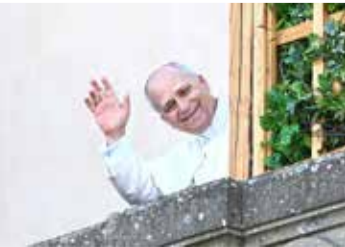
Pope Leo XIV

Pope Leo XIV's childhood home has been sold to the village where he grew up, which intends to make it a historical site, local media reported Friday. The modest brick home in the Chicago suburb of Dolton, pop-