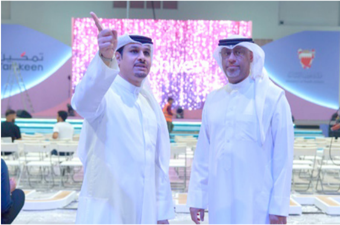
Ministry of Youth Affairs Undersecretary Marwan Fouad Kamal inspects the facilities ahead of the launch

Open to Bahrainis aged 9 to 35, Youth City 2030 offers