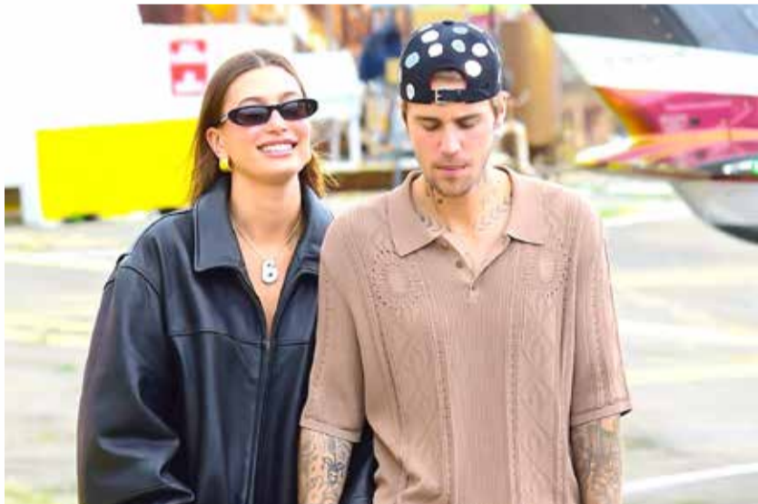
Justin Bieber and wife Hailey

His and Hailey's romantic Spanish retreat marks their first significant public gestures of connection since the speculation began.