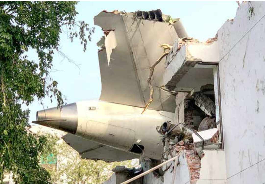
The back of Air India flight 171 is pictured at the site after it crashed in a residential area near the airport in Ahmedabad

Earlier this week, specialist website The Air Current, citing multiple sources familiar with the probe, reported it had "narrowed its focus to the movement of the engine fuel switches", while noting that full analysis will "take months -- if not longer". It added that "the focus of the investigators could change during that time". The Indian agency's report said the US Federal Aviation Administration had issued an information bulletin in 2018 about "the potential disengagement of the fuel control switch locking feature". Though the concern was not considered an "unsafe condition" that would warrant a more serious directive, Air India told investigators it did not carry out suggested inspections as they were "advisory and not mandatory". Air India was compliant with all airworthiness directives and alert service bulletins on the aircraft, the report said. The investigations bureau said there were "no recommended actions to B787-8 and/or GE GENx-1B engine operators and manufacturers", suggesting no technical issues with the engines (GE) or the aircraft (Boeing). The bureau said the investigation was ongoing, and that additional evidence and information had been "sought from the stake-