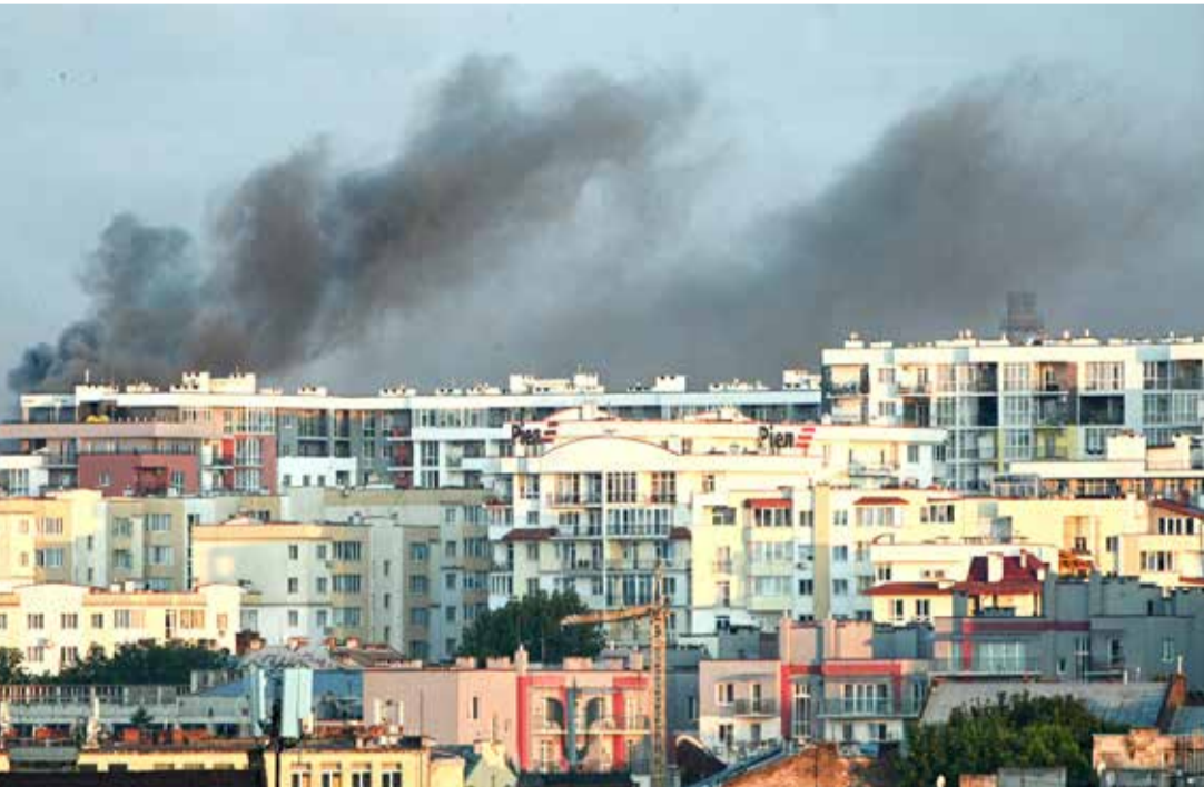
Smoke billows above the city's buildings following mass Russian drone and missile strikes in the western Ukrainian city of Lviv

Zelensky said the strikes had killed at least two people and