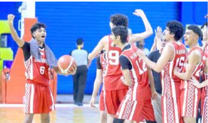
Full-time celebrations were Bahrain are crowned Gulf champions