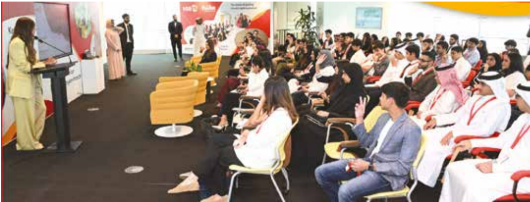
Manama

The National Bank of Bahrain (NBB) has officially launched the fourth edition of EVOLVE, its flagship summer internship programme. This initiative is designed to equip high school and university students with practical, hands-on experience, enabling them to build essential professional skills across the banking and financial services sector.