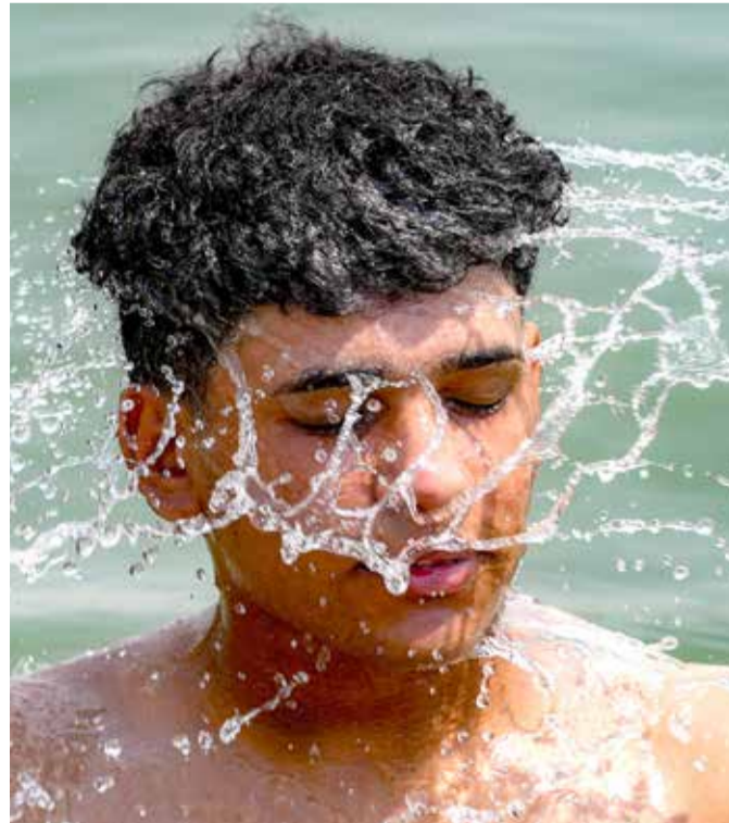
A youth cools off in the Euphrates river amidst power cuts due to an extreme heatwave in Mishkhab district south of Iraq's central city of Najaf.

Before agreeing to any new meeting, "we are examining its timing, its location, its form, its ingredients, the assurances it requires", said Araghchi.