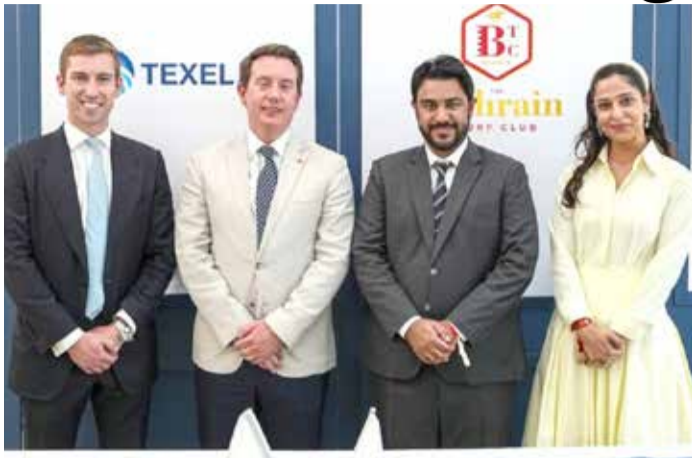
Officials after signing the agreement

Texel Air has renewed its gold sponsorship of the Bahrain Turf Series for another three seasons, cementing its role in powering Bahrain's equestrian ambitions through specialised air cargo support.