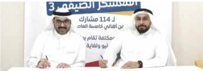
MP Al-Saloum with Generations Academy official during an agreement-signing ceremony

Organised in cooperation with Generations Academy, the