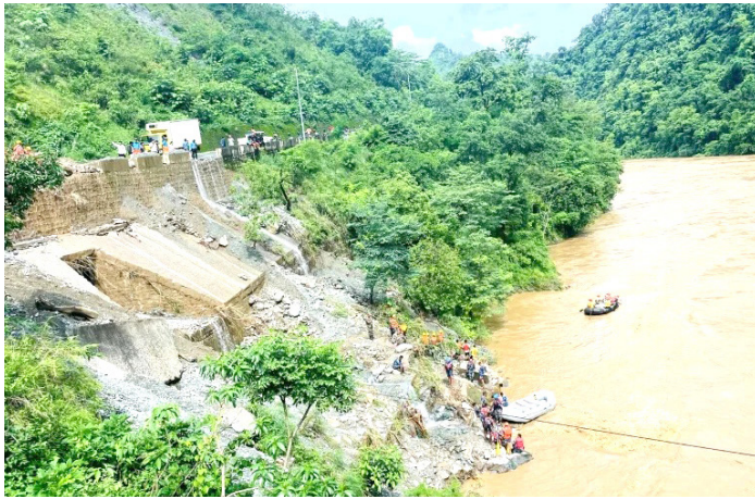
Rescuers search for survivors in the river Trishuli in Simaltar

"The search will resume tomorrow morning."