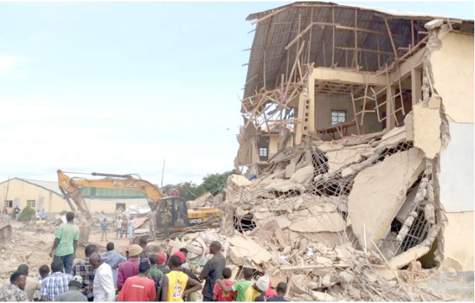
Rescuers search for survivors under the rubble

Red Cross spokesman Nurudeen Hussain Magaji told AFP