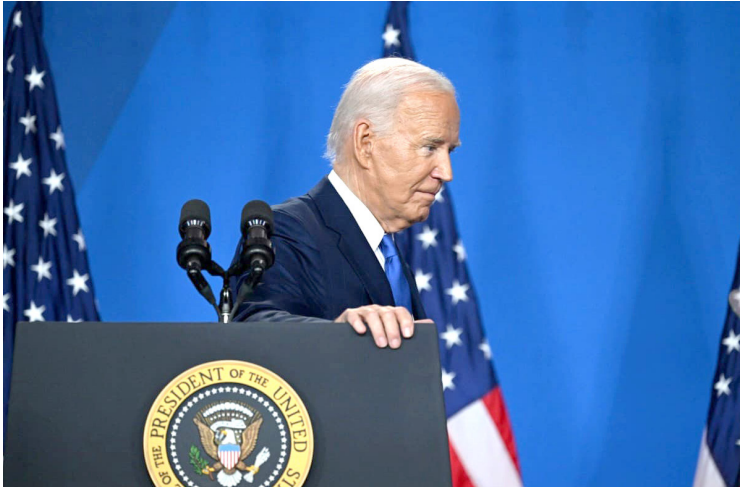
US President Joe Biden leaves after speaking during a press conference

But a series of gaffes, including referring to Vice President Kamala Harris as "Vice President Trump," kept Biden's fitness for