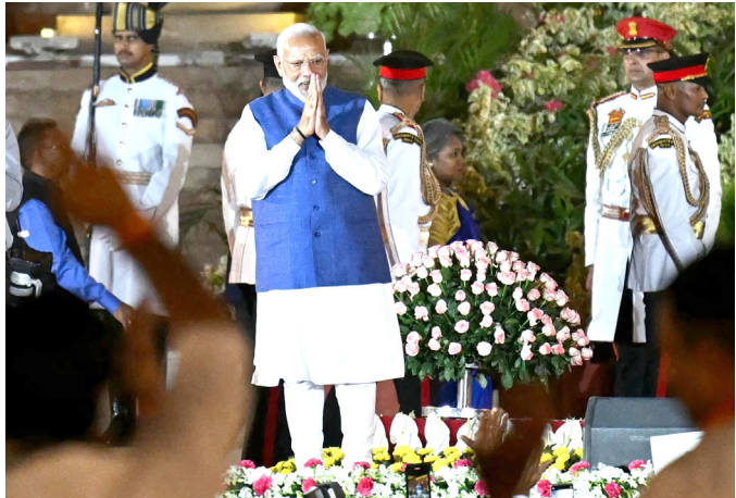
Prime Minister Narendra Modi gesturing to the gathering during the oath-taking ceremony

Speaking to reporters Thursday, US President Joe Biden, set to face Trump in November, said that "I have no good reason to talk to Putin right now -- there's not much that he is prepared to do in terms of accommodating any change in his behavior."