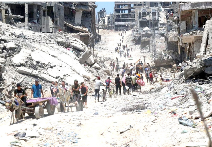
Palestinians walk past destroyed buildings in Gaza City's Shujaiya neighbourhood

Israeli troops and tanks have, since Shujaiya, swept into other Gaza City districts to fight Ha-