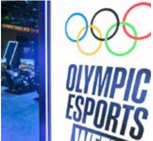
The IOC held an initial “Olympic e-sport week” in Singapore in June 2023

Saudi Arabia is hugely excited by the prospect of partnering with the IOC and helping to welcome a completely new era for international sport