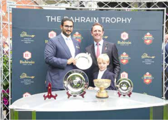
HH Shaikh Isa bin Salman bin Hamad Al Khalifa presents a trophy

Bahrain's efforts in horse racing, which have garnered international attention, reaffirming the importance of continuing the strategic approach to solidify Bahrain's international sports