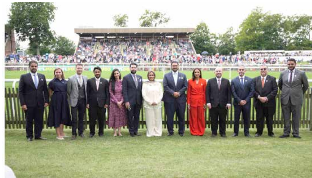
EDB officials during a photocall;