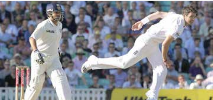
James Anderson (R) bowls while Sachin Tendulkar (L) watches him (file photo)

"Here's a little wish as you bid goodbye. It has been a joy