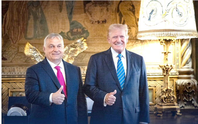
Hungary's Prime Minister Viktor Orban (L) posing with former US president Donald Trump at Trump's estate in Mar-a-Lago in Palm Beach, Florida

Canada said Thursday it had designated the country's largest marine protected zone off the coast of Vancouver, as it moves to shield a third of its oceans by the end of the decade. The 133,000-square-kilometer (51,000-square-mile) zone was announced in a joint statement by Canada's department of fisheries and oceans and leaders of four First Nations. "Today we are taking a giant step forward in protecting Canada's oceans," said the department's minister Diane Lebovillier. The new marine protected area brings Canada "halfway to our goal of conserving 30 percent of our oceans by 2030", Lebovillier said.