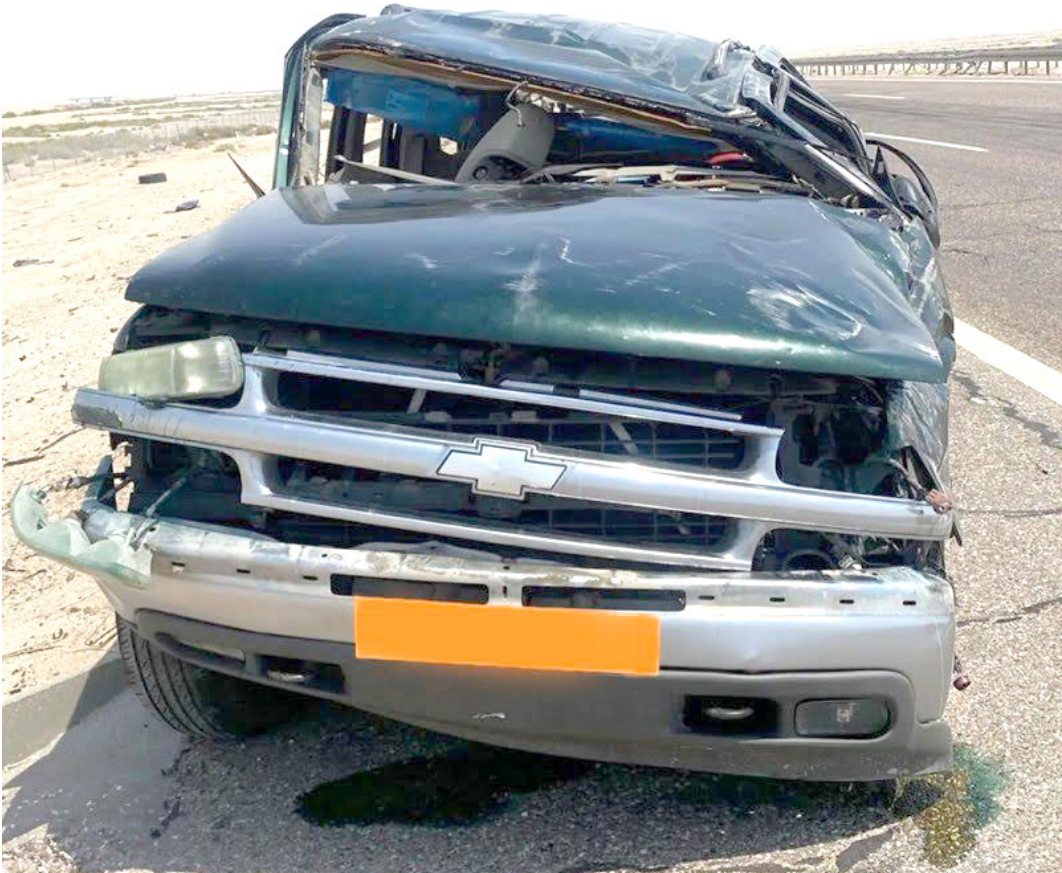
The vehicles involved in the accident

The harrowing ordeal is drawing to a close for some of the survivors of the devastating car accident in Iraq last month, which tragically claimed the life of a Bahraini citizen and left several others critically injured. Thankfully, some of the survivors who have made a strong recovery will soon be flying back to Bahrain on a Gulf Air flight, marking a hopeful return home. The accident, which occurred in June 2024 on the international highway near Nasiriyah,