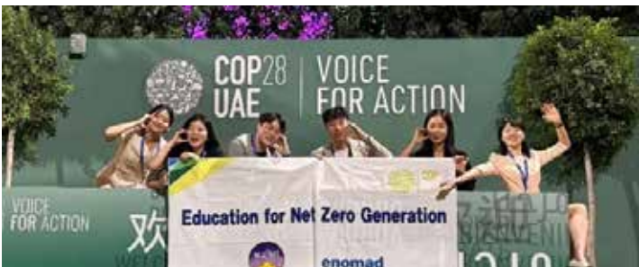
GOGO Teachers' Association, the Republic of Korea

The 2023 edition of the UNESCO ICT in Education Prize aimed