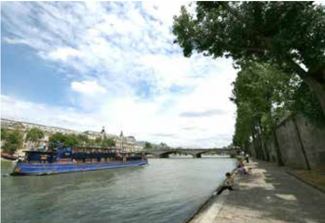
A view of the Seine river