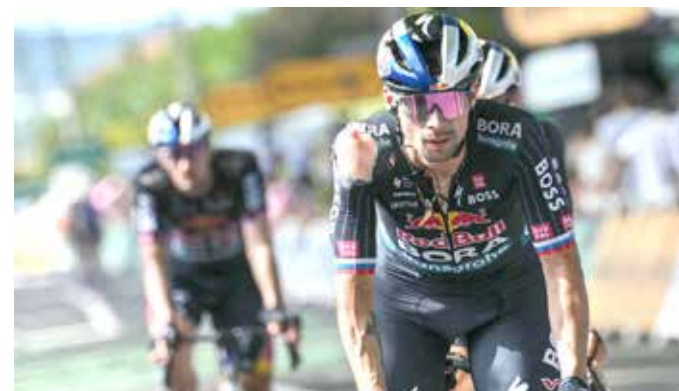
Primoz Roglic, with visible injuries sustained in a crash, cycles past the finish line of the 12th stage