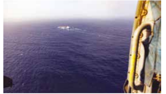
U.S. Navy warships and air assets continue to patrol regional waters enforcing the blockade against Iran. As of today, U.S. forces have redirected 136 commercial vessels and disabled 9 to ensure compliance.