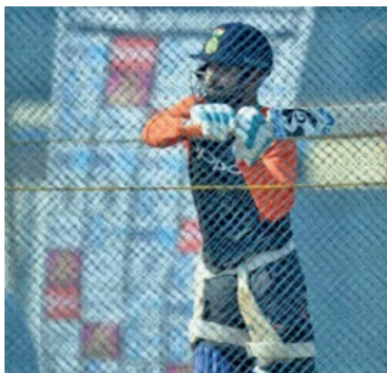
India's Rishabh Pant during nets

placement is required, it's always good to have a replacement coming in and practising with the team as a standby".