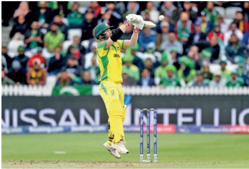
Australia's David Warner plays a shot

Two balls later, Amir played on for a duck before Glenn Maxwell ended the match with a brilliant direct hit run out of Sarfaraz.