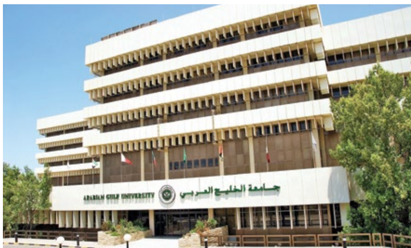
The AGU is at the forefront of higher education institutions in the region to introduce new and innovated majors to its students.