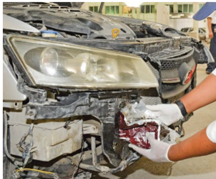
Drugs were hidden in the front bumper of the car.

Quoting the Land Ports Director in the Ministry’s Customs Affairs Director, the statement mentioned: “The K9 dog suspected one of the cars in a particular lane and the search resulted in the confiscation of the substances that were hidden inside the front part of the vehicle.”