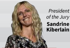
President of the Jury Sandrine Kiberlain

Camera d'Or For the best 1st film among the Official Selection, the Directors' Fortnight or the Semaine de la Critique