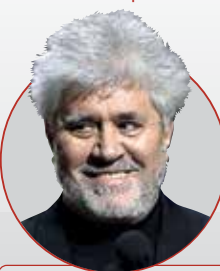
President of the Jury Pedro Almodovar Spanish director

Official competition 19 films 1 director who has already twice won the Palme d'Or 3 Female directors in competition 2 films distributed by Netflix (a first)*