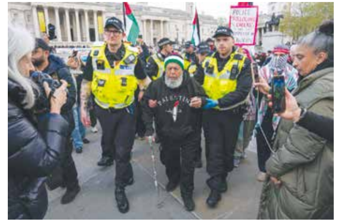
An elderly man (C) is escorted away by police as protesters gather to call for the lifting of the ban on the Palestine Action group during a demonstration in Trafalgar Square in central London