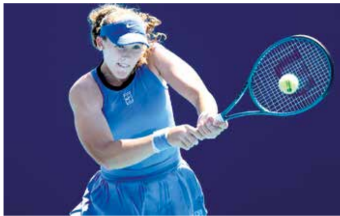
Mirra Andreeva returns a shot to Victoria Mboko of Canada