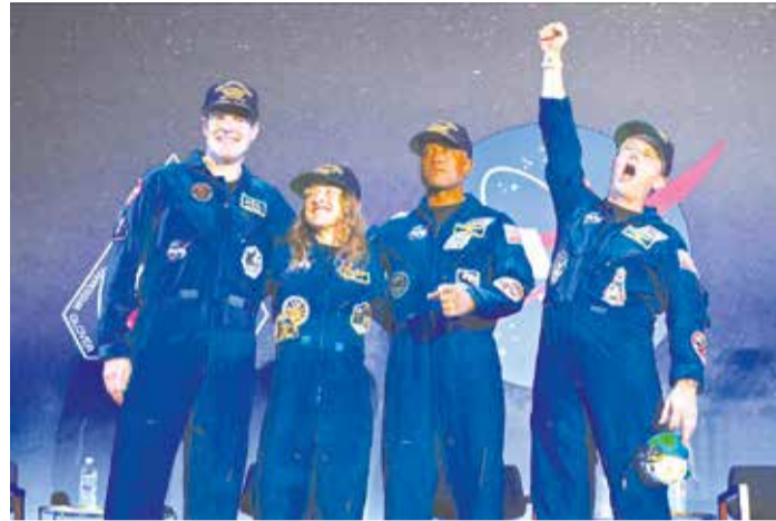
NASA's Artemis II mission astronauts Canadian Space Agency's Jeremy Hansen, Christina Koch, Victor Glover and commander Reid Wiseman react during a welcoming ceremony at Ellington Field Joint Reserve Base in Houston, Texas

"What struck me wasn't necessarily just Earth, it was all the blackness around it. Earth was just this lifeboat hanging undisturbed in the universe,"