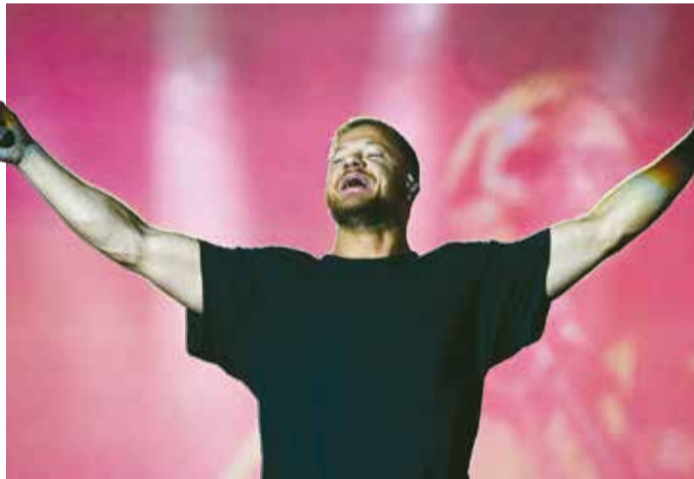
American singer Dan Reynolds

The game sorts players into two teams of five who can battle online, competing to hide their own flag and snatch the oppos-