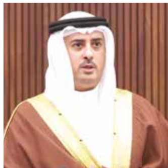
HE Nawaf Al Maawda, Minister of Justice, Islamic Affairs and Waqf

Under Decision No. 27 of 2026, remote hearings may be conducted at the request of parties or at the discretion of the tribunal, including dispute panels, judges, and case managers. Proceedings can take place from inside or outside Bahrain, although physical attendance