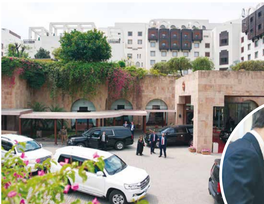
The motorcade of US Vice President JD Vance is seen after his arrival at the Serena Hotel in Islamabad