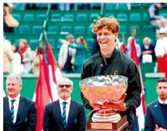
Italy's Jannik Sinner celebrates with the trophy