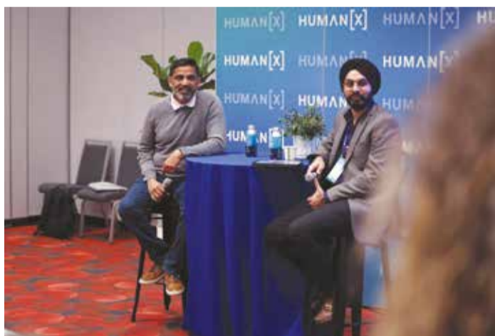
Praveen Neppalli Naga speaks during the "Q&A with Praveen Neppalli Naga, CTO at Uber" segment at the HumanX Conference San Francisco 2026 at Moscone Center South

High-profile examples are on the rise: Salesforce laid off 4,000 customer support workers, saying AI now handles 50 percent of its work.