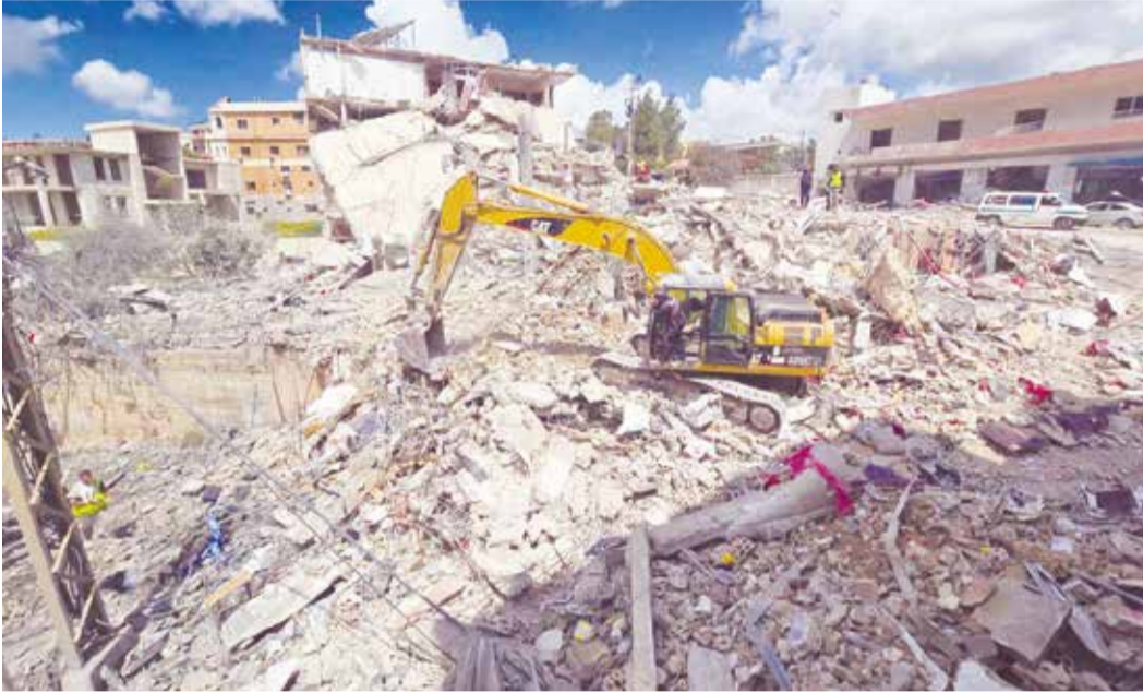
An excavator clears the rubble of destroyed buildings from the site of an Israeli strike that targeted the southern Lebanese village of Qana

Pope Leo XIV, who visited Lebanon late last year, ex-