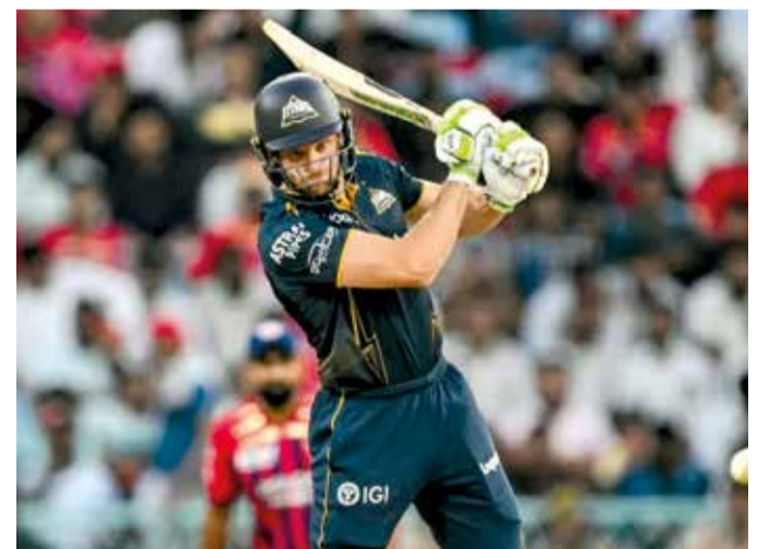
Jos Buttler plays a shot