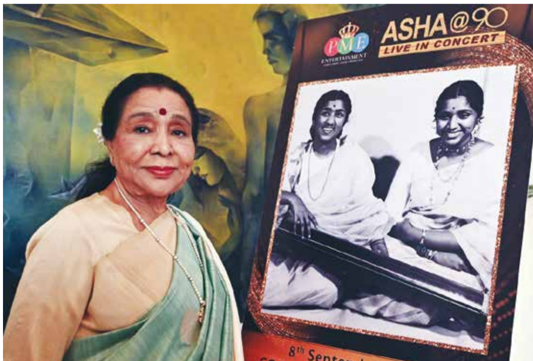
Bollywood playback singer Asha Bhosle attends a press conference in Mumbai on August 8, 2023, to announce her 90th live concert in Dubai.

"My mother passed away today (Sunday). Her last rites will be held tomorrow at Shivaji Park