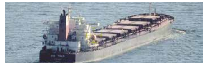
The Panama-registered bulk carrier Hui Yuan

guard aircraft monitoring mission in a violation of the Nordic country's Environmental Code.