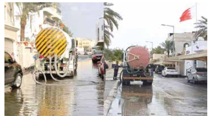
Before-and-after scenes from Sanad show rapid response efforts tackling water accumulation.

Municipal crews and relevant authorities were deployed immediately across the Capital Governorate, Muharraq, the Northern and Southern Governorates, working in coordinated operations to manage water accumulation and keep roads