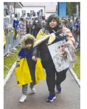
People hold photographs of their missing or captured relatives and friends as released Ukrainian prisoners of war (POW) arrive after a prisoner exchange in the Chernihiv region

"But even if you're going to church, there is no 100-percent guarantee that everything will be peaceful... you shouldn't trust Putin and his government," he added.