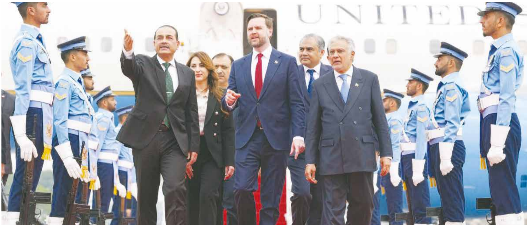
US Vice President JD Vance (C) walks with Pakistan's Chief of Defence Forces and Chief of Army Staff Field Marshall Asim Munir (L) and Pakistani Deputy Prime Minister and Foreign Minister Mohammad Ishaq Dar after arriving for talks with Iranian officials in Islamabad

Speculation had risen that one or both of Trump's envoys might stay behind to pursue further discussions, after the marathon talks failed to produce any substantive progress over the conflict with Iran.