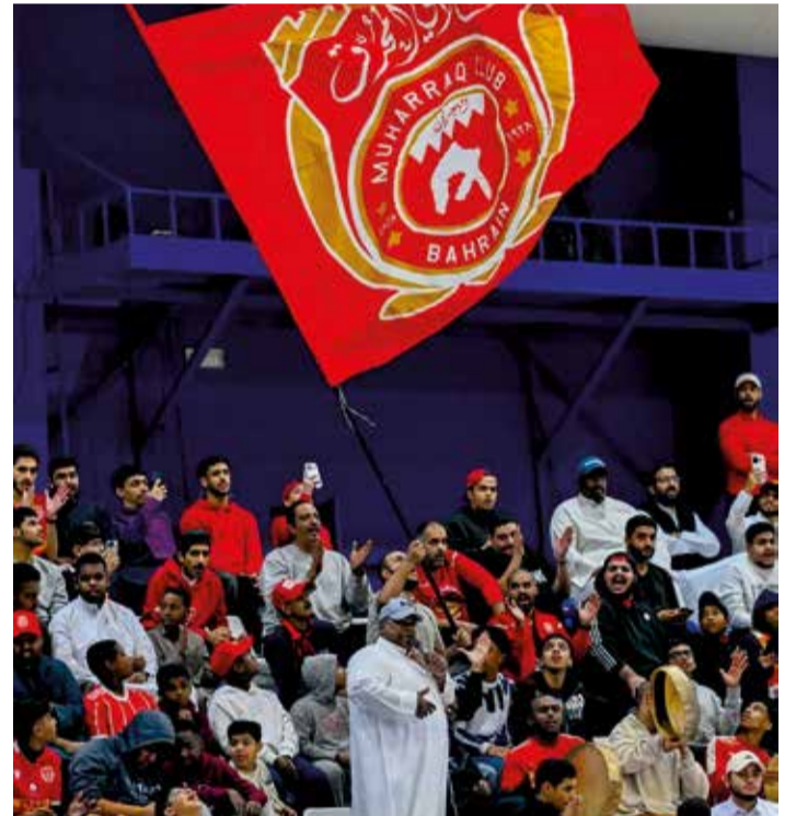
Muharraq fans in full voice during a previous match

Volleyball follows the same path, with the Bahrain Volleyball Association announcing the return of spectators to indoor competitions from Sunday. The federation has urged fans to support their teams while maintaining a positive sporting atmosphere.