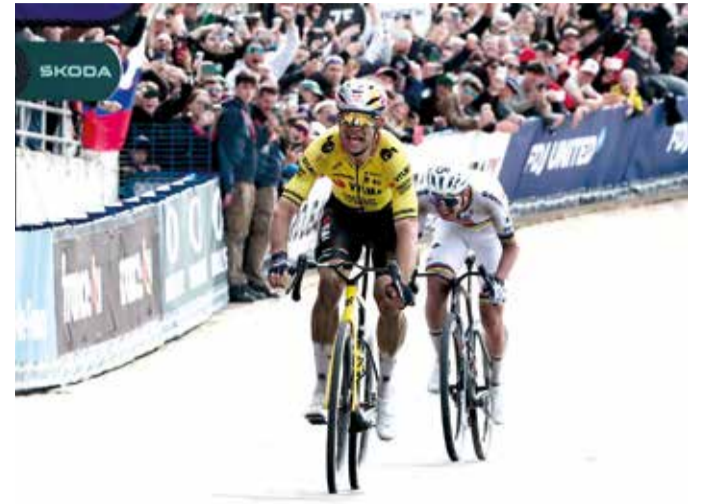
Team Visma - Lease a Bike's Belgian rider Wout van Aert sprints ahead of UAE Team Emirates XRG's Slovenian rider Tadej Pogacar