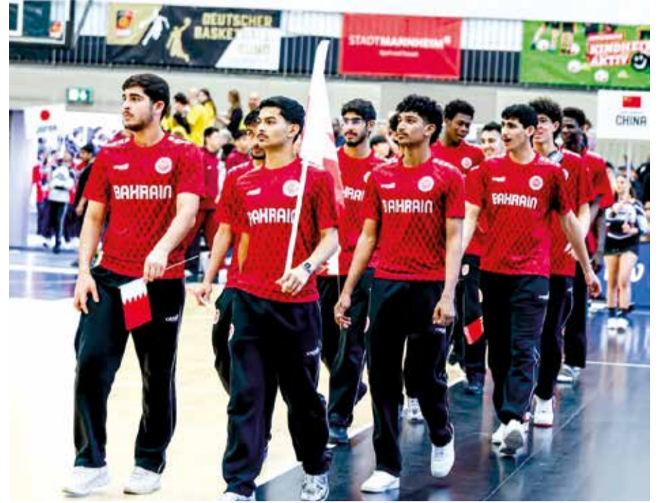
Bahrain players take part in the closing ceremony parade

Attention now turns to the Gulf Basketball Association U18 qualifiers for the FIBA U18 Asia Cup 2026 in Doha. Bahrain's challenge is straightforward: take the lessons learned in Germany and convert them into results when qualification begins.