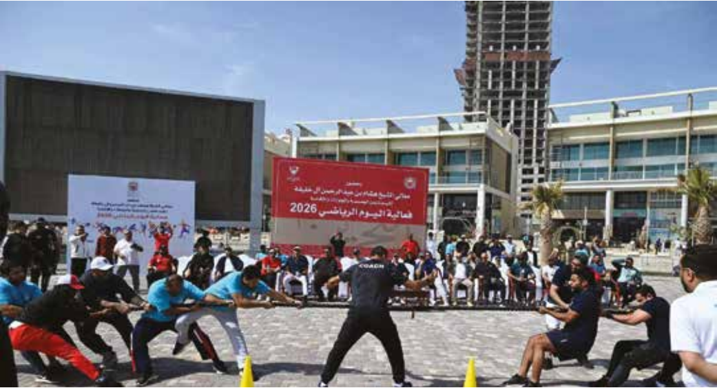
The Nationality, Passports and Residence Affairs (NPRA) marked Bahrain National Sports Day by organizing a series of athletic activities for its employees. The event was held in the presence of His Excellency Sheikh Hisham bin Abdulrahman Al Khalifa, Undersecretary of the Ministry of Interior for Nationality, Passports and Residence Affairs. A variety of sporting activities were organized, drawing wide participation from employees in a vibrant and positive atmosphere.