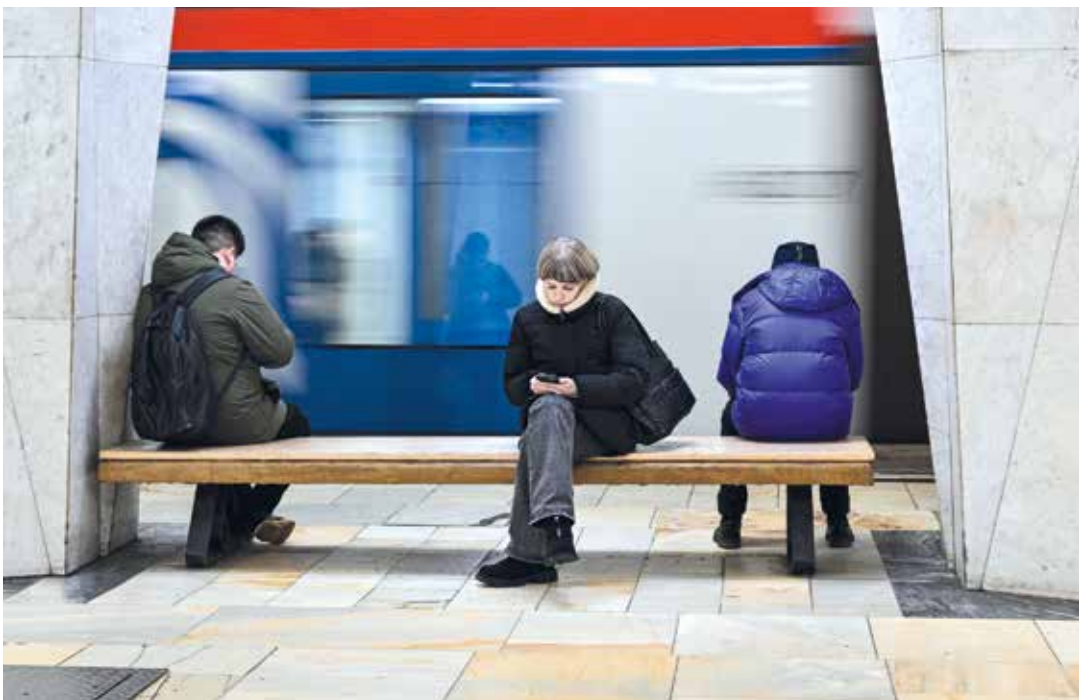
People use their smartphones while sitting on a bench at a metro station in Moscow

"Max is an accessible alternative, a developing messenger, a national messenger. And it is an