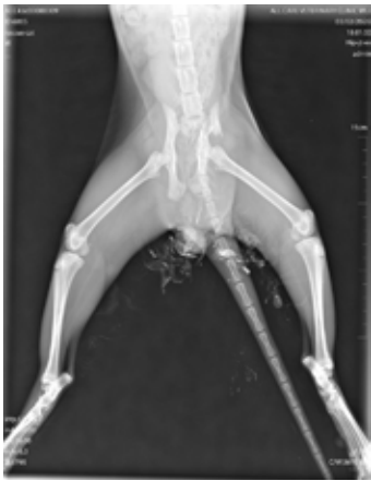
An abandoned cat with severe medical conditions receives an urgent veterinary care

A group of Bahraini women has quietly spent years rescuing abandoned and injured cats, funding every operation from their own pockets. They describe this as a purely humanitarian mission driven by compassion rather than profit, working with the Bahrain Animal Protection Society. Since 2008, the volunteers have dedicated their time and personal resources to saving domestic cats left behind by owners and street cats injured in road accidents, neglect or abuse. Many cases involve severe medical conditions requiring urgent veterinary care. In the absence of a clear and comprehensive animal welfare law,