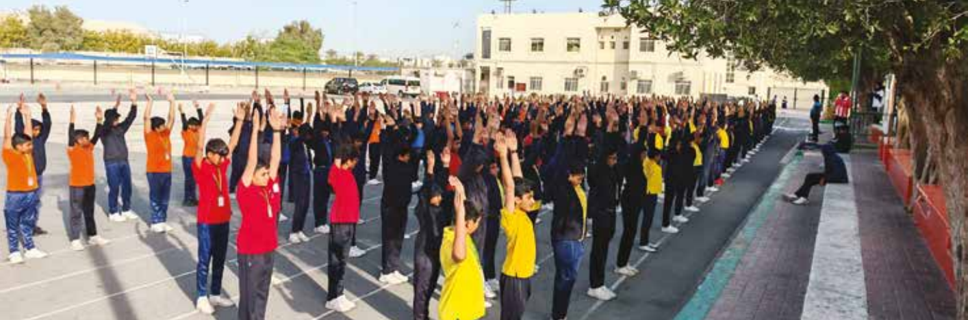
The Indian School Bahrain (ISB) organized a vibrant Bahrain Sports Day, aimed at promoting physical fitness and overall well-being. The event provided students with a dynamic platform to participate in diverse physical activities and experience the joy of healthy competition. School authorities emphasized that such sporting events are vital for students' mental and physical health, while also strengthening bonds between the student body and faculty. A wide array of activities, including hockey, football, cricket, and basketball matches, alongside athletic events, encouraged participation across all levels. These games were designed to instill discipline, cooperation, and mutual respect among students.