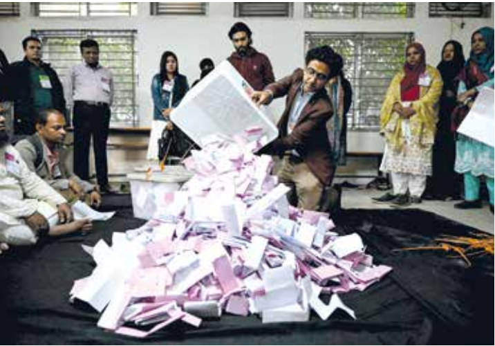
An electoral official opens a ballot box as counting starts at a polling station

However, he faces a stiff challenge from a coalition led by the Muslim-majority country's largest Islamist party, Jamaat-e-Islami.