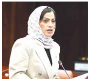
MP Basema Mubarak

To check whether people stay in work after support ends, Tamkeen said its oversight team contacts programme beneficiaries to confirm they are still employed.