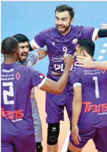
Dar Kulaib players celebrated reaching the final of the 2026 West Asia Men's Clubs Volleyball Championship yesterday after defeating fellow Bahraini side Al Ahli in Kuwait.

For more information on the BRMC or on other events and activities at BIC or BIKC, visit bahraingp.com, call the BIC Hotline on +973-17450000, or follow the circuit's official social media channels.