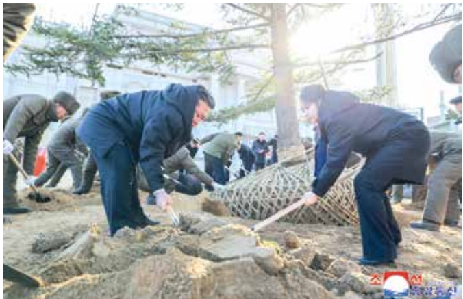
North Korean leader Kim Jong Un (L) and his daughter Kim Ju Ae participating in a tree-planting ceremony at the construction site of the Memorial Museum of Combat Feats at the Overseas Military Operations in Pyongyang

◆ The World Health Organization has said the risk of the deadly Nipah virus spreading was low after three cases of infection were recently confirmed in India and Bangladesh. Nipah, which spreads from animals to humans, has no vaccine and a fatality rate ranging from 40% to 75%, according to the UN health body. "In the past few weeks, three cases of Nipah—two in India and one in Bangladesh—made headlines and caused concern about a wider outbreak," WHO chief Tedros Adhanom Ghebreyesus told a press conference in Geneva.