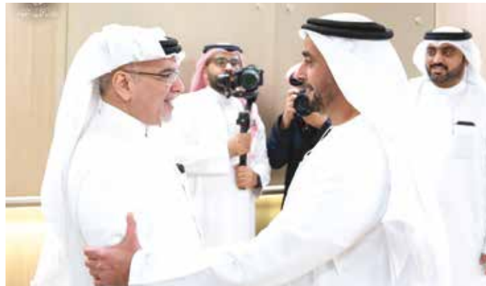
His Royal Highness is welcomed by His Highness Sheikh Saif bin Zayed Al Nahyan, the UAE's Deputy Prime Minister and Minister of Interior

His Majesty King Hamad bin Isa Al Khalifa and HH Sheikh