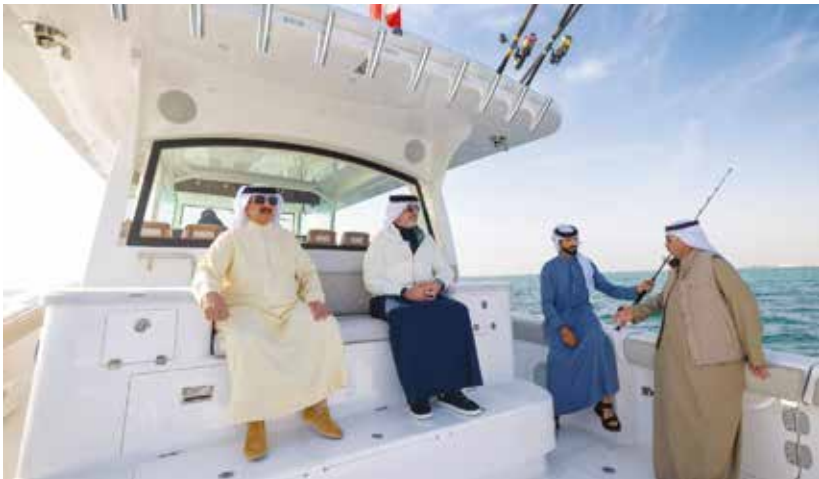
His Majesty participates in marine sports on the occasion of Bahrain Sports Day

He emphasised that exploring, developing and investing in these resources in the near future would serve the best interests of Bahrain and its people. HM the King made the re-