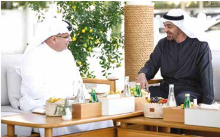
HRH Prince Salman meets with HH Sheikh Mohamed bin Zayed

HRH Prince Salman highlighted the depth of Bahrain-UAE re-