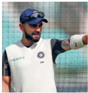
India's Virat Kohli during nets (file photo)

India captain Virat Kohli is well ahead of his contemporaries and destined for greatness, former Sri Lankan batting stalwart Kumar Sangakkara has said.