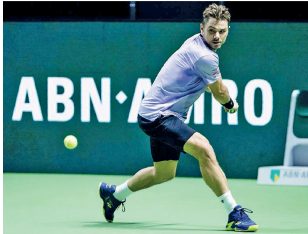
Switzerland's Stanislas Wawrinka plays a backhand return to France's Benoit Paire

"It's tough to play Paire but I was able to regain my focus. I