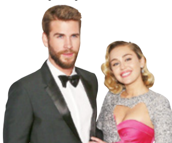
Liam Hemsworth and Miley Cyrus

Newly married pop singer Miley Cyrus stood in for her Hollywood actor husband Liam Hemsworth on Monday, attending the premiere of his latest film "Isn't It Romantic" on his behalf as he was unwell.