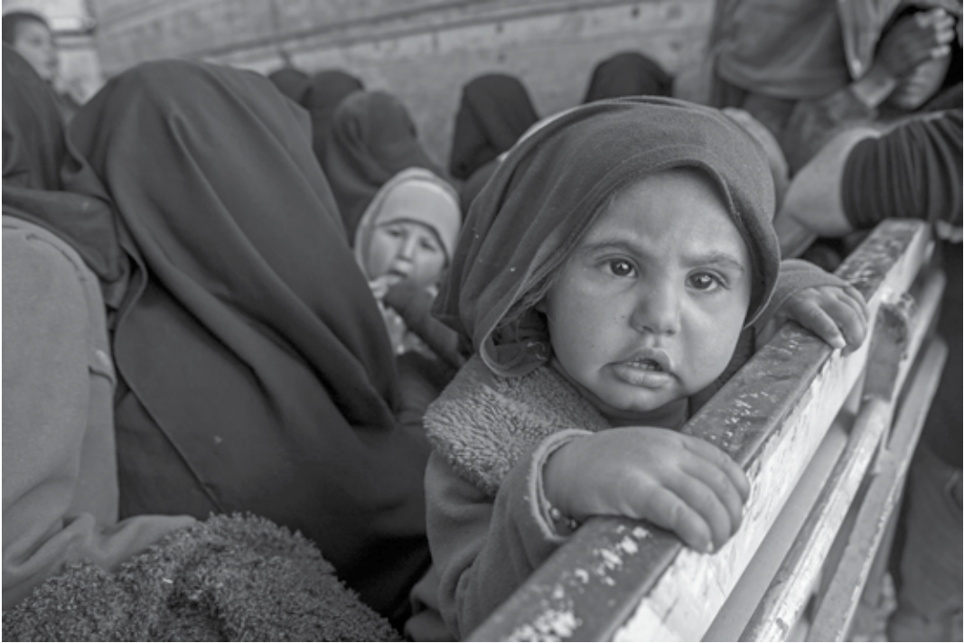
Women and children fleeing from the last Islamic State group's tiny pocket in Syria sit in the back of a truck near Baghuz, eastern Syria

US-backed forces pressed the battle to expel die-hard jihadists from the last pocket of land under their control in eastern Syria yesterday after hundreds fled the holdout overnight. Outside the “Baghouz pocket”, the plains were littered with empty pistachio-coloured rocket shells, water bottles, clothes left behind, and rotting dog carcasses. The extremist group declared a cross-border “caliphate” in Syria and Iraq in 2014, but various military campaigns have chipped it down to a fragment on the Iraqi border. After a pause of more than a week to allow out civilians, the Syrian Democratic Forces (SDF) declared a last push to retake the pocket from the extremists on Saturday. Aided by the warplanes and artillery of a US-led coalition, the Kurdish-led alliance has pressed into a patch of four square kilometres (one square mile). SDF spokesman Mostefa Bali said heavy clashes were under-