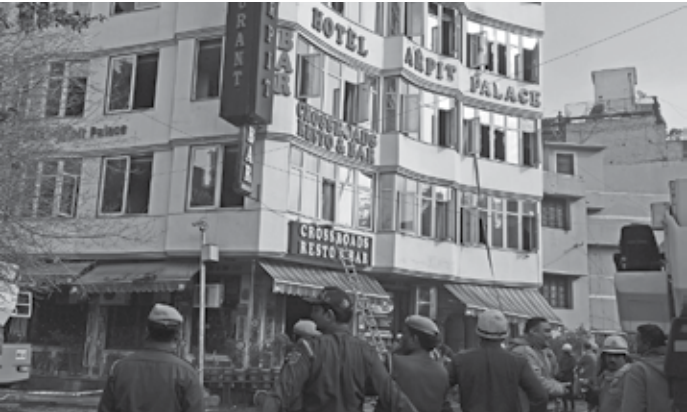
Delhi Fire Services (DFS) and Delhi police personnel stand outside Hotel Arpit Palace after extinguishing a fire that broke out on its premises race being used as an open air restaurant. He also directed the fire department to inspect other buildings in the congested area and file a report within a week. Three Myanmar citizens staying at the hotel were missing, the NDTV news network reported.

At least 17 people died when a fire ripped through a budget hotel in Delhi yesterday, prompting authorities to launch a safety check of other buildings in the vicinity. Victims included a woman and a child who jumped from a window to escape the blaze that broke out before dawn at the budget Hotel Arpit Palace. Images showed flames and thick smoke billowing out of the top floor of the hotel, located in a congested part of the Indian capital. Guests at the hotel -- popular with budget and business travellers -- were unable to use corridors to escape because of wooden panelling, according to a fire officer. Delhi home minister Satyendra Jain told reporters that rules were flouted to construct extra floors, with a ter-