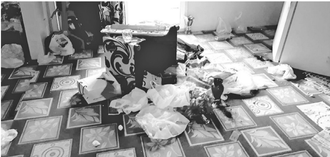
Polythene bags and other materials strewn across the floor of the apartment.

The widow, who lives alone with no children, said the robbers