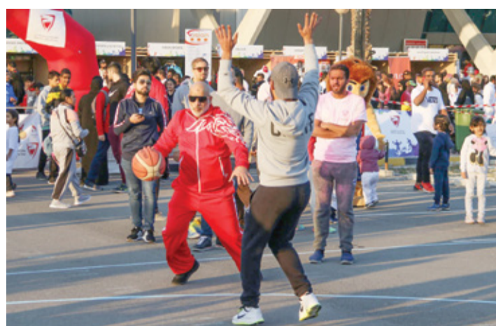
Various sporting activities were organised to mark the occasion.