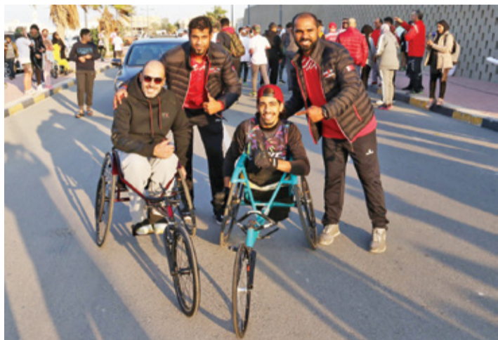
Many specially-abled individuals took part in the event held at National Stadium.

Among others, the Interior Ministry, the Ministry of Labour and Social Development and Capital Governorate held a raft of activities marking the occasion.