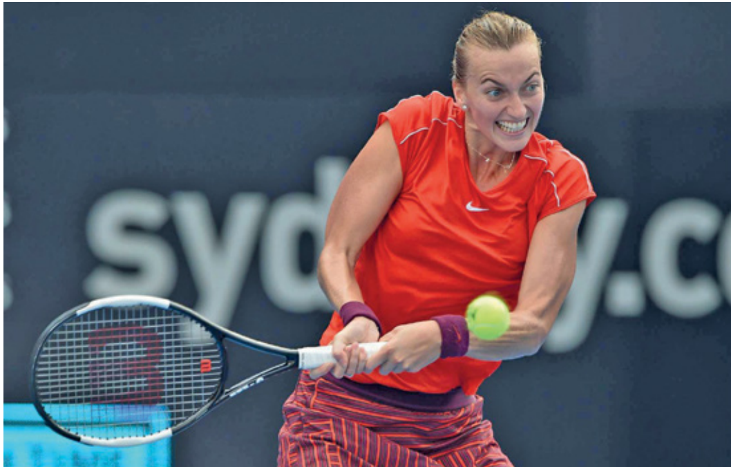
Petra Kvitova of the Czech Republic hits a return to Australia's Ashleigh Barty

Barty raced through the opening set after breaking the big-serving Kvitova in the first game on back-to-back double faults.