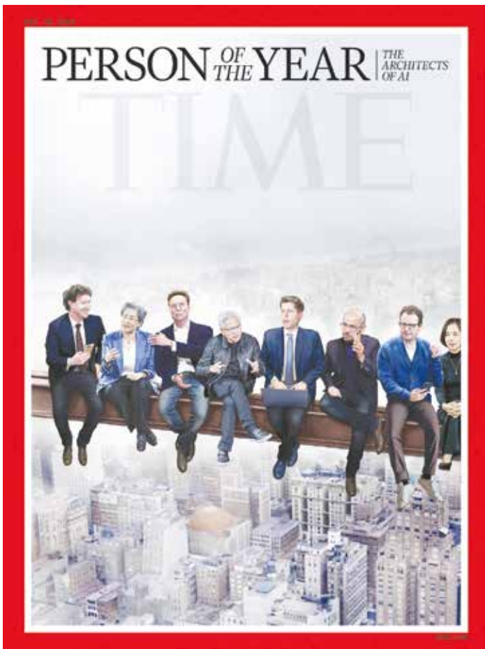
The cover of TIME Magazine featuring an illustration by Peter Crowther