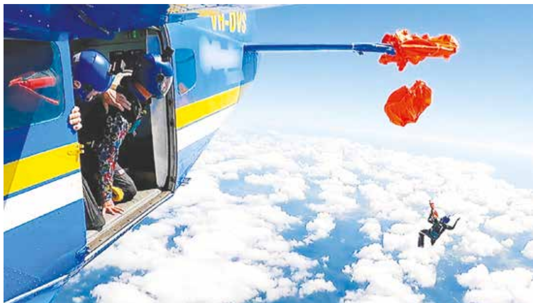
The moment a skydiver was left dangling thousands of metres in the air after their parachute caught on the plane’s tail.

The jumper was flung backwards -- their legs striking the aircraft -- as the orange reserve parachute wrapped itself around the plane’s tail.