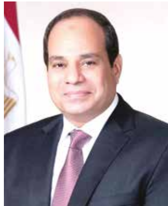
President El Sisi

They also agreed on the importance of fully implementing the US President Donald Trump’s peace plan in accordance with UN Security Council Resolution 2803, as a framework for achieving a just and comprehensive peace.