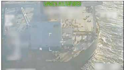
Screen grabs from a video posted by US Attorney General Pam Bondi on her X account shows what Bondi says is the execution of "a seizure warrant for a crude oil tanker used to transport sanctioned oil from Venezuela and Iran" off the coast of Venezuela