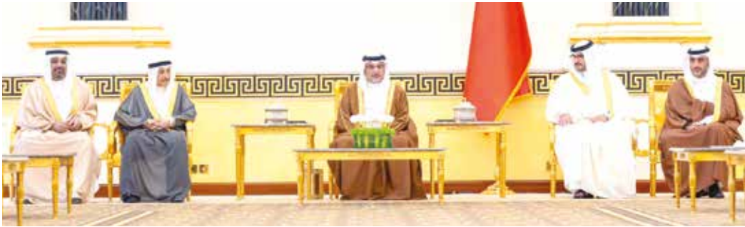
HRH the Deputy King with newly appointed directors across government entities

HRH Prince Salman emphasises serving citizens as Kingdom top priority