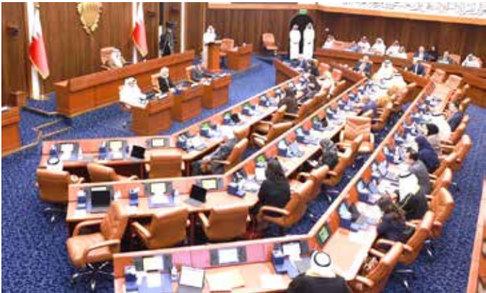
Shura Council session in progress

by the Labour Ministry in coordination with the LMRA and approved by the Cabinet every four years, would be obligated to include an upper limit on total work permits — whether across all sectors or defined by occupation or economic activity.