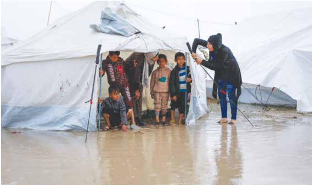
A woman fixes her tent as children stand inside at a makeshift camp sheltering displaced Palestinians after heavy rains in the Zeitoun neighbourhood of Gaza City

Top Hamas leader Khaled Meshaal told Qatari news channel Al Jazeera that the group is open to a weapons "freeze", but rejects the demand for total disarmament put forward in Trump's plan for the Palestinian territory.