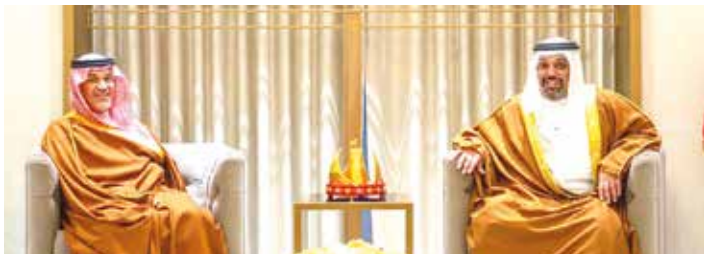
H.E. Shaikh Salman bin Khalifa Al Khalifa with Fahad bin Abduljalil Al Saif

mitment to strengthening cooperation with regional and international financial institutions to create quality opportunities.