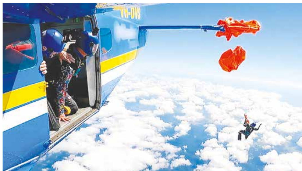
The moment a skydiver was left dangling thousands of metres in the air after their parachute caught on the plane's tail.

The jumper was flung backwards -- their legs striking the aircraft -- as the orange reserve parachute wrapped itself around the plane's tail.