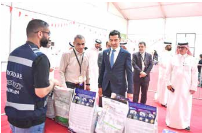
H.E. Wael bin Nasser Al Mubarak tours the venue TDT | Manama

His Excellency Wael bin Nasser Al Mubarak, Minister of Municipalities and Agriculture Affairs, visited the Bahrain International Exhibition “Mara’ee 2025”, held under the patronage of His Majesty King Hamad bin Isa Al Khalifa. The visit included a tour of the exhibition’s various pavilions, during which the minister met with farmers, breeders, and representatives of participating companies and institutions, and reviewed the latest agricultural and animal projects and initiatives on display. The minister also visited the Bahrain Mangrove Exhibition, highlighting national efforts to quadruple the number of mangrove trees by 2035, along-