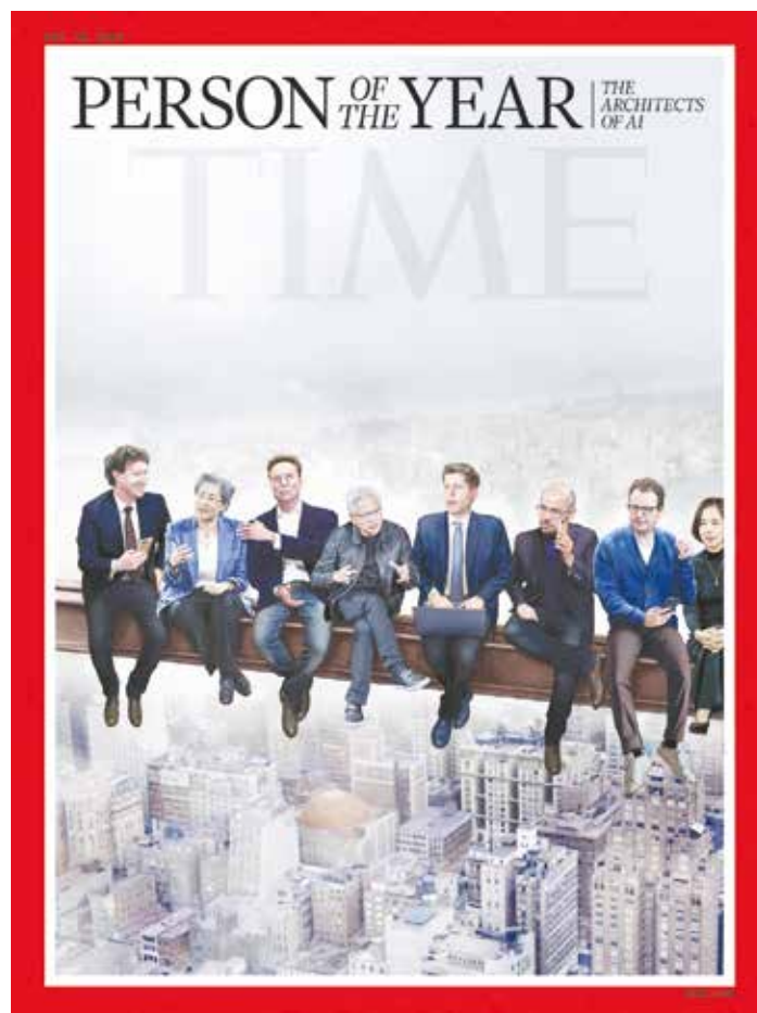
The cover of TIME Magazine featuring an illustration by Peter Crowther