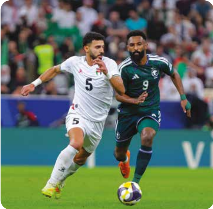
Action from Saudi Arabia's thrilling extra-time win vs Palestine