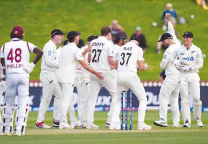
New Zealand players celebrate West Indies' Anderson Phillip (L) being caught with LBW during day two of the 2nd international Test cricket match between New Zealand and West Indies at the Basin reserve in Wellington

of the visiting bowlers, taking 3-70 in 13 overs. Kemar Roach had figures of 2-43.