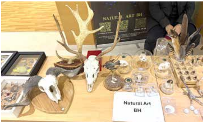
Pottery-making and natural art displays delight visitors

The booth invited both curiosity and contemplation, prompting visitors to linger far longer than they anticipated,