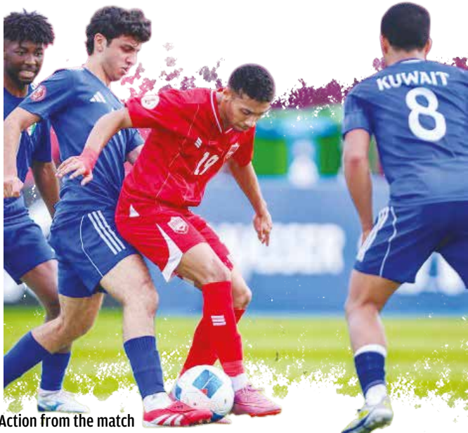
Hussain Almaskati TDT | Manama

Bahrain's U23 national team saw their Gulf U23 Cup campaign come to an end yesterday following a 2-1 defeat to Kuwait at Aspire Zone 2 in Doha, a result that confirmed their exit from the tournament with no points from three matches. Kuwait took control early, breaking the deadlock in the 15th minute through a moment of brilliance from Ahmad Boodai, who unleashed a sensational free kick from nearly 40 yards. His strike sailed over the wall and rocketed into the top corner, leaving Bahrain goalkeeper Mohamed Arhama with no chance. The Kuwaitis extended their lead before the break when Montaser Al Abdul-