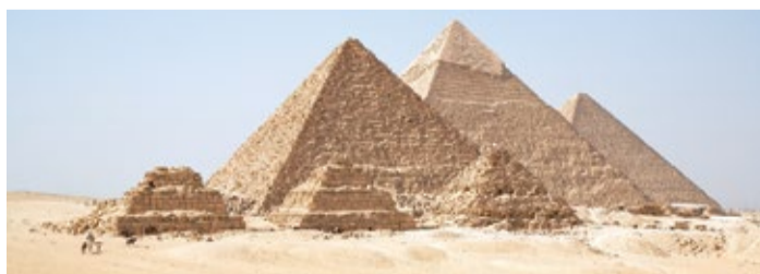
The pyramids in Giza is a Unesco heritage site.

en in late November but it was published on YouTube on December 8.