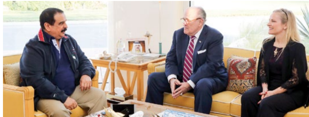
His Majesty King Hamad bin Isa Al Khalifa yesterday received former New York mayor and adviser to US President Donald Trump, Rudy Giuliani and the accompanying delegation at the Safriya Palace. HM the King praised the longstanding Bahraini-US relations, noting keenness of the two countries to constantly develop them. Topics of joint interests were also discussed.