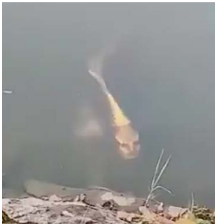
The carp, with its face marking resembling a human, was found by a visitor to Miao Village in China

Residents in northeastern Taiwan's Yilan Country also reported sighting a black-and-white carp with features resembling a human face.