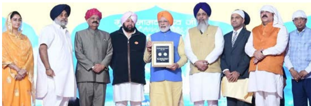
Prime Minister Narendra Modi releasing a commemorative coin celebrating 550th Birth Anniversary of Guru Nanak Dev Ji

The deal allows for up to 5,000 pilgrims a day to cross.