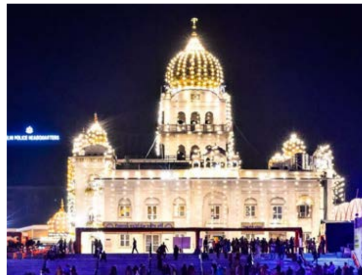
Gurdwara Bangla Sahib seen illuminated on the occasion of the 550th birth anniversary of Guru Nanak Dev ji, in New Delhi