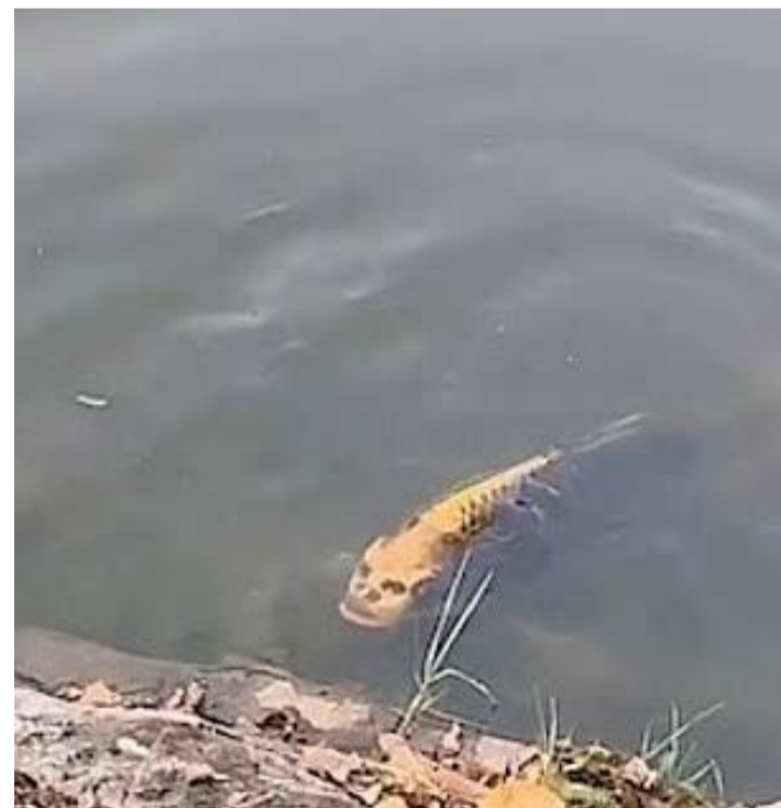
A side view of the British man's carp shows it looking a lot more fish-like. The fish, owned by Brendan O'Sullivan of Dagenham in Essex, was said to be worth an estimated £40,000