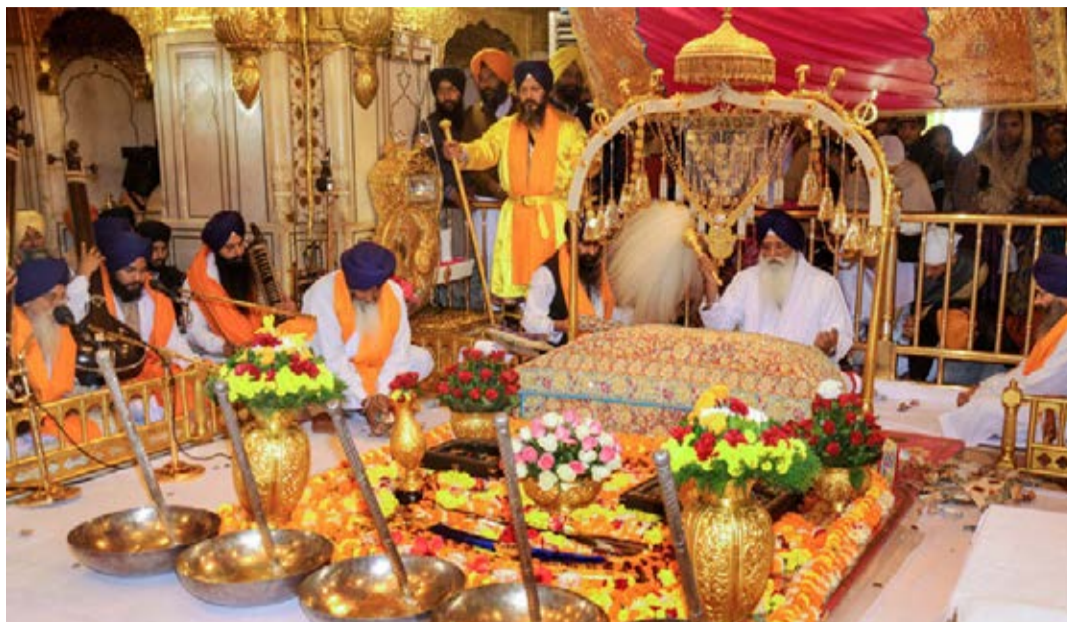
A display of 'Jalao' (Sikh symbolic items), inside the Sri Harmandir Sahib (Golden Temple) on the occasion of the 550th birthday anniversary of Guru Nanak Dev Ji, the founder of the Sikh faith, in Amritsar

occasion of the 550th Birth Anniversary of Guru Nanak Dev Ji, several programmes are being held across the country and the world through Embassies.