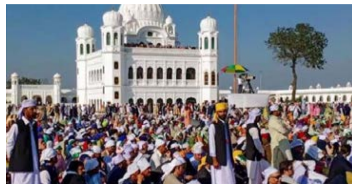
Sikh pilgrims visit the shrine of their spiritual leader Guru Nanak Dev, at Gurdwara Darbar Sahib in Kartarpur, Pakistan