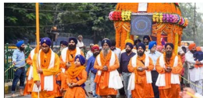
Sikh devotees participate in a religious procession during the 550th birth celebrations of their founder guru, Guru Nanak Dev, in Patna