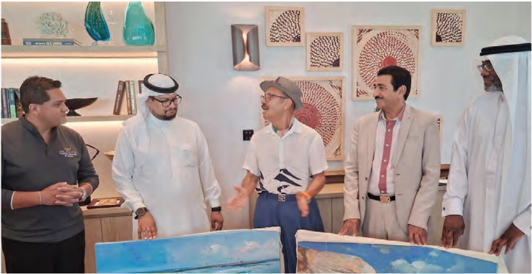
Friends of Dilmun Tour Guides organise a trip to the Hawar Islands

He added that their diverse natural resources and advanced hospitality facilities “make the Hawar Islands a true source of national pride.” His comments came during a scouting trip organized by the Friends of Dilmun Tour Guides Association in coordination with the resort’s management.