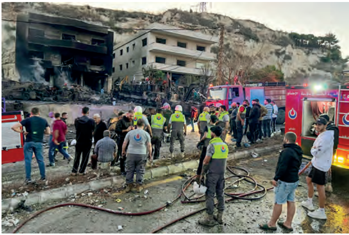
Rescuers and first-responders stand outside a damaged building following an overnight Israeli strike in Al-Msayleh area in southern Lebanon

"The seriousness of this latest attack lies in the fact that it comes after the ceasefire agreement in Gaza," he added, questioning whether Israel now sought to expand its attacks on Lebanon.