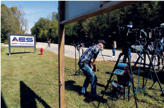
Television media set up outside of Accurate Energetic Systems

"There are fatalities. I don't want to put a number to that... I can tell you right now we are looking for 19 individuals."