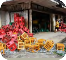
Magnitude 6.0 quake hits off southern Philippines: USGS