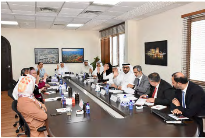
Capital Trustees Board meeting in progress