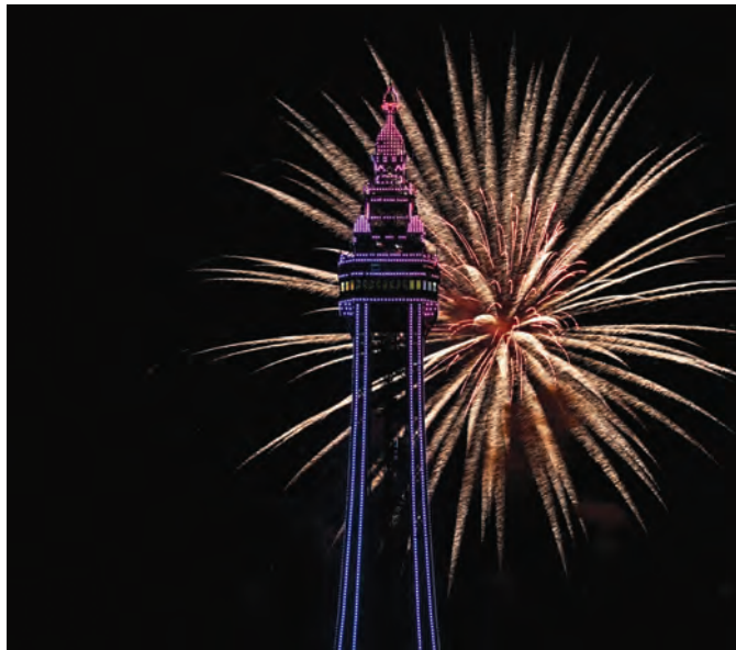
The Canadian entry in the world fireworks championship is pictured near the Blackpool Tower, in northern Blackpool.