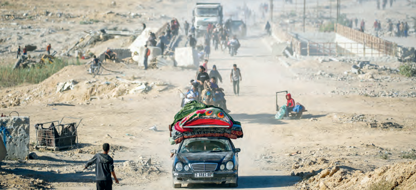
Palestinians make their way to Gaza City through the so-called “Netzarim corridor” from Nuseirat in the central Gaza Strip

including for “international participation in the Sharm El-Sheikh summit, as well as preparations for the implementation of the first phase of the (ceasefire) deal”. French President Emmanuel Macron is set to travel to Egypt today to back the deal, the Elysee Palace said, while Spain’s Pedro Sanchez and Italy’s Giorgia Meloni are also expected to attend, their offices told AFP. Earlier Trump had said he would meet a “lot of leaders” in Egypt on Monday to discuss the future of devastated Gaza.