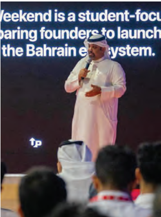
H.E. Shaikh Salman bin Khalifa Al Khalifa speaks at the event

These efforts aim to drive sustainable economic growth and create high-quality opportunities for Bahraini citizens. Shaikh Salman praised the Startup Bahrain Weekend initiative as a national model that inspires young Bahrainis to turn creative ideas into pioneering projects.