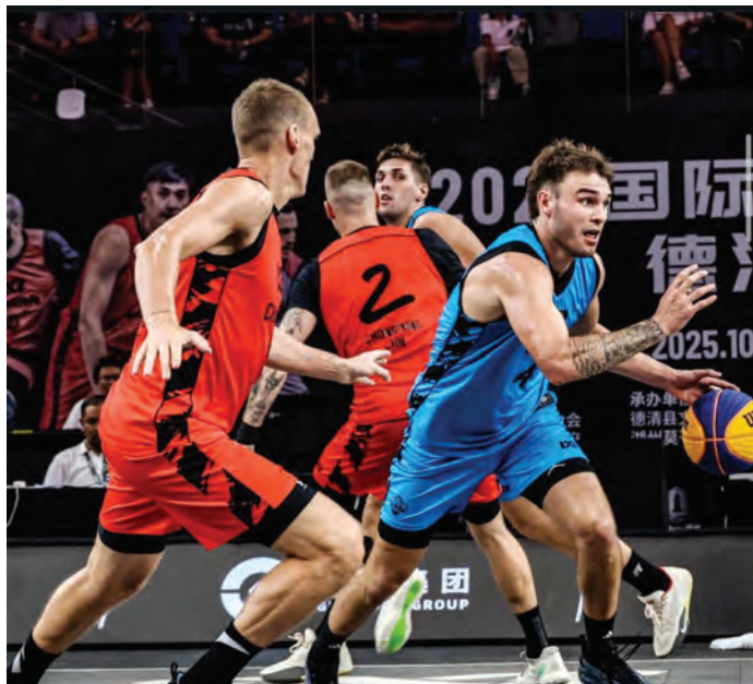
Action from Riffa's match

Bahrain's representatives will face Group 2 leaders Toulouse of France today at 11:50am Bahrain time, a fixture that offers an opportunity to extend their strong tournament form and advance to the semi-finals.