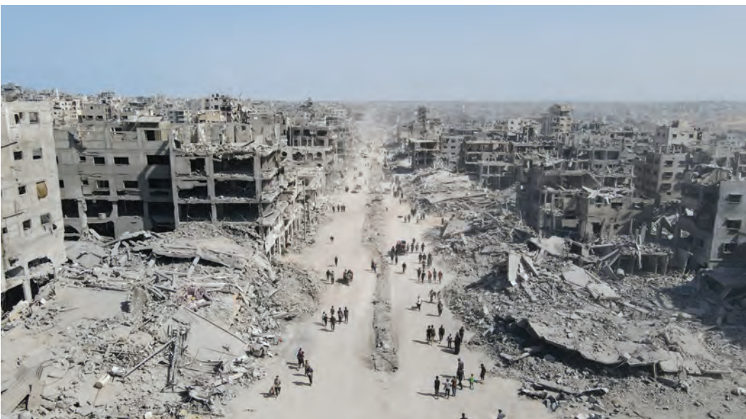
In this aerial view, people walk amid the destruction in Gaza City in the northern Gaza Strip, a day after a ceasefire took effect.

In an interview with AFP in Qatar, Hossam Badran, a member of Hamas's political bureau, warned: "The second phase of