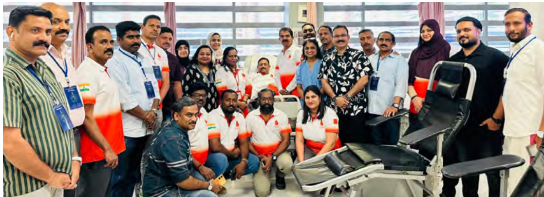
Event organisers with blood donors