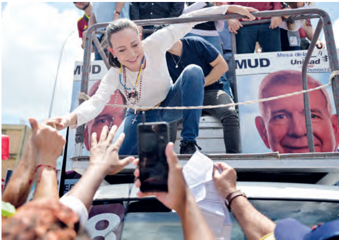
Venezuelan opposition leader Maria Corina Machado (C) stretches out to greet supporters during a protest called by the opposition for election 'victory' to be recognised, in Caracas