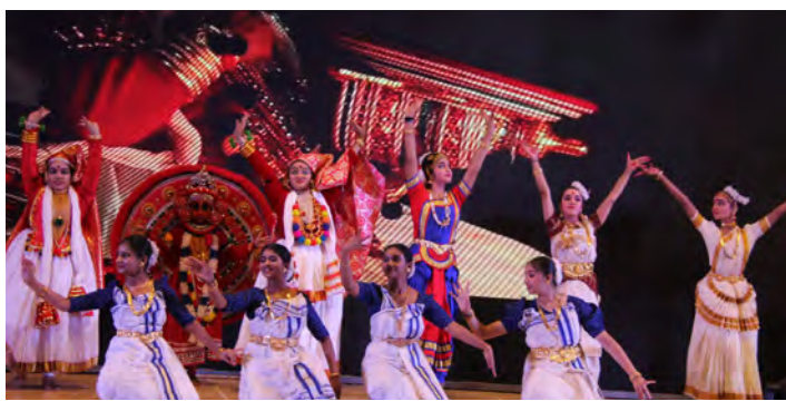
Traditional Indian dances captivate the audience