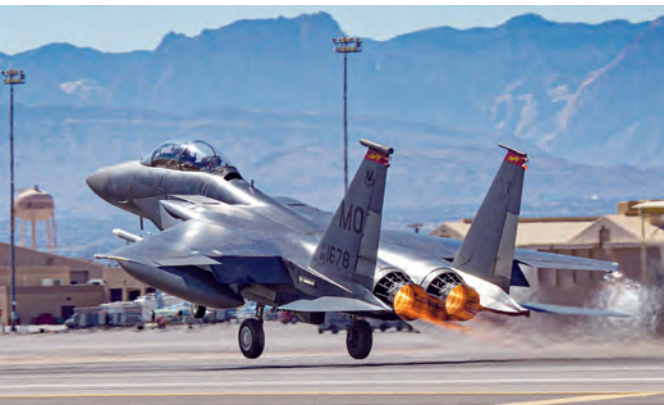
Washington, United States

US Defense Secretary Pete Hegseth announced Friday that Qatar will be allowed to build an air force facility at Mountain Home Air Base in Idaho that will house F-15 fighter jets and pilots. “We’re signing a letter of acceptance to build a Qatari Emiri Air Force facility at the Mountain Home Air Base in Idaho,” Hegseth said at the Pentagon, with Qatari Defense Minister Sheikh Saoud bin Abdulrahman Al-Thani at his side. “The location will host a contingent of Qatari F-15s and pilots to enhance our combined training” as well as “increase lethality, interoperability,” he said. “It’s just another example of our partnership. And I hope you know, your excellency, that