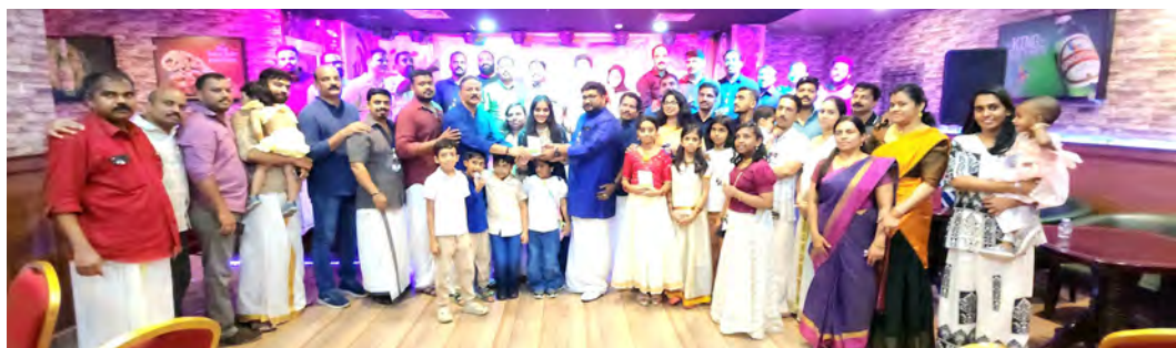
KPF Bahrain officials and members with families and other attendees

by a festive spirit, with enthusiastic participation from members, families, women, and children.