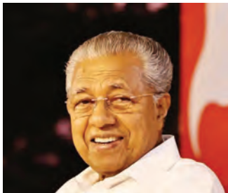
Pinarayi Vijayan for the CM's visit.