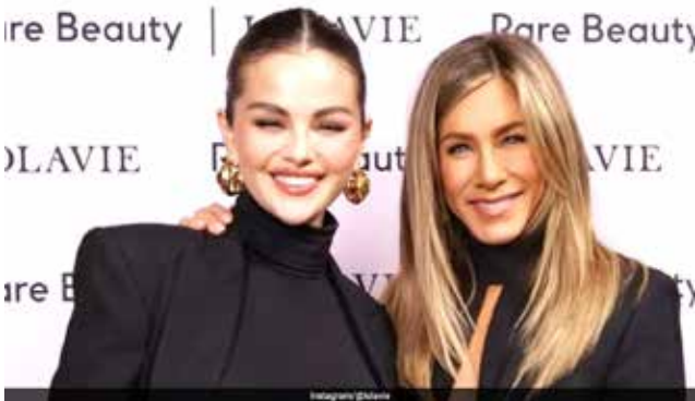
Selena Gomez and Jennifer Aniston

Jennifer Aniston has revealed Selena Gomez has helped her to “lean into social media”.