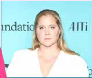
Amy Schumer Bang Showbiz | Los Angeles