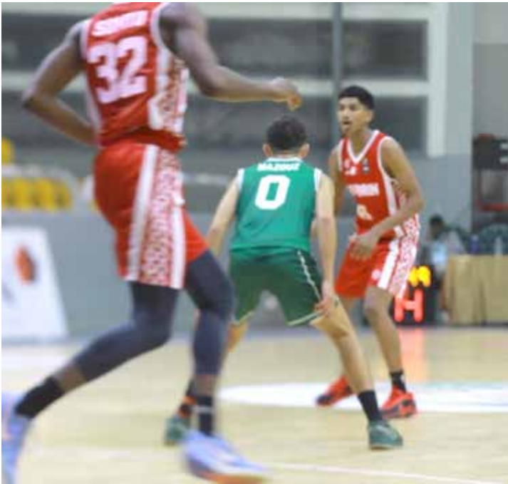
Action from the match

the paint. The shift was decisive, as Algeria never recovered.