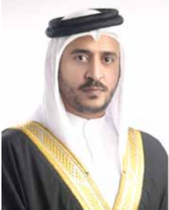
His Highness Shaikh Khalid bin Hamad Al Khalifa,