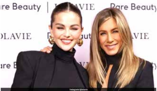
Selena Gomez and Jennifer Aniston | Los Angeles

Jennifer Aniston has revealed Selena Gomez has helped her to “lean into social media”. The 56-year-old actress joined Instagram in late 2019 to launch her hair conditioner LolaVie Glossing Detangler, and Jennifer has shared that the Only Murders in the Building star, 33, has been an “angel” when it comes to teaching her about her online presence. Speaking with People magazine, the former Friends star said: “Selena helps me lean into social media. She’s so effortless when it comes to that. “And she’s just an angel who I love spending time with.” Jennifer added her Friends co-star Courteney Cox - who also has her own body and home range called Homecourt - had given her a helping hand when it comes to product design. She continued: “What haven’t I learned from Courteney?” “We usually talk inter-