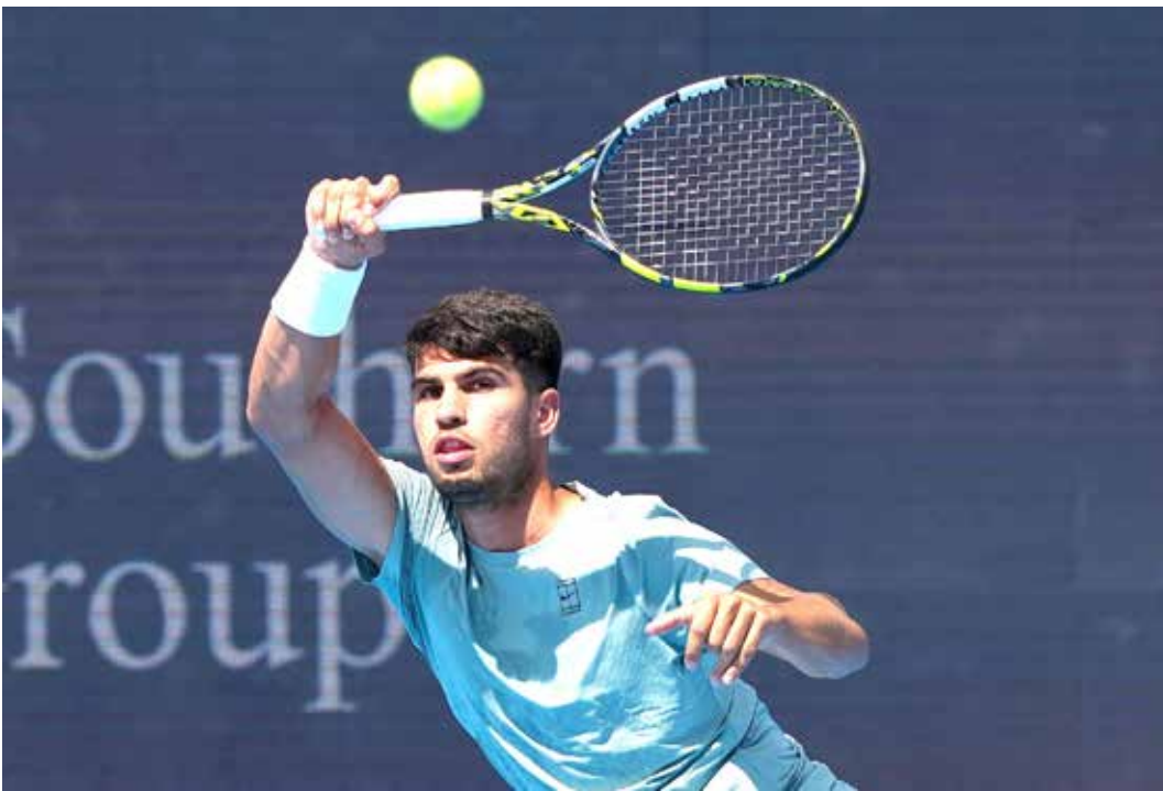
Carlos Alcaraz of Spain plays a forehand during the match against Damir Džumhur of Bosnia and Herzegovina