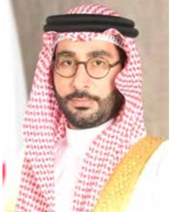
Aymen bin Tawfiq Al Moayed, Secretary-General of the Supreme Council for Youth and Sport (SCYS)