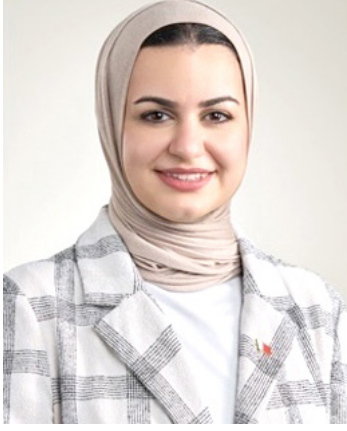
Rawan bint Najeeb Tawfiqi, Minister of Youth Affairs