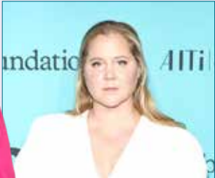
Amy Schumer Bang Showbiz | Los Angeles