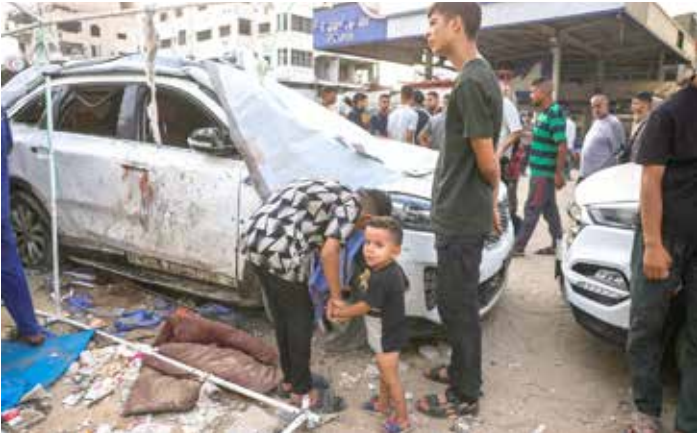
Palestinians check the destroyed Al Jazeera tent and a car at Al-Shifa Hospital in Gaza City

Humanity's best hope "A two-state solution is humanity's best hope to break the cycle of violence in the Middle East and to bring an end