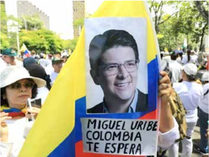
A woman holds a national flag during the so-called “Silent March” to show support for the health of Senator Miguel Uribe Turbay (file photo)

◆ A mudslide in northern Pakistan yesterday swept over a group of villagers attempting to fix a water channel damaged in recent monsoon rains, killing seven people, officials said. More than 300 people have been killed across the country since the monsoon season began on June 26, the National Disaster Management Authority said. Volunteers had been working through the night in the northern city of Peshawar to fix a man-made water channel when part of the group was buried under a mudslide, the region's disaster agency said.