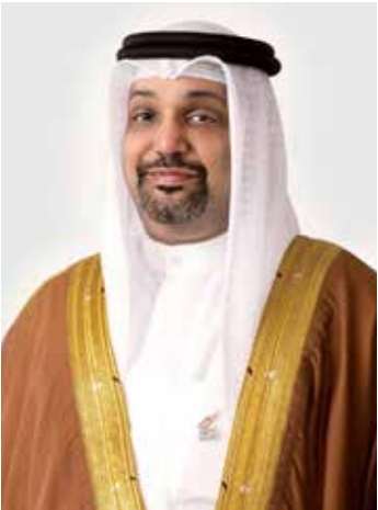
H.E. Shaikh Salman bin Khalifa Al Khalifa, Minister of Finance and National Economy

a 2.2 percent rise in non-oil activity and a 5.3 percent increase in oil activity. In nominal terms, GDP was up 3.0 percent, with