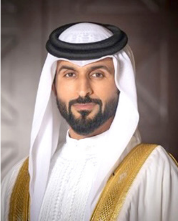
HH Shaikh Nasser

Nation's top voices rally for Youth City 2030 on International Youth Day