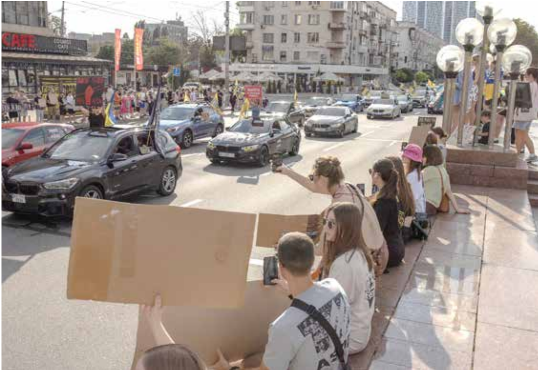
Campaigners with placards and flags take part in a rally to raise awareness to the fate of Ukrainian prisoners of war from the Azov Brigade and other military units, in Kyiv

European leaders plan talks with Ukrainian President Volodymyr Zelensky and US President Donald Trump on Wednesday, two days before Trump is set to meet Russia's Vladimir Putin in Alaska to discuss the Ukraine war, Berlin said. German Chancellor Friedrich Merz has invited the French, British and other European leaders and the EU and NATO chiefs to the virtual talks, his spokesman said, amid fears across Europe that any deal made without Ukraine could force unacceptable compromises. Merz's office said yesterday the video conference in various rounds of talks would discuss "further options to exert pressure on Russia" and "preparation of possible peace negotiations and related issues of territorial claims and security". French President Emmanuel Macron's office said he and UK Prime Minister Keir Starmer were also involved in planning Wednesday's meeting of the "coalition of the willing". Trump and Putin will meet in the US state of Alaska on Friday to try to resolve the three-year war but the European Union has