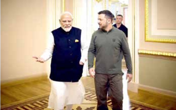
Ukraine's President Volodymyr Zelensky (R) speaking with Indian Prime Minister Narendra Modi (file photo)