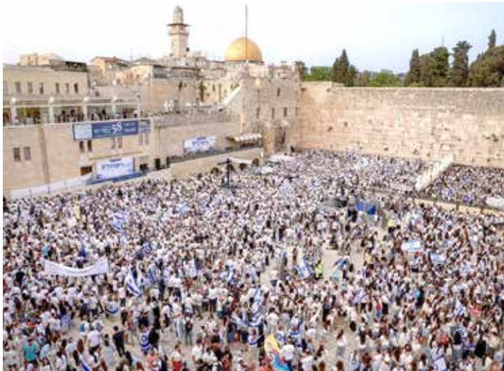
People gather at Western Wall Plaza in the old city of Jerusalem (file photo)

The incident sparked immediate outrage in Israel, with the Western Wall's Rabbi Shmuel Rabinovitch calling it a “desecration.”