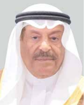
Ali bin Saleh Al Saleh, Shura Council Chairman