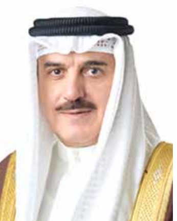
Ahmed bin Salman Al Musallam, Speaker of the Council of Representatives