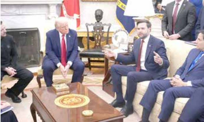
US Vice President JD Vance speaks during a meeting with President Donald Trump, Ukrainian President Volodymyr Zelensky and Secretary of State Marco Rubio in the Oval Office (file photo)

The United States was working to "schedule" a meeting between Donald Trump and his Russian and Ukrainian counterparts, Vice President JD Vance said in comments broadcast Sunday, as Ukraine's European allies pushed for Kyiv's presence at the US-Russia summit in Alaska this week. "One of the most important logjams is that Vladimir Putin said that he would never sit down with (Volodymyr) Zelensky, the head of Ukraine, and the president has now got that to change," Vance said during an interview on Fox News program "Sunday Morning Futures." "We're at a point now where we're trying to figure out, frankly, scheduling and things like that around when these three leaders could sit down and discuss an end to this conflict," Vance said when asked about his expectations for the Alaska summit on August 15. The vice president, in an in-