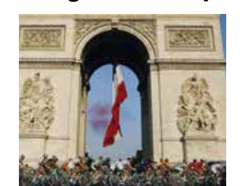
Competitors ride in Paris Paris

The 2021 roun de 2 ¬ he 2021 Tour de France ter Copenhagen's staging of the 'Grand Depart' was pushed back by a year due to a potential clash with soccer's postponed European Championship, race organisers said.