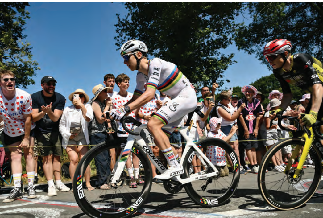
UAE Team Emirates - XRG team's Slovenian rider Tadej Pogacar (L) cycles ahead of Team Visma - Lease a bike team's Danish rider Jonas Vingegaard in the ascent of Mur-de-Bretagne during the 7th stage

Fans cheered for Vauquelin along much of the route. On Thursday a hot-air balloon flew over the peloton with his face