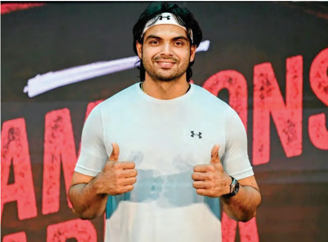
Neeraj Chopra at a commercial appearance near New Delhi