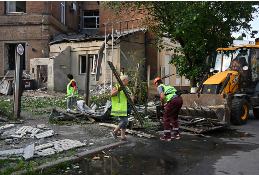
Communal workers clear rubble outside residential houses following Russian drone strikes in Odesa

Ukrainian drone and shelling attacks killed three people in Russia yesterday, while Russian bombardments on east Ukraine forced the evacuation of a maternity centre in Kharkiv and wounded nine. Russian air defence systems intercepted 155 Ukrainian drones overnight, Moscow said, an attack that comes after Russia pounded Ukraine in successive nightly attacks targeting the capital Kyiv. There was one dead in the Lipetsk region and another was killed in the western Tula region from the drone attacks, local officials said. Ukrainian shelling later killed another civilian in the border region of Belgorod, the governor announced. Both Kyiv and Moscow have stepped up their aerial strikes over recent months as the Kremlin rejects calls to halt its three-year invasion. The Kremlin yesterday restated its opposition to a European peacekeeping force in Ukraine, a day after French President Emmanuel Macron said Kyiv's allies had a "plan that is ready to go and initiate in the hours after a