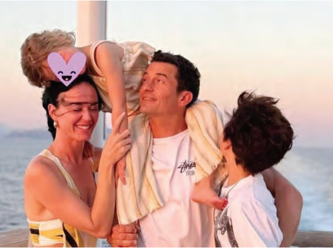
Orlando Bloom and Katy Perry are seen in a family photo shared by the actor