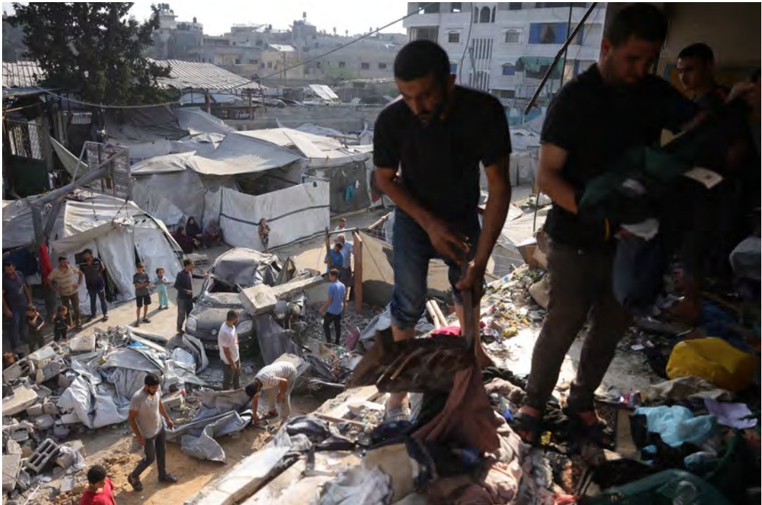
Palestinians inspect the damage at the site of an overnight Israeli strike on the Halima Saadiya school in Jabalia in the northern Gaza Strip territory.

The civil defence reported six more people killed in four separate Israeli air strikes in the area of Khan Yunis, in the south of the