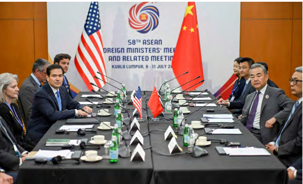
US Secretary of State Marco Rubio (2nd L) meets with China's Foreign Minister Wang Yi (2nd R)