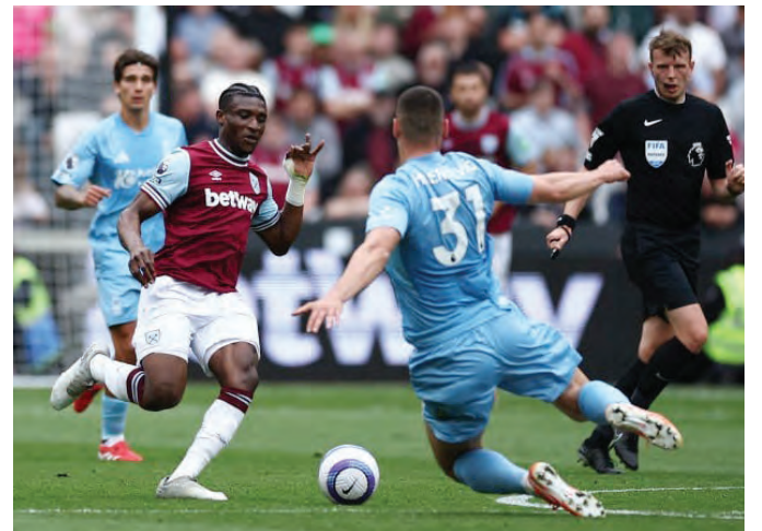
West Ham United's Mohammed Kudus and Nottingham Forest's Nikola Milenkovic (R) vie for the ball (file photo)