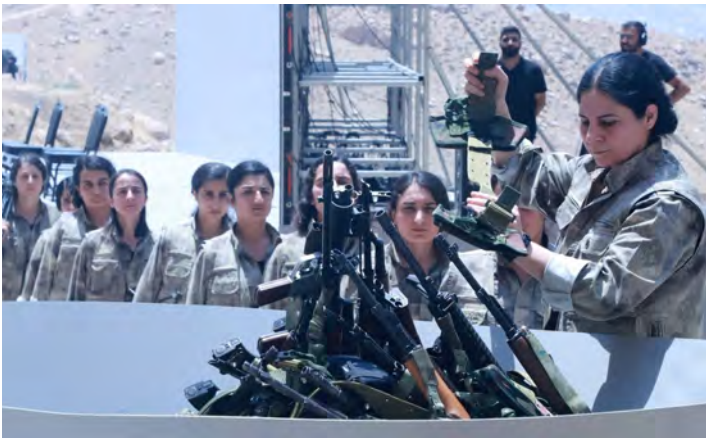
Fighters with the Kurdistan Workers' Party (PKK) line up to put their weapons into a pit during a ceremony in Sulaimaniyah