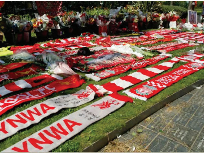
Liverpool scarves are seen beside flowers left at a memorial set up close to Anfield football ground