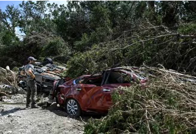
A man searches for missing people by a crushed car near the Guadalupe River in Hunt, Texas