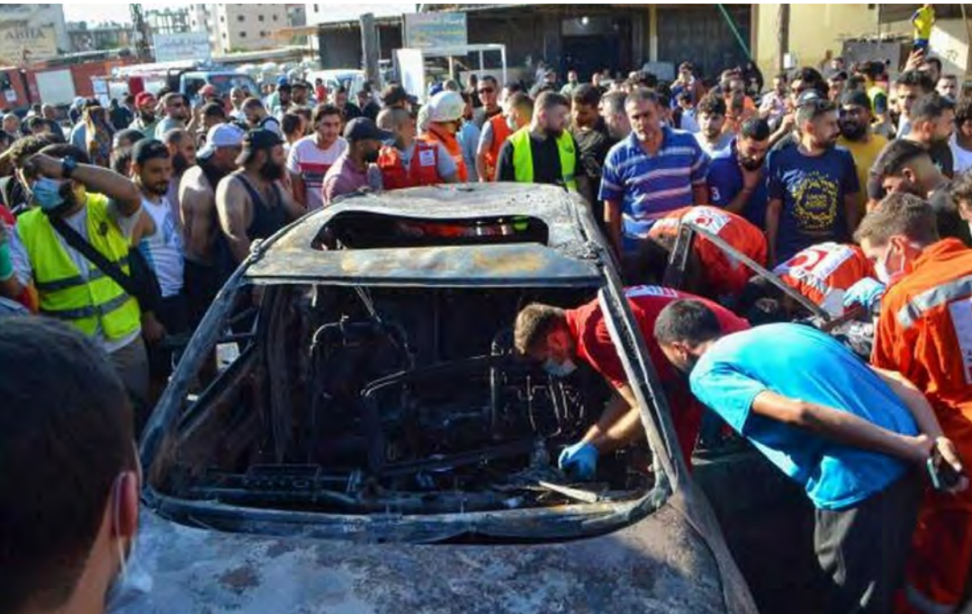
Paramedics inspect a burnt vehicle, which was targeted in an Israeli airstrike, in the Ayrouniyeh area near Lebanon's northern port city of Tripoli

Lebanese President Joseph Aoun ruled out normalisation between his country and Israel yesterday, while expressing hope for peaceful relations with Beirut's southern neighbour, which still occupies parts of southern Lebanon. Aoun's statement is the first official reaction to Israeli Foreign Minister Gideon Saar's statement last week in which he expressed his country's interest in normalising ties with Lebanon and Syria. Aoun "distinguished between peace and normalisation", according to a statement shared by the presidency. "Peace is the lack of a state of war, and this is what matters to us in Lebanon at the moment. As for the issue of normalisation, it is not currently part of Lebanese foreign policy," the president said in front of a delegation from an Arab think tank. Lebanon and Syria have technically been in a state of war with Israel since 1948, with Damascus saying that talks of normalisation were "premature".