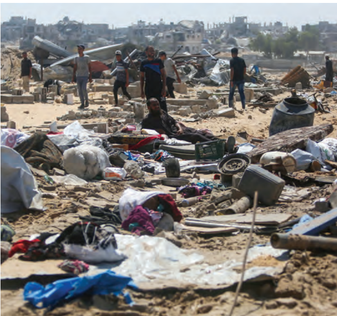
Palestinians inspect the destruction at a makeshift displacement camp following a reported incursion a day earlier by Israeli tanks in the area in Khan Yunis in the southern Gaza strip

Between the start of GHF's operations and July 7, UN Human Rights Office spokesperson Ravina Shamdasani reported that 615 people were killed near GHF sites, while another