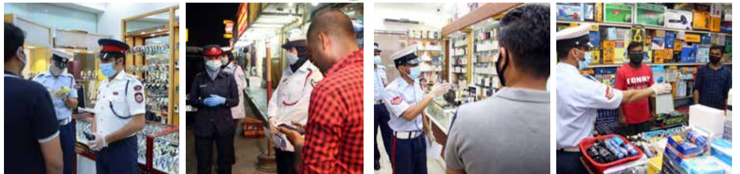
In pictures, officials during a campaign held to ensure the proper following of coronavirus precautionary measures