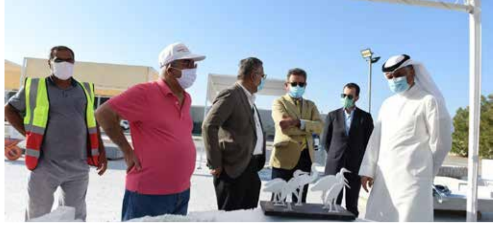
Minister Kamal bin Ahmed Mohammed during his visit to the Bahrain International Airport Marble Sculpture symposium.

The minister said: "This symposium is an opportunity to showcase the talent of Bahraini artists who, through their participation