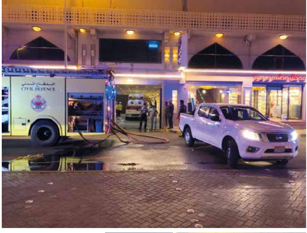
TDT | Manama

deadly blaze broke out at Aa restaurant in Sanabis claimed the life of a 44-year-old woman and injured two others.