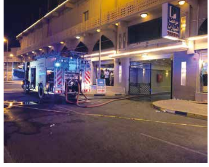
take cover from the fire on the In pictures, firefighters at the scene of the blaze

immediately rescued many oth-fered any injuries. ers who were trapped in the