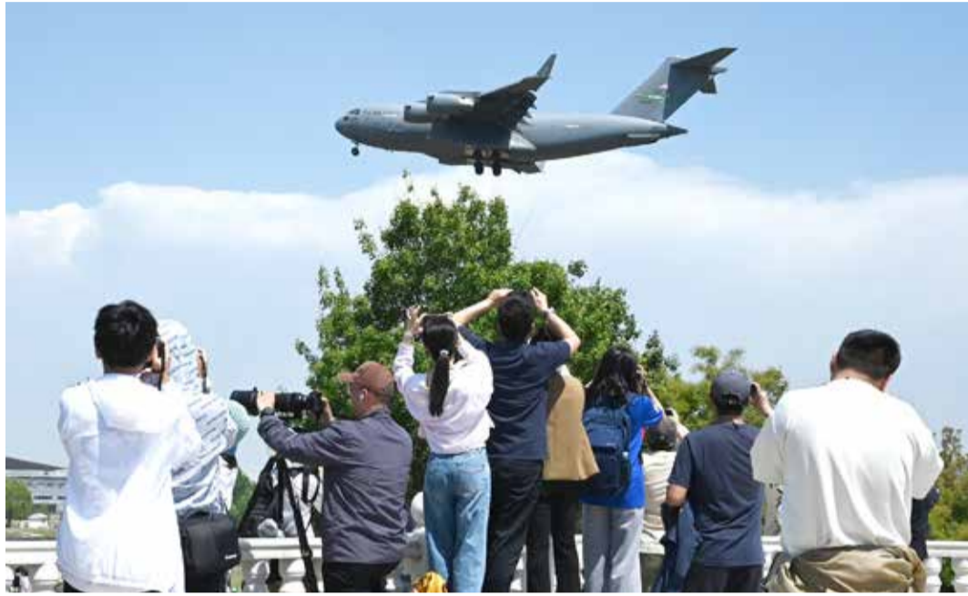
People record footage as a US Air Force C-17 Globemaster III lands at Beijing Capital Airport in Beijing on May 11, 2026, ahead of a visit by US President Donald Trump. President Trump will visit China from May 13 to 15, with the US leader expected to discuss Iran and trade with his Chinese counterpart

Washington eased some sanctions on Iranian oil in March in an attempt to address global supply shortages, but it has since