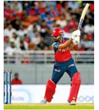
Punjab Kings' Shreyas Iyer (R) plays a shot