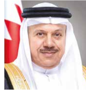
H.E. Dr. Abdullatif bin Rashid Al Zayani