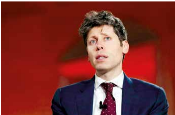
OpenAI CEO Sam Altman