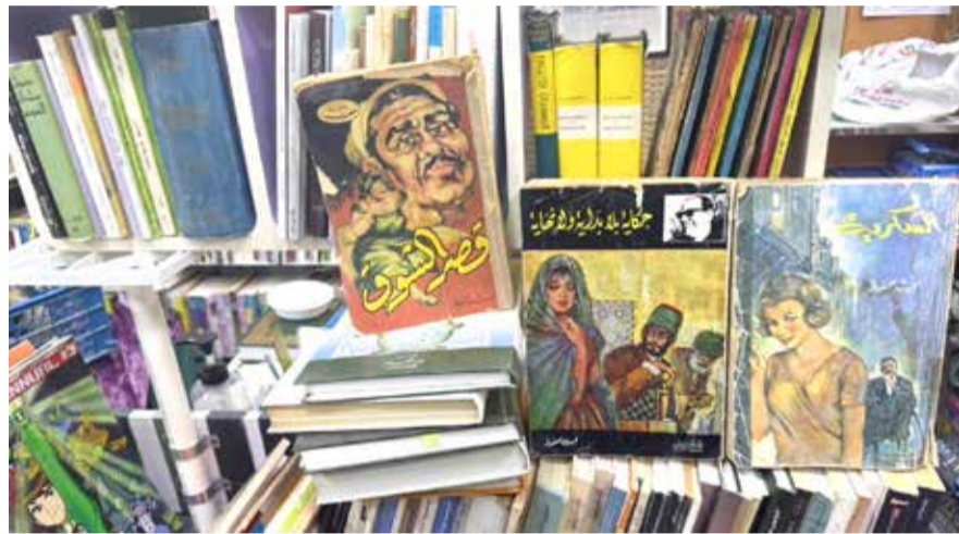
A rare copy of Qasr Al Khof, first published in 1957, is preserved as part of a timeless collection.