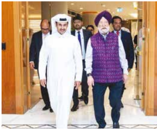
External Affairs Minister S. Jaishankar began a two-day visit to the United Arab Emirates

The country, which imports around 60 percent of its liquefied petroleum gas (LPG), relies heavily on Gulf suppliers such as Qatar, the UAE, and Saudi Arabia to meet the cooking fuel needs of its 1.4 billion population.