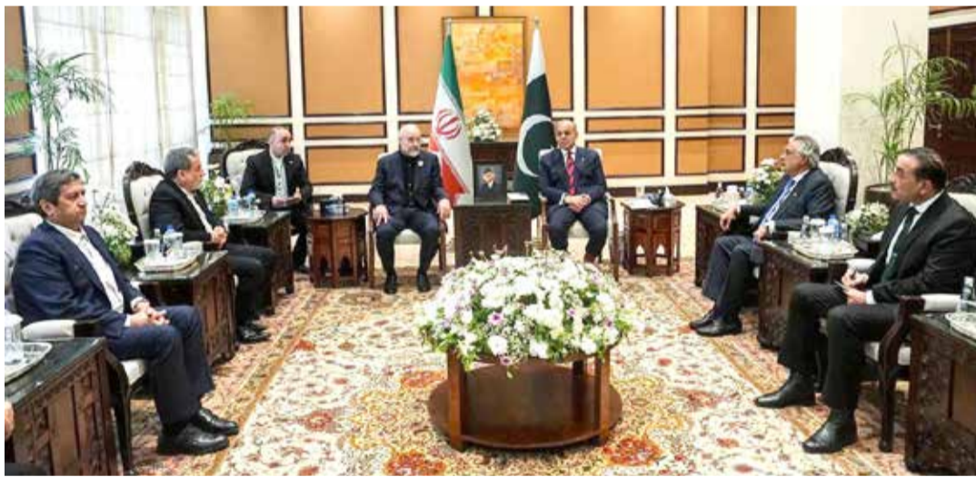
Pakistan's Prime Minister Muhammad Shehbaz Sharif met Iranian delegation led by Mohammad Bagher Ghalibaf, Speaker of the Islamic Consultative Assembly.