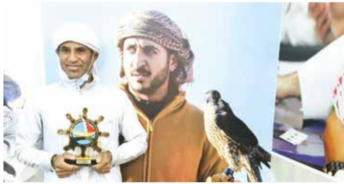
Team celebrates first place victory at the HH Shaikh Nasser's Marine Heritage Sports Season 2020

Kitab's story highlights the enduring cultural and historical importance of pearl diving in Bahrain, a tradition that once formed the backbone of the national economy. Today, while the industry has changed, natural pearls remain a symbol