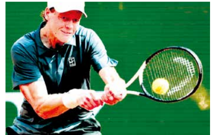
Jannik Sinner in action