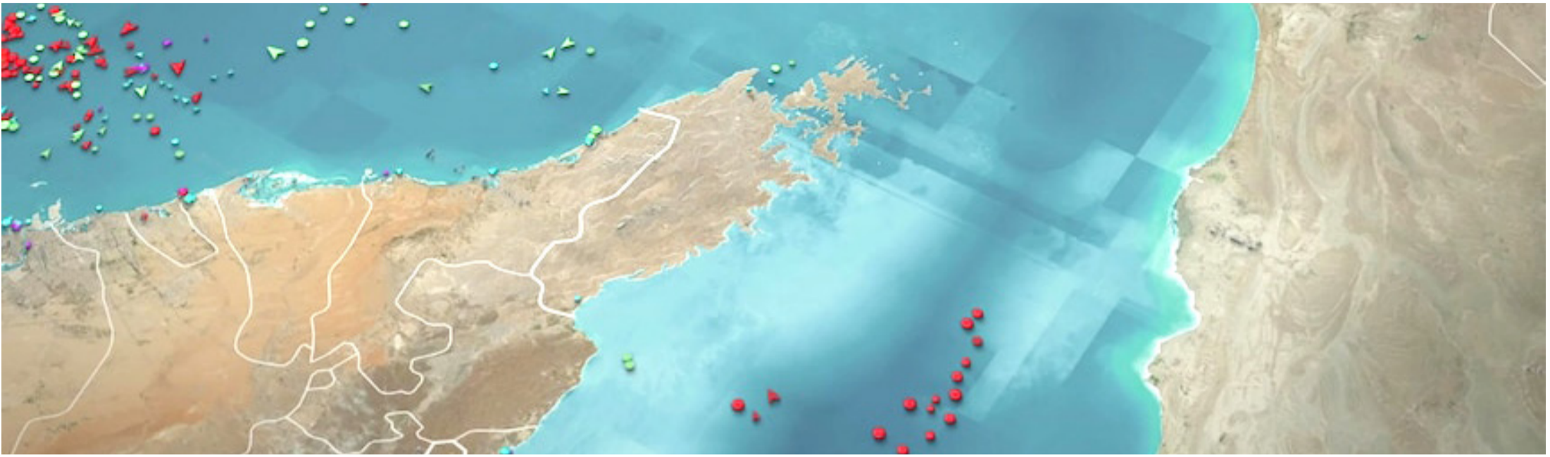
A vessel navigates the Strait of Hormuz, one of the world's most strategic and closely monitored shipping routes.

● Third round of negotiations expected as diplomacy intensifies