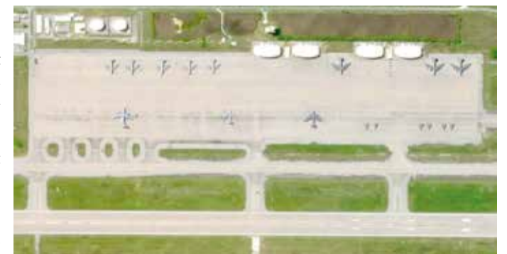
A satellite photo shows an overview of the Diego Garcia military base on the Chagos Archipelago

Trump condemned the return agreement as "an act of great stupidity" and on Satur-