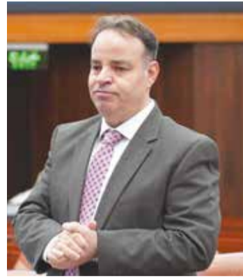
Hisham Al Ashiri, MP

Both companies are actively investing in training and development programmes to sustain and further improve Bahrainisation rates. At Alba, employees undergo structured academic, vocational, and on-the-job training, with progress assessed at key stages before transitioning into special-