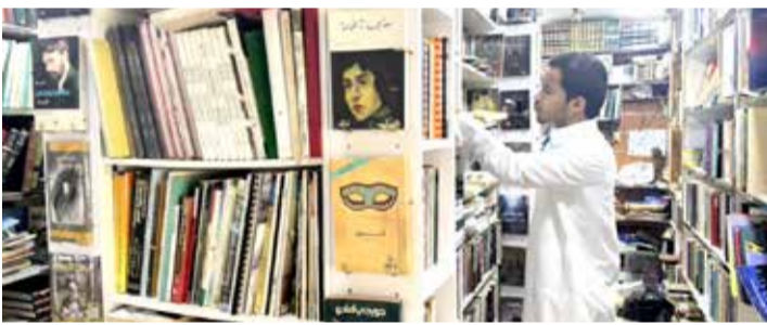
Citizens are flocking to the library to spend their time surrounded by books, turning quiet reading into a shared daily habit.

place is not just for selling, it's for sharing."