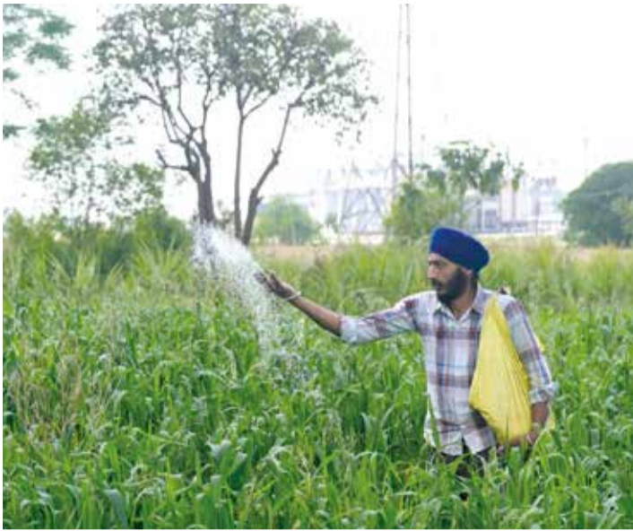
A farmer sprinkles fertiliser on crops in a field on the outskirts of Amritsar

Italy notably called last week for a "humanitarian corridor" in the Strait of Hormuz for fer-