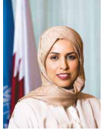
Sheikha Alia Ahmed bin Saif Al Thani

It further noted that the strikes occurred despite the adoption of UN Security Council Resolution 2817 (2026), which had condemned pre-