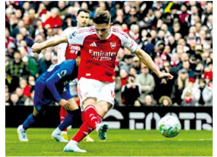
Arsenal forward Viktor Gyokeres scores from the penalty spot