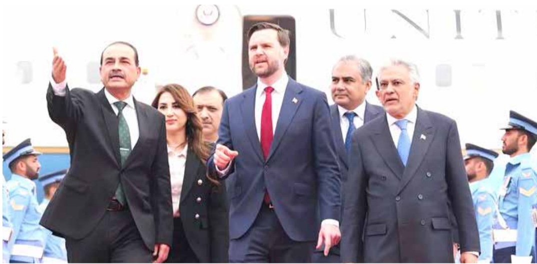
Arrival of the US delegation in Islamabad to participate in the Islamabad Talks

Iranian state television reported that a third round of talks between Iranian and US officials is expected today, though uncertainty remained over whether it would occur.