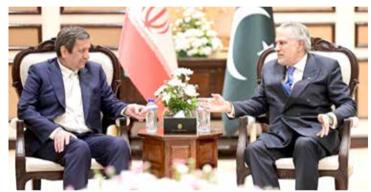
Abdolnasser Hemmati meets Mohammad Ishaq Dar on the sidelines of Islamabad talks.