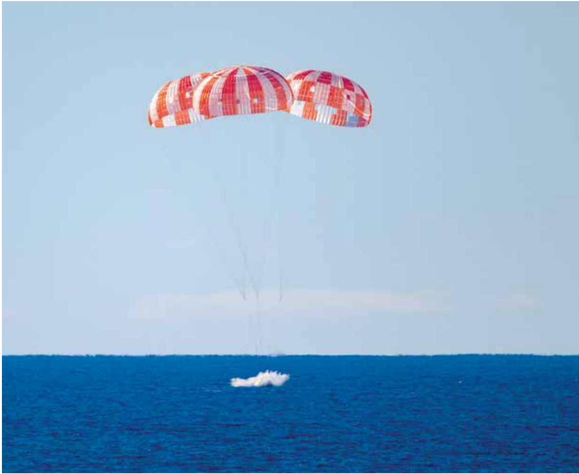
NASA's Orion spacecraft with Artemis II crew members as it lands in the Pacific Ocean off the coast of California

Soviet cosmonaut Yuri Gagarin becomes the first human to travel into space and orbit Earth, aboard the Vostok 1 spacecraft