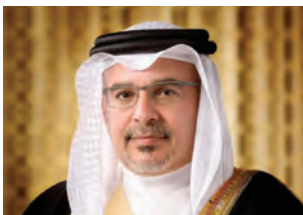
HRH Prince Salman