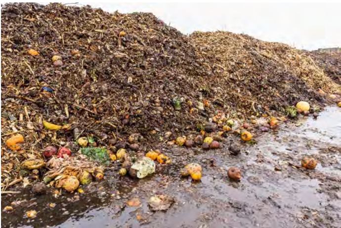
An integrated system aims to govern collection, transport, disposal, and recycling of agricultural waste

The proposal highlights the absence of clearly designated collection sites and the need for an approved regulatory framework that defines responsibilities among the relevant authorities.