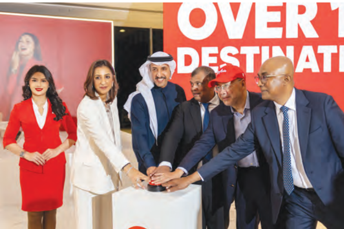
H.E. Dr. Abdulla bin Ahmed Al Khalifa, Minister of Transportation and Telecommunications, and Tony Fernandes, CEO of Capital A and advisor to AirAsia X, attend the Kuala Lumpur-Bahrain-London route launch

Introductory fares start from BD39 one way from Bahrain to Kuala Lumpur and BD41 to London, with subsequent fares from