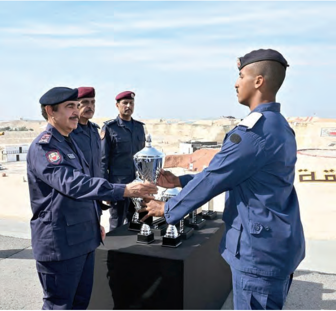
His Excellency General Shaikh Rashid bin Abdullah Al Khalifa, Minister of Interior, attended the graduation ceremony of the 39th Orientation Commando Course and several other training courses held at the Special Security Force. The ceremony included officers, cadets and personnel from various directorates of the Ministry of Interior and the Bahrain Defence Force (BDF). The ceremony was attended by the Chief of Public Security, His Highness the Governor of the Southern Governorate, and His Excellency the Undersecretary of the Ministry of Interior.