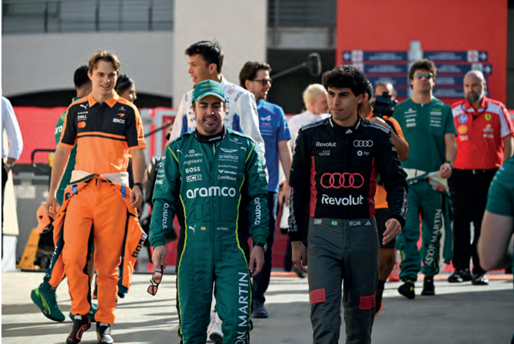
F1 drivers with Fernando Alonso and Gabriel Bortoleto in front

Bahrain International Circuit (BIC), ‘The Home of Motorsport in the Middle East’, begins welcoming the public on Thursday (Editor’s note: 12 February) for Formula 1 Aramco Pre-Season Testing 2026. Thursday will be the first of four open days to fans, who will be the first in the world to witness in person the next generation of F1 cars in action ahead of the start of the 2026 FIA F1 World Championship. The six-day tests got underway today at BIC. They have been split into two three-day sessions, with the first continuing until tomorrow and the next taking place from 18 to 20 February. Friday’s action will also be open to the public, as will the test days on 19 and 20 February. BIC’s gates are scheduled to open at 11am and close at 7pm on all four days. F1’s superstar drivers and their teams are already busy trying to maximise their track running and gather valuable data ahead of the top flight’s highly anticipated ‘new era’, featuring a host of transformative new regulations around a brand-new, more agile F1 car. All 11 F1 teams are in the Kingdom and the open days will also be the first opportunity for fans in Bahrain and worldwide to see the brand-new Cadillac F1 Team on track, joining reigning back-to-back F1 Constructors’