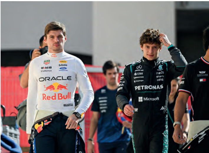
Max Verstappen and Kimi Antonelli

star drivers practice regularly to keep their skills razor sharp. Aside from these, fans visiting BIC will also have the chance to see a display of the new 2026 F1 car in its special Bahrain livery. Tickets per the open days of F1 Aramco Pre-Season Testing 2026 cost BD10 for adults and BD5 for children. There is also free access on both open days of the second Bahrain test on 19 and 20 February for all who purchased their tickets to the F1 Gulf Air Bahrain Grand Prix 2026 before 8 September last year. To buy tickets or to get more information, visit the circuit’s official website bahraingp.com or call the BIC Hotline on +973-17450000. BIC is also offering exclusive hospitality packages during the tests, featuring the best views of the action along with incredible, five-star cuisine and beverage selection. The hospitality lounge is located right above the F1 pit lane. Full details on BIC’s hospitality offerings are available on