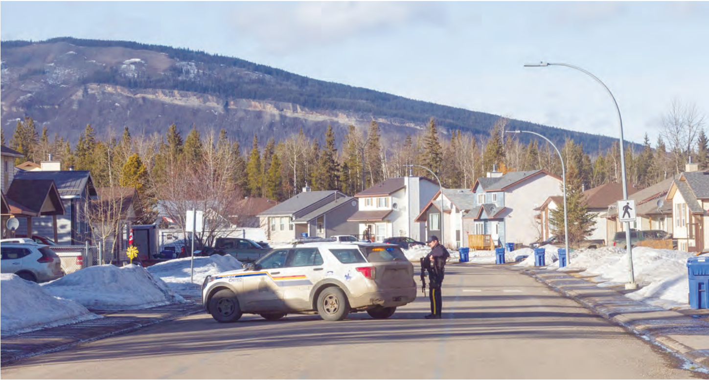
A place near the middle school and high school building where a shooting took place

Emergency responders found six people shot dead