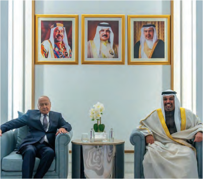
His Excellency Shaikh Salman bin Khalifa Al Khalifa, Minister of Finance and National Economy, highlighted the Kingdom's commitment to continue supporting efforts aimed at strengthening joint Arab action and advancing coordination with the Arab League across various domains, particularly in development and economic sectors, in a way that contributes to achieving shared objectives. H.E. Shaikh Salman was speaking as he received Ahmed Aboul Gheit, Secretary General of the Arab League, on the sidelines of the World Entrepreneurs Investment Forum (WEIF) 2026, currently hosted by the Kingdom.