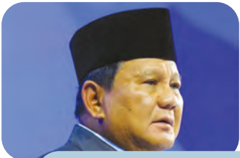
Indonesia president to join first meeting of Trump 'Board of Peace'

Prabowo Subianto will attend the inaugural meeting of US President Donald Trump's "Board of Peace" in Washington this month, Jakarta's foreign ministry said yesterday. The board, of which Trump is the chairman, was originally intended to oversee the rebuilding of the Gaza Strip after two years of war, but its charter appears to extend beyond the Palestinian territory. Indonesia, which is in the process of negotiating a trade deal with Washington, said this week it could send troops to Gaza as part of a US-backed plan to end the Israel-Hamas war. Prabowo attended the "Board of Peace" launch last month at the World Economic Forum in Davos, Switzerland, along with other heads of state and senior officials. Around 19 countries have signed up. The first meeting is scheduled to take place on February 19 in Washington.