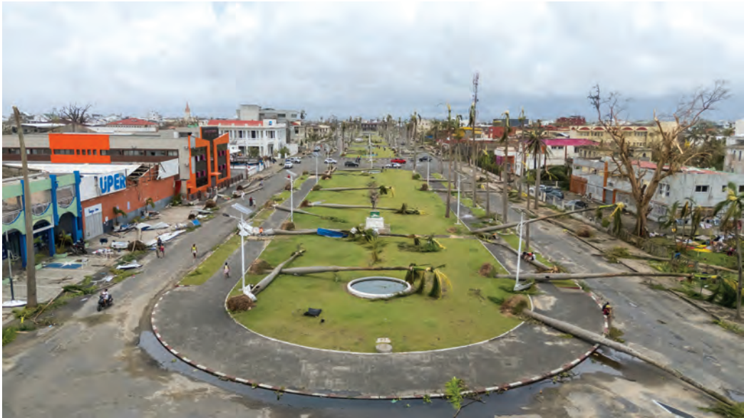
An aerial view of the city of Toamasina, on the east coast of Madagascar, struck by Tropical Cyclone Gezani AFP | Antananarivo, Madagascar

A cyclone packing violent winds killed at least 20 people as it struck Madagascar, toppling houses and causing major flooding, the Indian Ocean island’s disaster authority said yesterday.