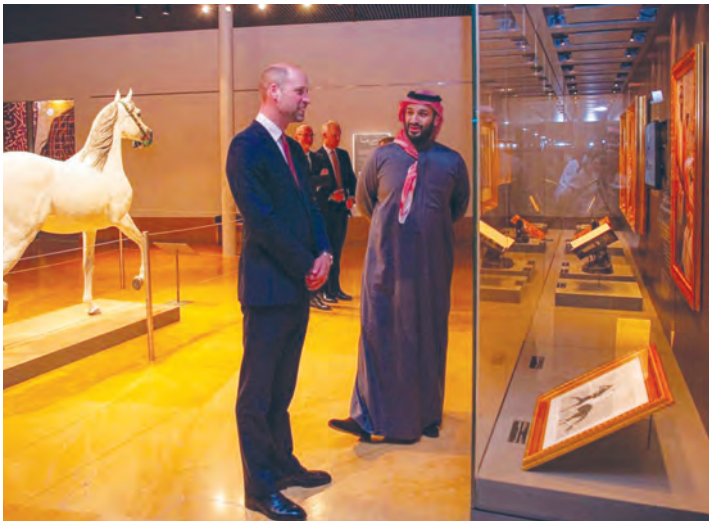
Saudi Arabia Crown Prince Mohammad bin Salman Al Saud meeting with Britain's Prince William, Prince of Wales in the old district of Diriyah on the outskirts of the Saudi capital Riyadh.

Saudi authorities have been pushing in recent years to make