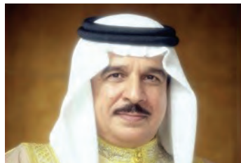
HM the King

He instructed the RHF to take the necessary measures to ensure the prompt disbursement of the grant, in order to support sponsored families in meeting