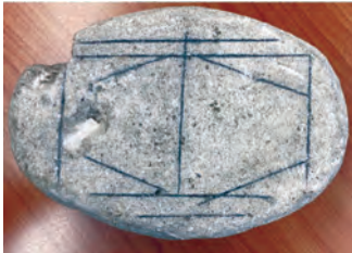
A smooth, white stone dating from the Roman era and unearthed in the Netherlands has long baffled researchers.