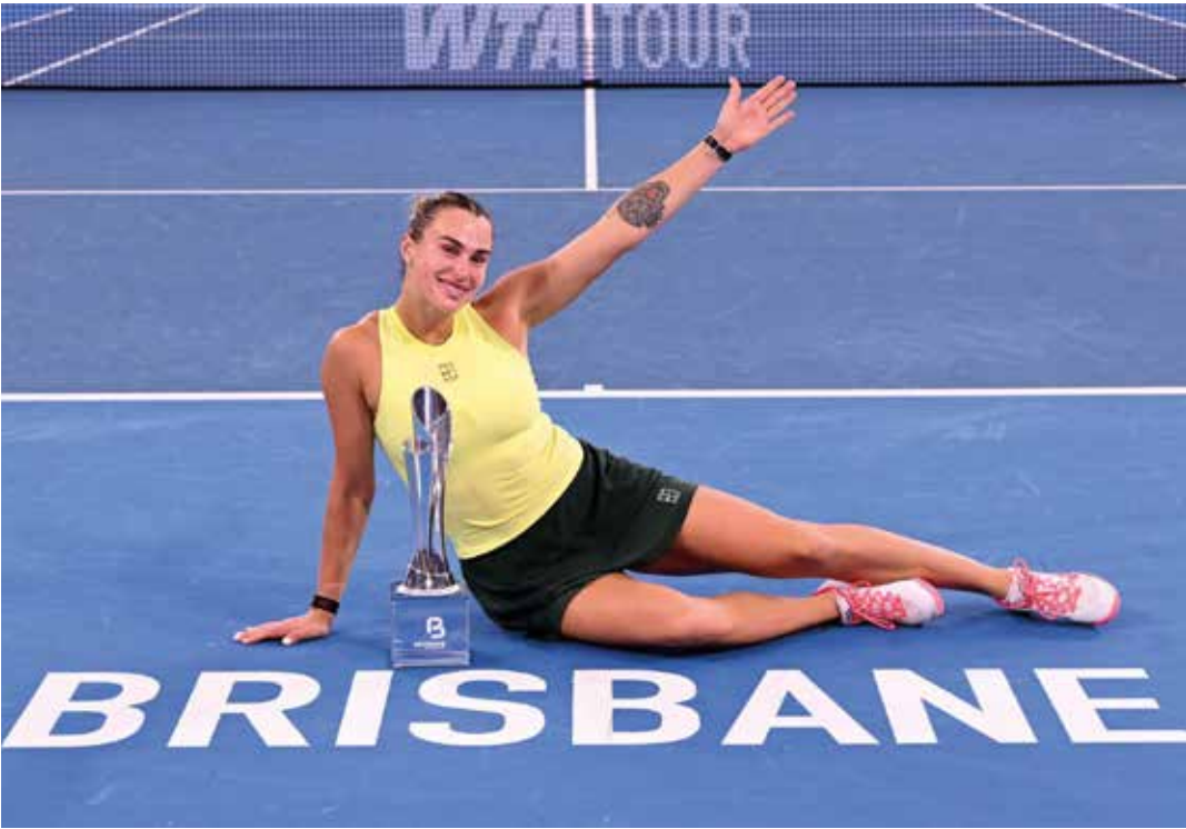
Aryna Sabalenka of Belarus celebrates with the trophy

Kostyuk, the world number 26, had enjoyed a spectacular week, beating three top 10 play-