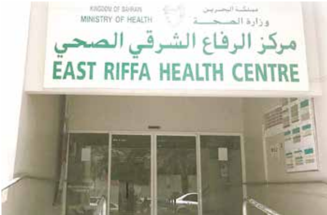
Repurposing the former East Riffa Health Centre as a specialist site for treating cancer patients

● Move to improve standard of care, support stronger health service