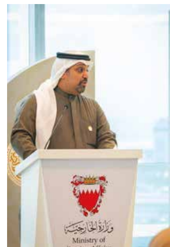
H.E. Shaikh Salman bin Khalifa Al Khalifa speaks at the event

H.E. Shaikh Salman was speaking as he attended the Diplomatic Forum organised by the Ministry of Foreign Affairs on the occasion of Bahrain Diplomatic Day, which falls on January 14 each year. A session was held on Bahrain’s foreign policy and the global economy as part of the occasion.