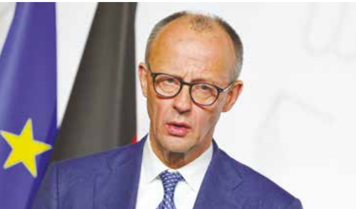
Germany's Chancellor Friedrich Merz

Merz's visit from Monday -- his first to an Asian country since he took office last May -- comes two weeks ahead of a