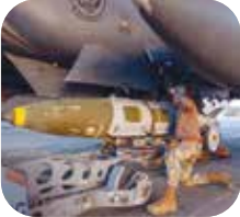
US announces 'large-scale' strikes against IS in Syria

◆ US and allied forces carried out "large-scale" strikes against the Islamic State jihadist group in Syria on Saturday, the US military said, the latest response to an attack last month that killed three Americans. S Central Command (CENTCOM), which oversees American military forces in the region, said multiple strikes "targeted ISIS throughout Syria," using an acronym for the jihadist group. ENTCOM's post on X did not give specifics on where they took place. Grainy aerial video accompanying the post showed several separate explosions, apparently in rural areas. The strikes were part of Operation Hawkeye Strike, which was launched "in direct response to the deadly ISIS attack on US and Syrian forces in Palmyra," CENTCOM said.