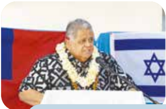
Israel says Samoa to open embassy in Jerusalem

Minister Gideon Saar said yesterday that Samoa will open an embassy in Jerusalem this year, a rare move as most foreign diplomatic missions to Israel are located in Tel Aviv. Samoa will become the eighth country to open its mission in Jerusalem, and the third from the Pacific region after Fiji and Papua New Guinea. "Just spoke with the Prime Minister of Samoa, La'auli Leuatea Schmidt. I thanked him for his moral decision to open an embassy in Jerusalem in 2026," Saar wrote on X. "I also expressed our appreciation for Samoa's consistent support for Israel in the multilateral arena," he said, adding that he had invited the prime minister to visit Israel. The status of Jerusalem is one of the thorniest issues in the Israeli-Palestinian conflict. Israel annexed east Jerusalem after the 1967 Arab-Israeli war, in a move not recognised by the international community.