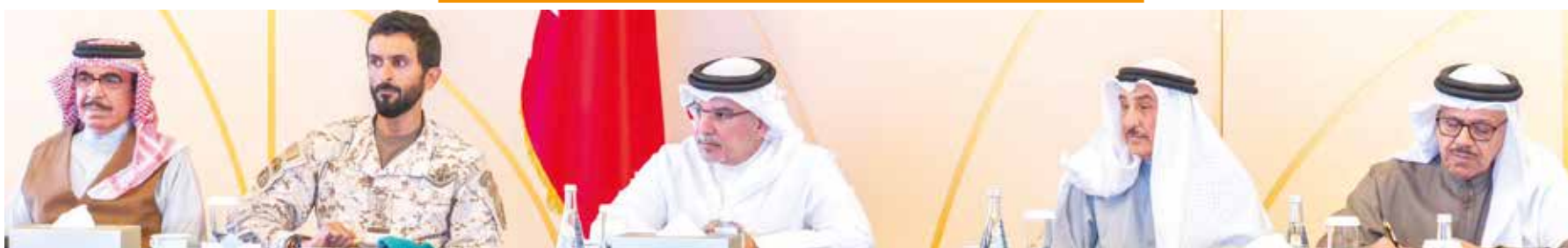
His Royal Highness Prince Salman bin Hamad Al Khalifa, the Crown Prince and Prime Minister, chairs the 33rd meeting of the Higher Committee for Energy and Natural Resources. Several topics related to the development of the energy sector, as well as progress in Bahrain's gas sector, were reviewed.