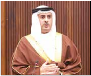
H.E. Nawaf Al Maawda

The Shura Council passed Decree-Law No. 36 of 2025 yesterday, approving changes to Bahrain's anti-money laundering and counter-terrorist financing rules ahead of a Financial Action Task Force (FATF) assessment due in March 2026. Members discussed the report of the Shura Council's Foreign Affairs, Defence and National Security Committee on the decree-law, which amends parts of Decree-Law No. 4 of 2001 on the prohibition of and combating money laundering and terrorist financing. Dr Bassam Al Binmohammed, the committee's rapporteur, said the amendments were driven by evolving methods used in money laundering, terrorist financing and the financing of the proliferation of weapons, adding that they "embody core international obligations that the Kingdom will be assessed against in the next periodic review".