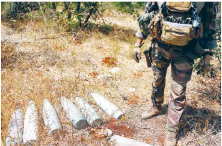
A French peacekeeper of the United Nations Interim Force in Lebanon (UNIFIL) stands by munitions formerly used by Iran-backed Hezbollah at a position that was held by the group in the Khraibeh Valley in el-Meri in south Lebanon

"We urge residents of the area... you are located near a