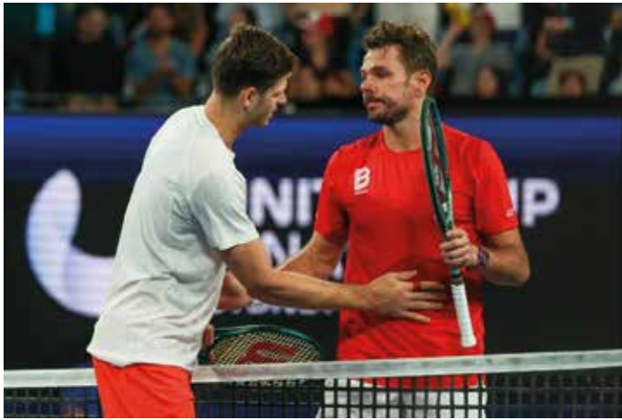
Hubert Hurkacz (left) is congratulated by Stan Wawrinka

Playing his first tournament in seven months following knee surgery, the 28-year-old Hurkacz withstood a Stan Wawrinka fightback to prevail 6-3, 3-6, 6-3 and send it to a deciding doubles.