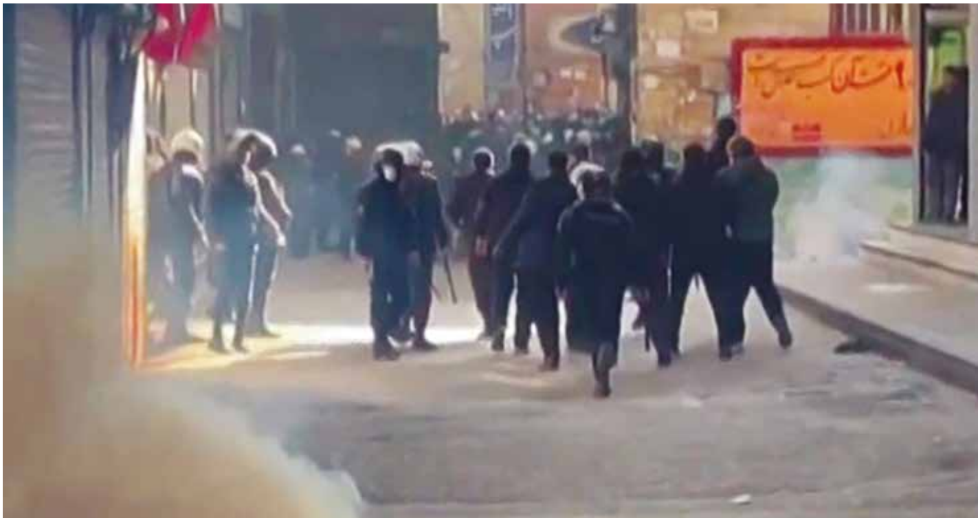
This grab taken from UGC images posted on social media the same day shows Iranian security forces using tear gas to disperse protesters at the Tehran bazaar.

Many protesters had been shot in the eyes in a deliberate tactic