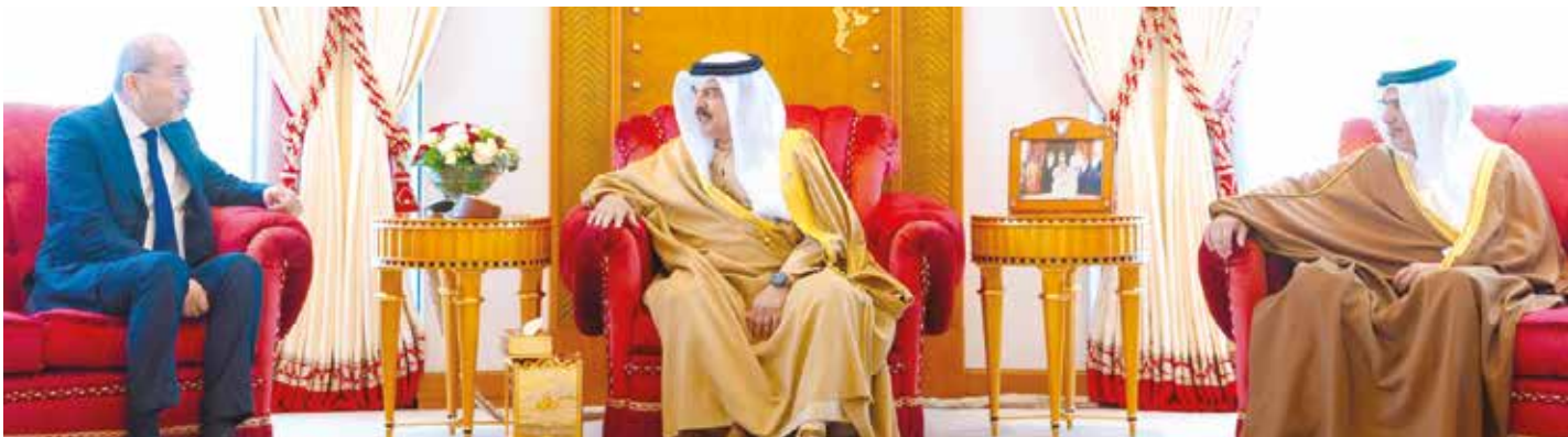
HM the King receives Jordanian Deputy Prime Minister, H.E. Ayman Safadi, in the presence of HRH Prince Salman

During the meeting, HE the Deputy Prime Minister con-