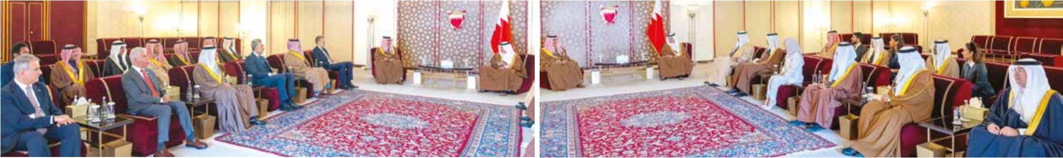
HRH Prince Salman with the private sector sponsors of the Celebrate Bahrain events