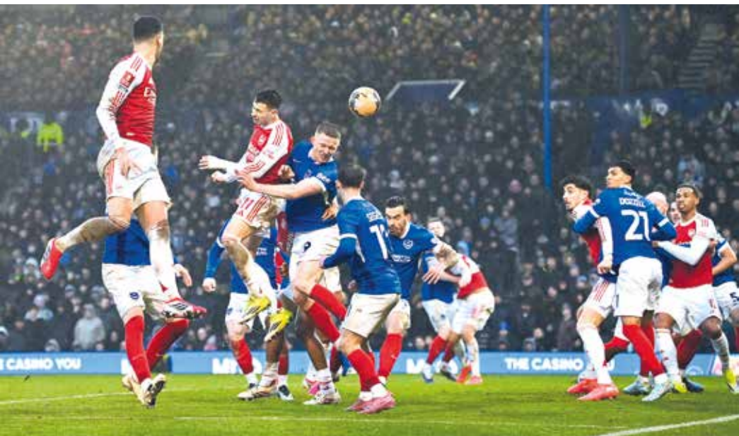
Arsenal’s Brazilian midfielder #11 Gabriel Martinelli headers the ball to score a goal