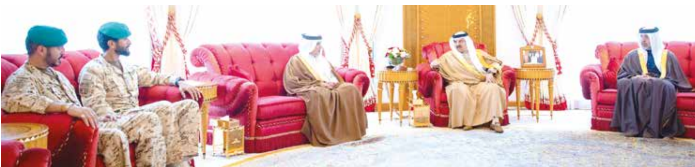
HM the King receives HRH the Crown Prince and Prime Minister

He also emphasised that the designation serves to highlight ongoing development projects in historic Muharraq and cities