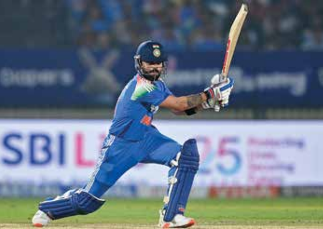
India's Virat Kohli watches the ball after playing a shot