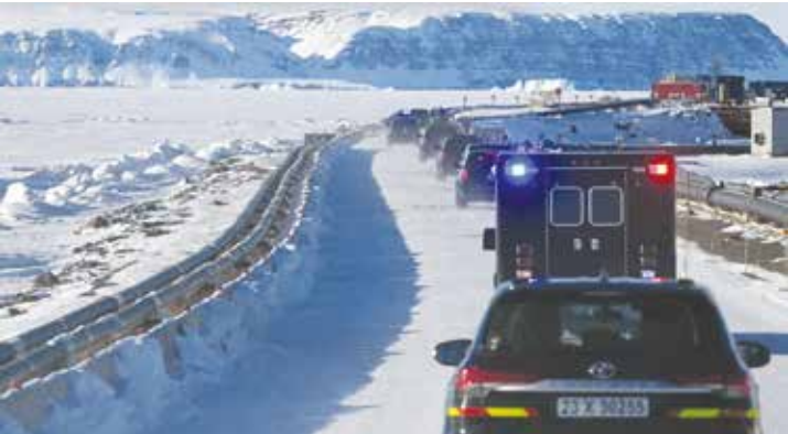
The motorcade of US Vice President JD Vance travels through the US military's Pituffik Space Base in Greenland (file)

Germany and Sweden on Sunday pushed back as US President Donald Trump again suggested using force to seize the self-governing Danish territory of Greenland. The US general who is NATO's supreme commander in Europe said meanwhile that the military alliance was having "healthy" talks on Greenland's importance. Swedish Prime Minister Ulf Kristersson condemned US