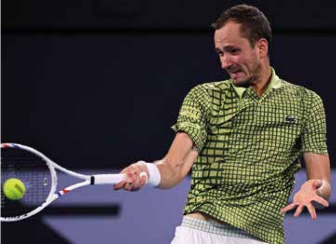
Daniil Medvedev of Russia hits a return during the men's singles final

Nakashima rallied in the second to force a tiebreak but the towering Russian raced to a 5-0 lead in the breaker and the match was as good as over.