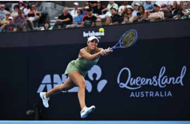
Madison Keys in action in Brisbane (file photo)