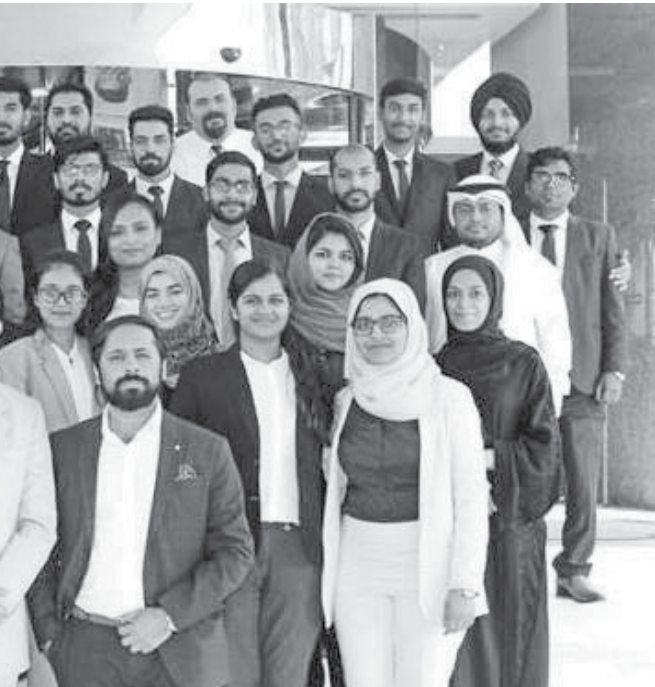
f, amongst other matters, on International Financial Reporting Standards s focused on key changes in IFRS standards and financial statements