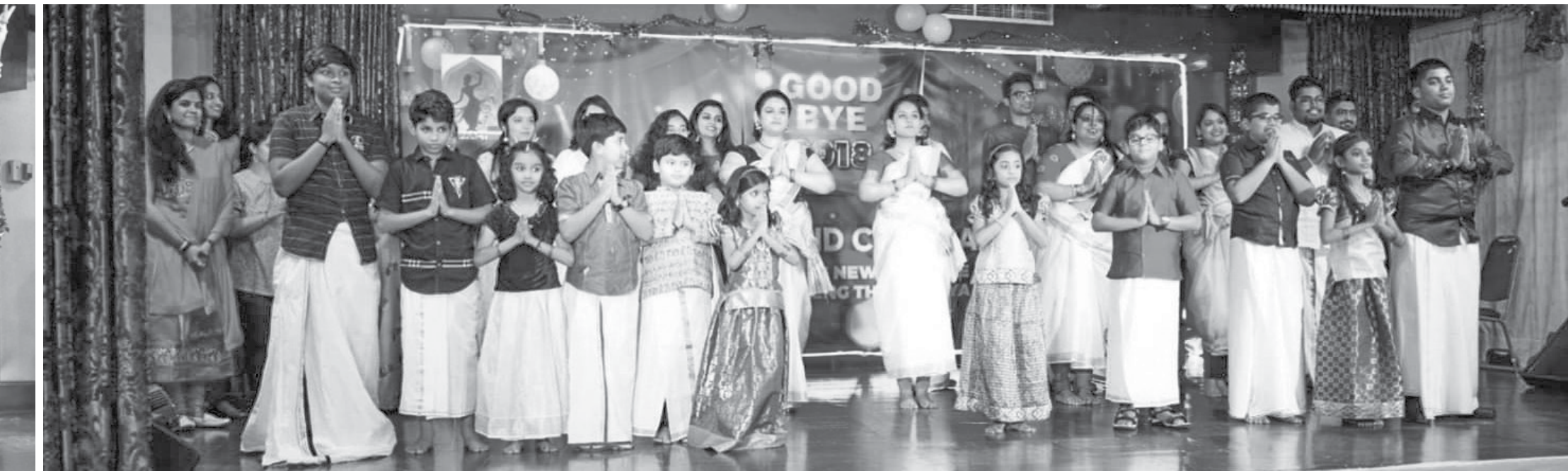
Hotel, Adliya. The entertaining programs along with DJ were conceived, directed and executed by PAACT 's members. Programs were fused completely with technologically supported visuals.