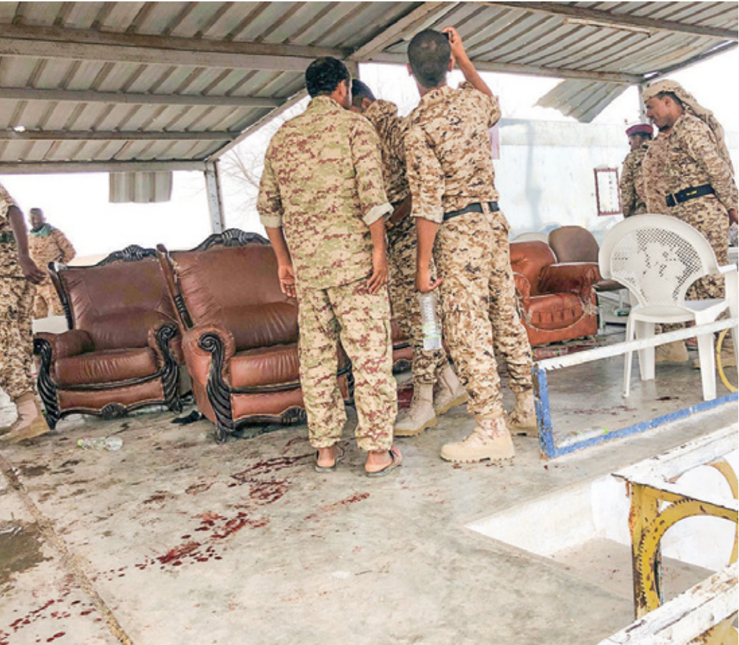
Soldiers carry out probe at the site of attack.

tack at Al Anad Air Base, which jeopardises a ceasefire for the port of Hodeidah agreed at talks in Sweden last month. “This attack contravenes the spirit of the Hodeidah ceasefire and the progress made last month at the UN-led talks in Sweden,” the State Department said. “We urge all sides to honour the commitments they made in Sweden to their fellow Yemenis by refraining from violence and provocative acts.” The escalation came after the UN envoy to Yemen, Martin Griffiths this week warned “substantial progress” was needed on the ground before full-blown negotiations could be launched