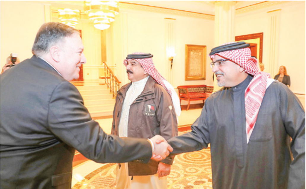
His Majesty King Hamad bin Isa Al Khalifa yesterday received, in the presence of His Royal Highness Prince Salman bin Hamad Al Khalifa, Crown Prince, Deputy Supreme Commander and First Deputy Premier, US Secretary of State Mike Pompeo who is on a visit to the Kingdom of Bahrain. His Majesty welcomed his visit to the Kingdom of Bahrain and stressed the importance of exchanging such visits to develop co-operation at all levels, especially in the political, economic and defence areas.