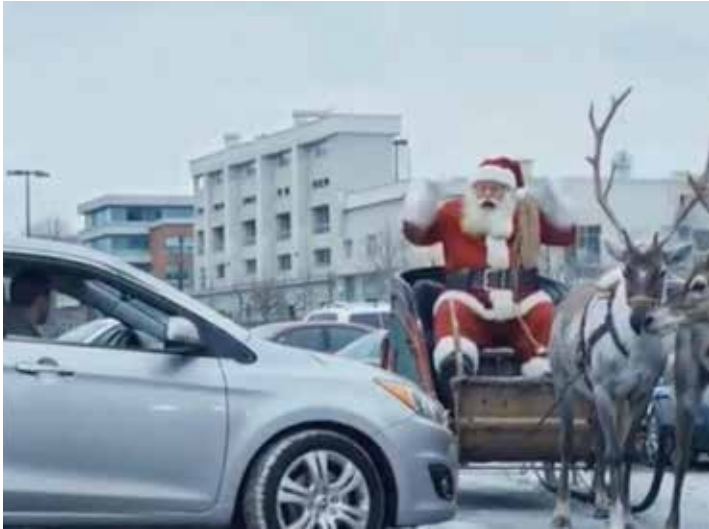
The message: retreat to a McDonald's restaurant until January and ride out the festive season.

The message: retreat to a McDonald's restaurant until January and ride out the festive season. But the generative AI ad sparked a (Mc)flurry of criticism on social media.