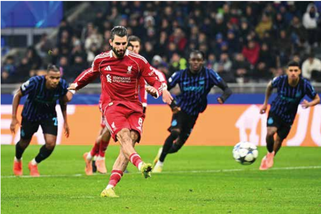
Liverpool's Hungarian midfielder #08 Dominik Szoboszlai kicks and scores a penalty

Chelsea lost 2-1 at Atalanta despite taking a first-half lead