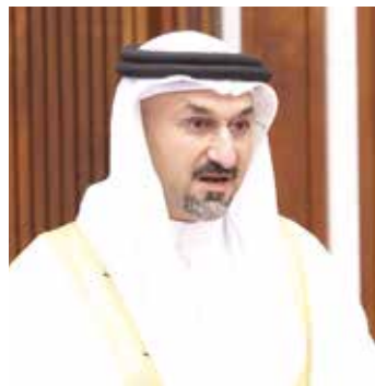
H.E. Abdulla Fakhro

tronic cards and a direct link to Bahrain Flour Mills Company, allowing each allocation to be tracked. The ministry said it also carries out field visits to new bakeries before approving flour quotas, to ensure each share is