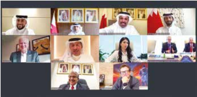
HH Shaikh Nasser chairs the Bapco Energies’ fourth quarter board meeting

all Bahrain governorates under the WHO Healthy Cities programme, wishing all involved continued success in serving