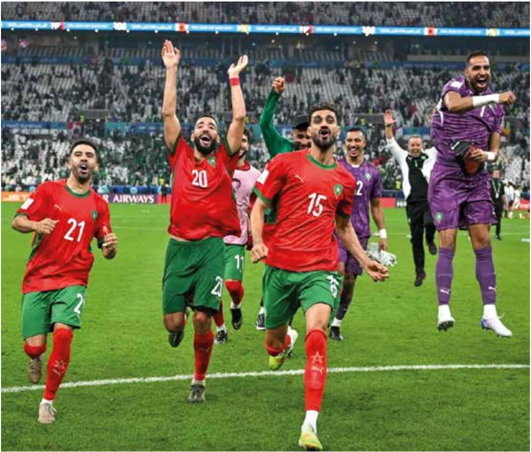
Morocco players celebrate securing their place in the last eight

shifts to Lusail Stadium, host of the 2022 World Cup final, where Palestine meet Saudi Arabia at 8:30 PM. Palestine topped Group A with five points, highlighted by a 1-0 win over hosts Qatar and spirited draws against Tunisia and Syria. Their resilience and togetherness have been defining features of their