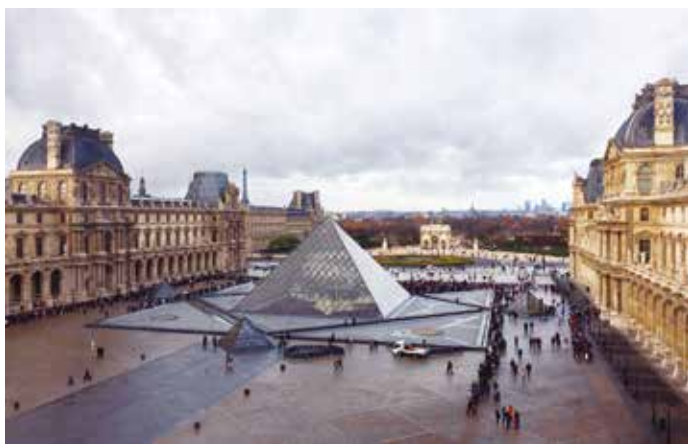
Visitors, seen from the Sully wing, queuing in the Cour Napoleon by the pyramid designed by Chinese-US architect Ieoh Ming Pei, to enter the Louvre Museum in Paris

Agents in the security headquarters also did not have enough screens to follow the images in real-time, while a lack of coordination meant police were initially sent to the wrong place once the alarm