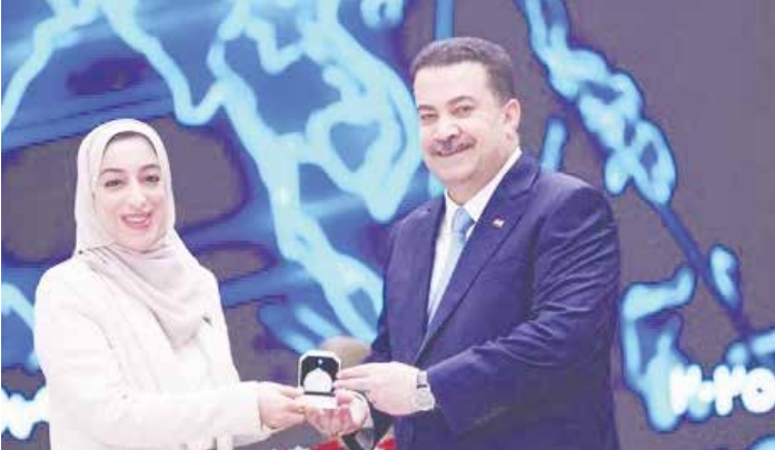
H.E. Fatima bint Jaafar Al Sairafi at the event

The sessions were organised by the Arab League's Econom-