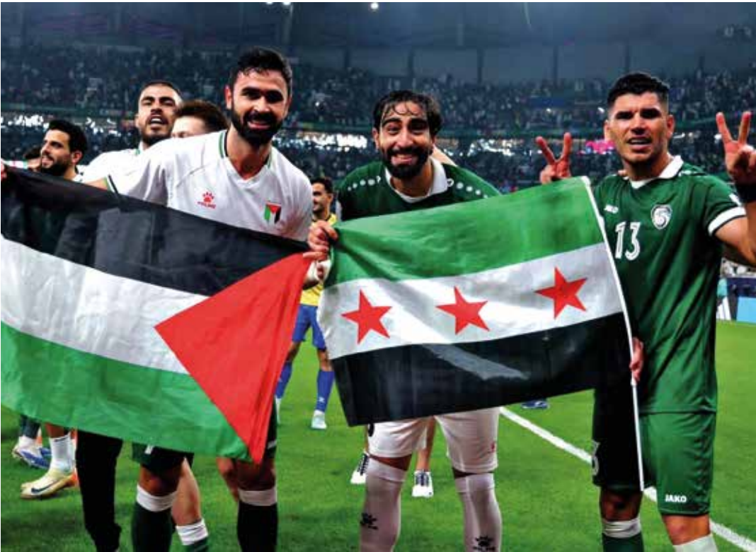
Syria and Palestine celebrate their shared qualification