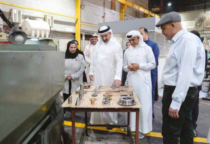
H.E. Abdulla bin Adel Fakhro inspects the facilities rain’s industrial infrastructure and national talent in achieving

His Excellency Abdulla bin Adel Fakhro, Minister of Industry and Commerce, conducted a field visit to Bridge Industrial Services Company’s factory in the Salman Industrial Port area, as part of ongoing efforts to follow up on national industrial facilities and developments in the sector. The Minister emphasised the Ministry’s commitment to supporting national companies and strengthening their role in the economy, highlighting the Bridge’s long-standing contributions and the strength of Bah-