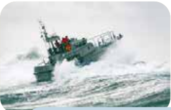
Cyprus launches search for missing yacht that set sail from Israel

◆ Cyprus has launched a national search-and-rescue operation after a yacht that departed Israel over a week ago went missing in stormy waters off the Mediterranean island, authorities said yesterday. The Joint Rescue Coordination Centre (JRCC) said it triggered the search on Tuesday to locate the vessel, which set sail on December 2 bound for the Greek island of Crete. The yacht's last known position was recorded on December 8 inside the Cyprus Search and Rescue Region (SRR), about 89 nautical miles (165 kilometres) from the southwestern coastal town of Paphos, the JRCC said in a statement. "Vessels in the area have been tasked to assist in locating the missing sailboat," it said, adding that government air assets would join the operation Wednesday.