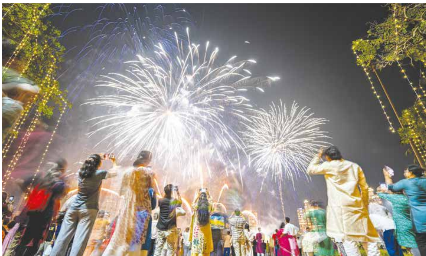
Local residents watch fireworks light up the sky as part of Diwali celebrations, the Hindu festival of lights, in Mumbai known as Deepavali, not just in India but globally.

As one of Hinduism's most significant festivals, millions of Indians celebrate Diwali, also