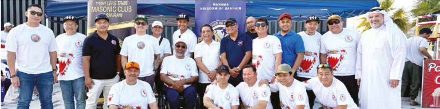
Communities come together for global day of persons with disabilities

Filipino and American groups joined the Government of Bahrain and the Bahrain Mobility International Center in marking this year’s International Day of Persons with Disabilities (IDPD), celebrated annually on December 3. The event took place on December 6, 2025, at Sama Bay, and coincided with International Volunteer Day on December 5, marked a significant milestone with the inaugural participation of representatives from the