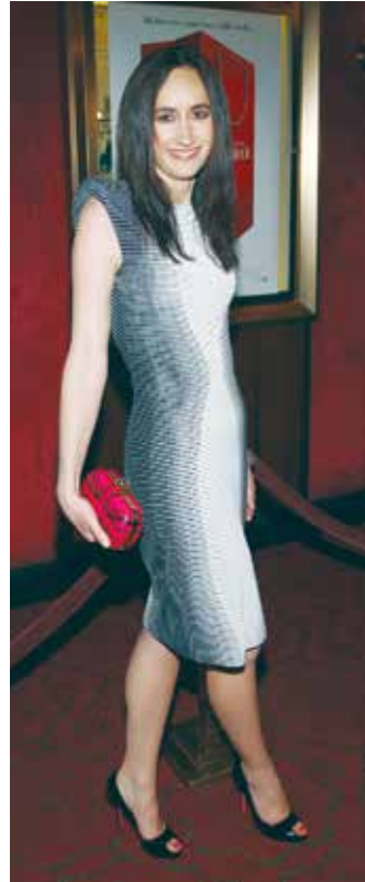
Writer Sophie Kinsella

The first two books from her "Shopaholic" series were adapted for the 2009 romantic comedy film "Confessions