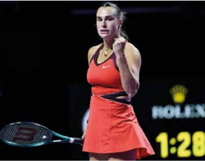
Aryna Sabalenka reacts during a match (file photo)