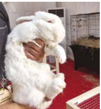
The New Zealand White rabbit