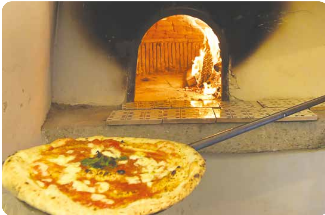
An Italian “Pizzaiolo” (pizza maker) prepares a Pizza Margherita in the first stone oven where was cooked a Pizza Margherita at the Capodimonte museum in Naples.

The world's first pizzeria, called Antica Pizzeria Port'Alba, opened in Naples in 1830, and it's still operating today – serving pizzas from an oven lined with volcanic rocks from Mount Vesuvius.