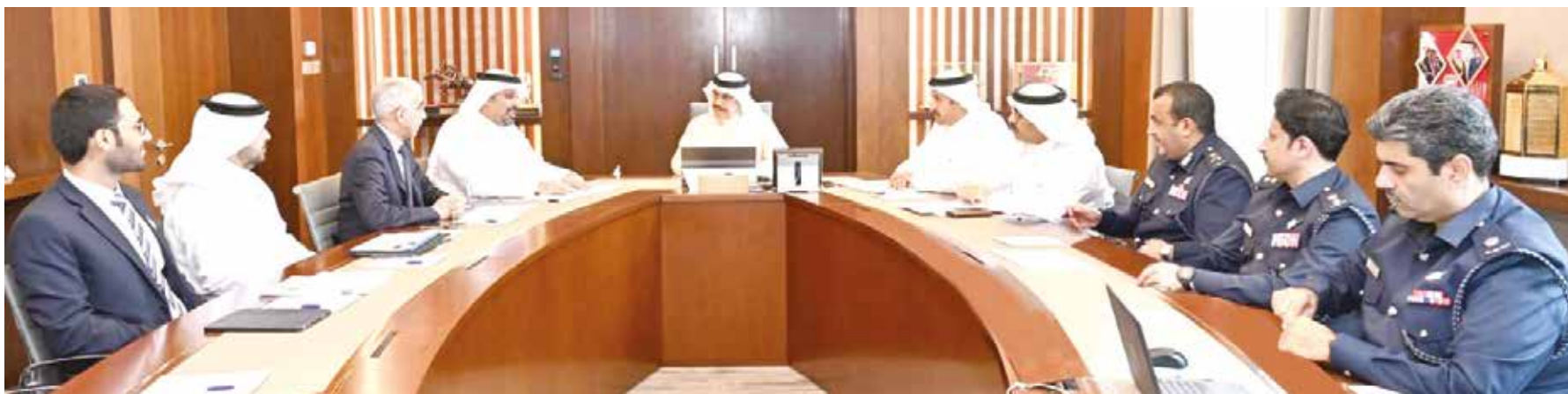
H.E. General Shaikh Rashid bin Abdullah Al Khalifa chairs the Traffic Council's meeting

H.E. Gen. Shaikh Rashid: Protecting lives on the road, ensuring smooth traffic flow top priority