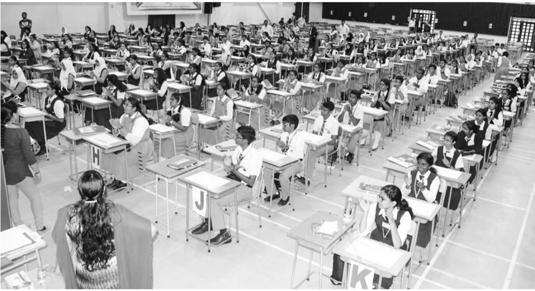
Hundreds of students took part in the event last year.

The event is set to begin by 7.30 am and complete by 4.30 pm. The results will be announced the same day in a finale function starting at 5.00 pm just after the drawing competition at Bahrain International Exhibition Centre. Participants are divided into