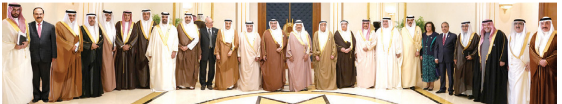
HRH the Premier and HRH the Crown Prince with other members of the Cabinet during a photocall before the beginning of the first session.

Welfare schemes stressed as newly-formed Cabinet holds first meeting