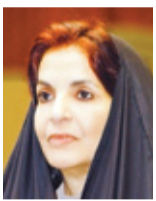
HRH Princess Sabeeka

Her Royal Highness Princess Sabeeka bint Ibrahim Al Khalifa, Wife of His Majesty the King and President of the Supreme Council for Women (SCW) lauded the success of the parliamentary and municipal elections, praising the outstanding participation of Bahraini women as voters and candidates.