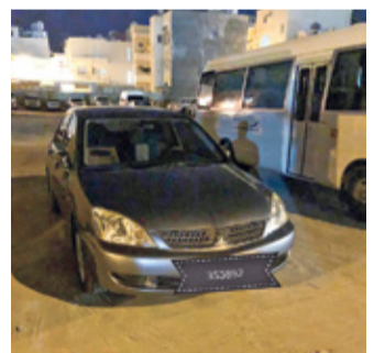
The parked car in which Kumar's body was found in Hidd.

The car was found in a parking lot in Hidd Industrial Area.