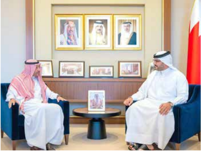
HH Shaikh Isa bin Salman bin Hamad Al Khalifa receives H.E. Saudi Ambassador Naif bin Bandar Al-Sudairi