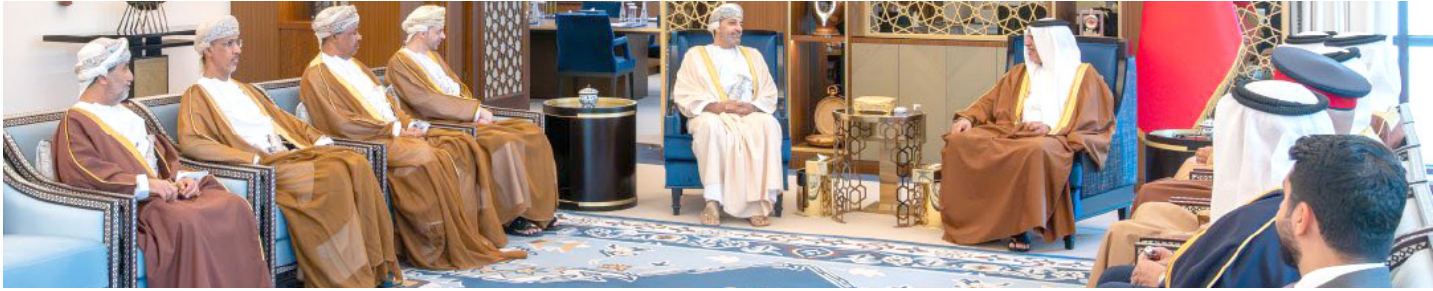
HRH the Crown Prince and Prime Minister meets with H.E. Sayyid Hamoud bin Faisal Al Busaidi

statements as he met yesterday with His Excellency Sayyid Hamoud bin Faisal Al Busaidi, Minister of Interior of Oman, at Gudaibiya Palace.