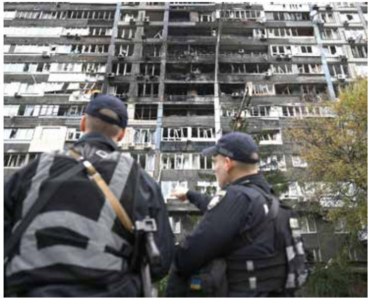
Ukrainian policemen stand in front of a damaged residential building

AFP journalists in the capital heard several loud explosions overnight and experienced