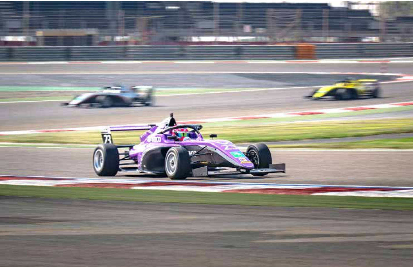
Action from the Pre-Season Testing

The championship, part of the FIA-sanctioned single-seater entry-level series, is promoted by ALTAWKILAT Motorsport under the supervision of the Saudi Automobile and Motorcycle Feder-