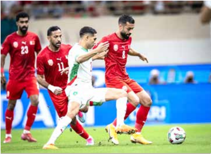
Hakimi challenges Bahrain's Ali Madan

The Bahraini side were solid defensively for most of the 90 minutes, with goalkeeper Ebrahim Lutfhallah making several important saves to keep the match level. The African giants, semifinalists at the 2022 World Cup in Qatar and already qualified for the 2026 edition, dominated possession and tested Bahrain with a series of