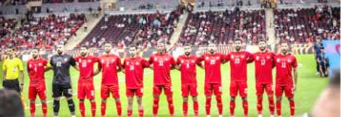
Bahrain's starting XI line up at a packed Prince Moulay Abdellah Stadium

The friendly offered both sides a chance to test their squads ahead of December's FIFA Arab Cup 2025 in Doha, Qatar. Bahrain will return to the same stadium on Monday to face Egypt, who have recently secured qualification for the 2026 World Cup.