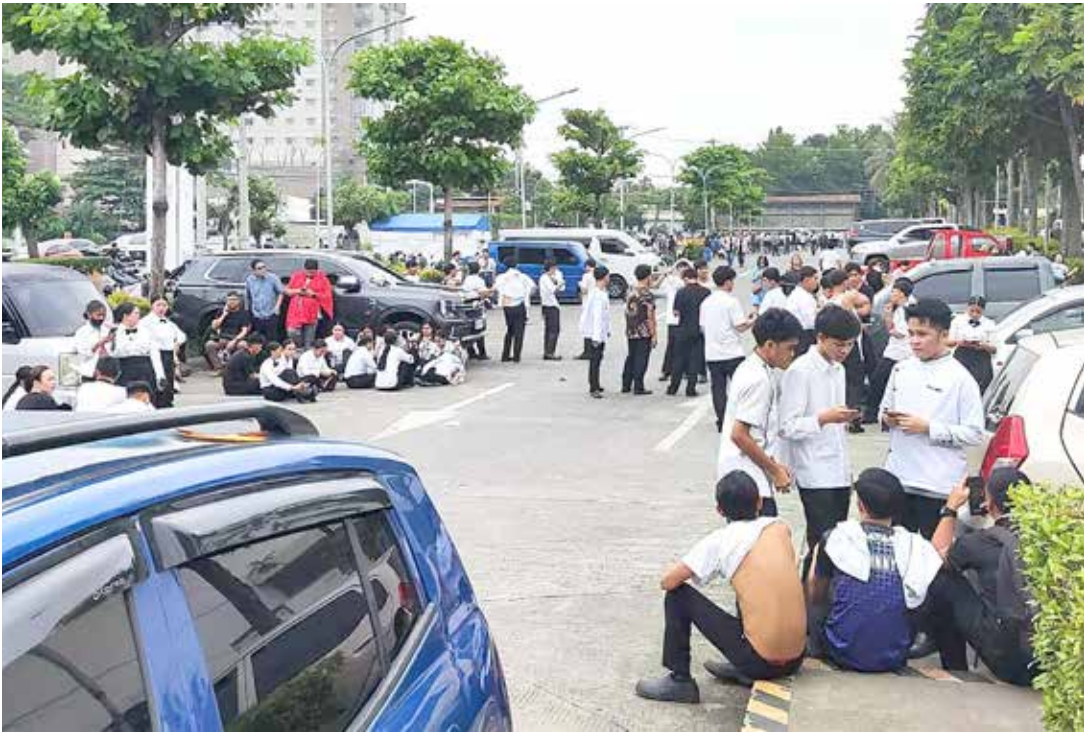
Employees at a shopping mall gather outside the building in Davao City

city when a wall collapsed, while two others suffered fatal heart attacks, city disaster official Charlemagne Bagasol told AFP.