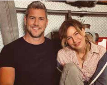
Renee Zellweger and with Ant Anstead

Renee Zellweger bonded with Ant Anstead over their shared love of cars. The couple met four years ago when the Hollywood actress was a guest on Ant's TV show Celebrity IOU Joyride and he's admitted seeing Renee, 56, welding helped win him over because he discovered she's a "hands-on car girl". Ant, 46, told Hello! magazine: "One of the many, many things that attracts me to Ren is that she's a hands-on car girl. It's really cool that we met on a car show. "She welded - I