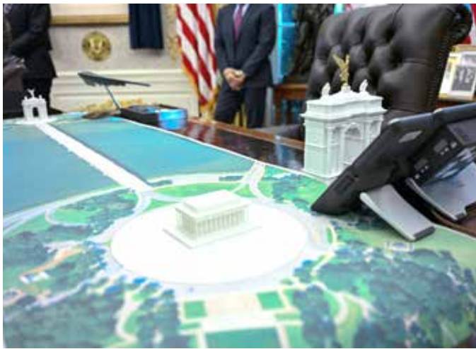
A plan for an arch across from the Lincoln Memorial is seen on Resolute Desk

◆ A federal judge on Thursday ordered a temporary halt to President Donald Trump's deployment of hundreds of National Guard troops in the Chicago area as part of his sweeping crime and immigration crackdown. Trump's administration has argued the troops are necessary to protect immigration agents and facilities in America's third largest city, falsely depicting it as a "war zone." But local Democratic officials have said police and other law enforcement are perfectly sufficient, while arguing that Trump is purposefully provoking protests with its heavy handed operations.