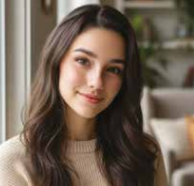
AI-generated actress Tilly Norwood

Shown a report on Tilly, Emily told Variety : "Does it disappoint me? I don't know how to quite answer it, other than to say how terrifying this is. "No, are you serious? That's an AI? Good Lord, we're screwed. That is really, really scary, Come on, agencies, don't do that. Please stop. Please stop taking away our human connection." The 42-year-old actress noted Tilly was designed to resemble a composite of familiar stars and was