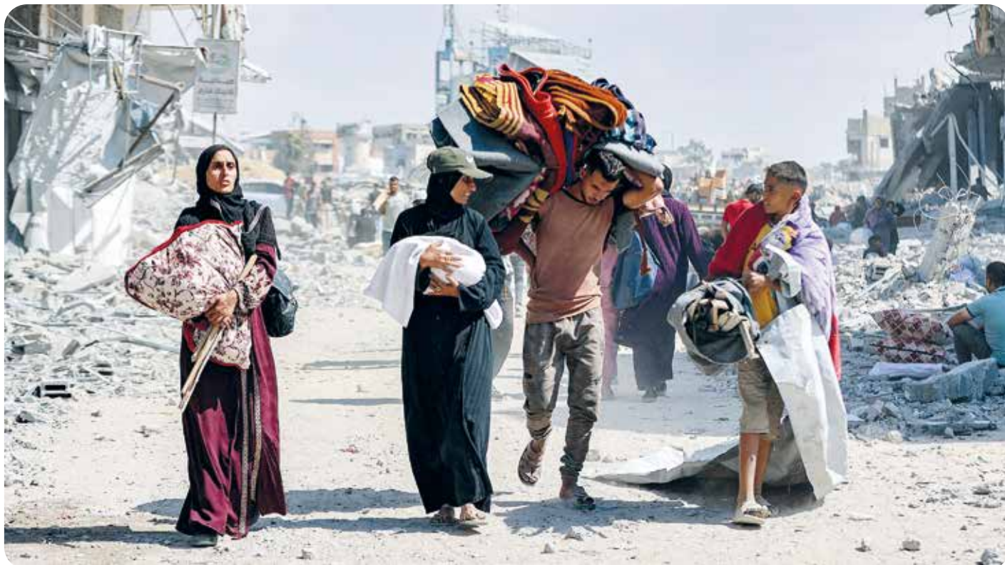
Thousands of displaced Palestinians began to trek home as Israeli forces declared a ceasefire and withdrew from some positions in Gaza