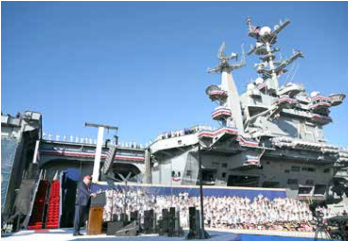
US President Donald Trump delivers remarks during a visit to the USS Harry S. Truman during the US Navy's 250th anniversary celebration

sticking to his guns, telling reporters Thursday that he was "committed to keeping the House out of session as long as it takes to pressure Senate Democrats."