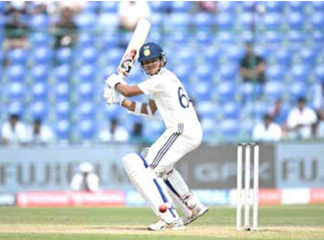
India's Yashasvi Jaiswal plays a shot