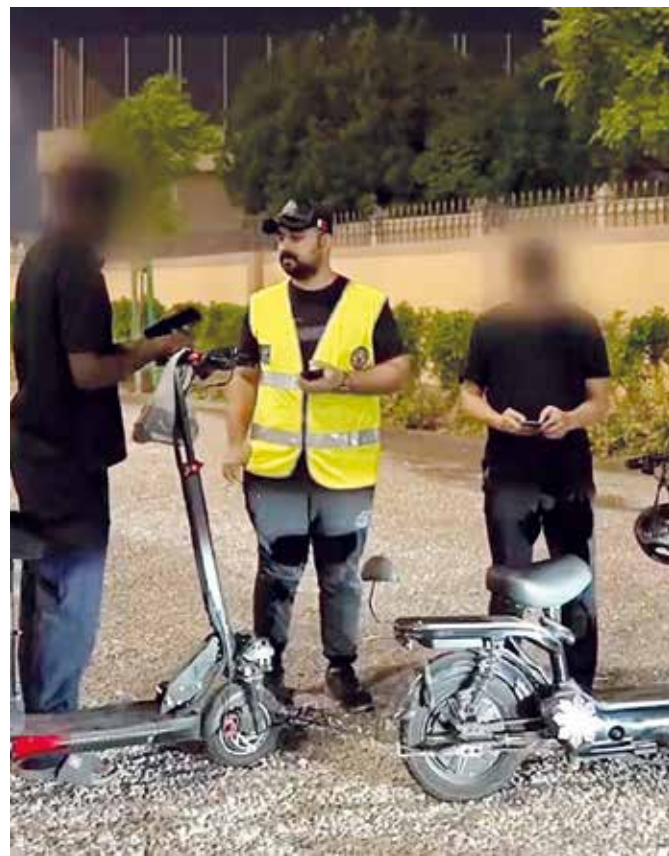
TDT | Manama

Authorities step up campaigns to curb electric scooter violations on main streets