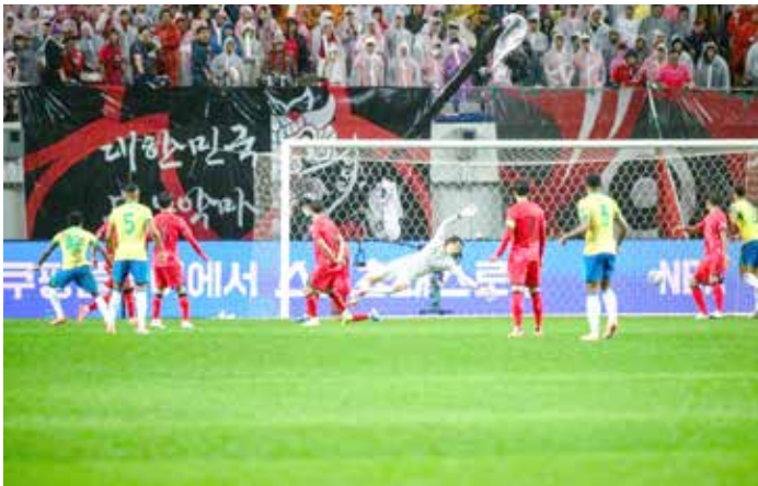
Brazil's Rodrygo scores against South Korea in Seoul

range after 13 minutes following an incisive through ball from Newcastle United midfielder Bruno Guimaraes.