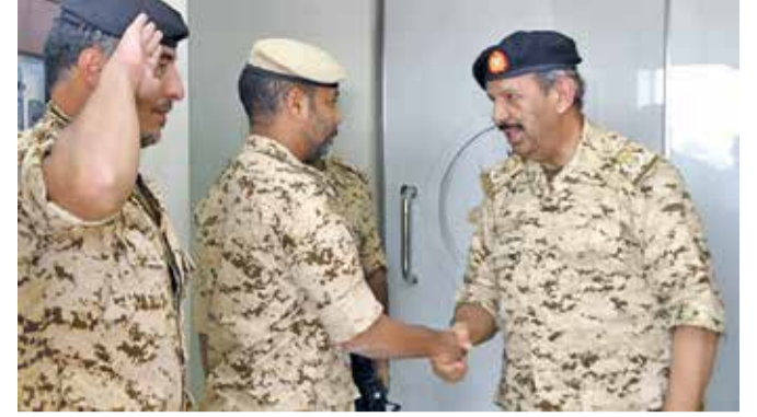
BDF Commander-in-Chief Field Marshal Shaikh Khalifa bin Ahmed Al Khalifa during an inspection visit to one of the BDF units. The commander-in-chief reviewed the units' administrative and combat readiness, as well as their military preparations and work progress. He was briefed about the military preparations, the work progress, and development in these units.