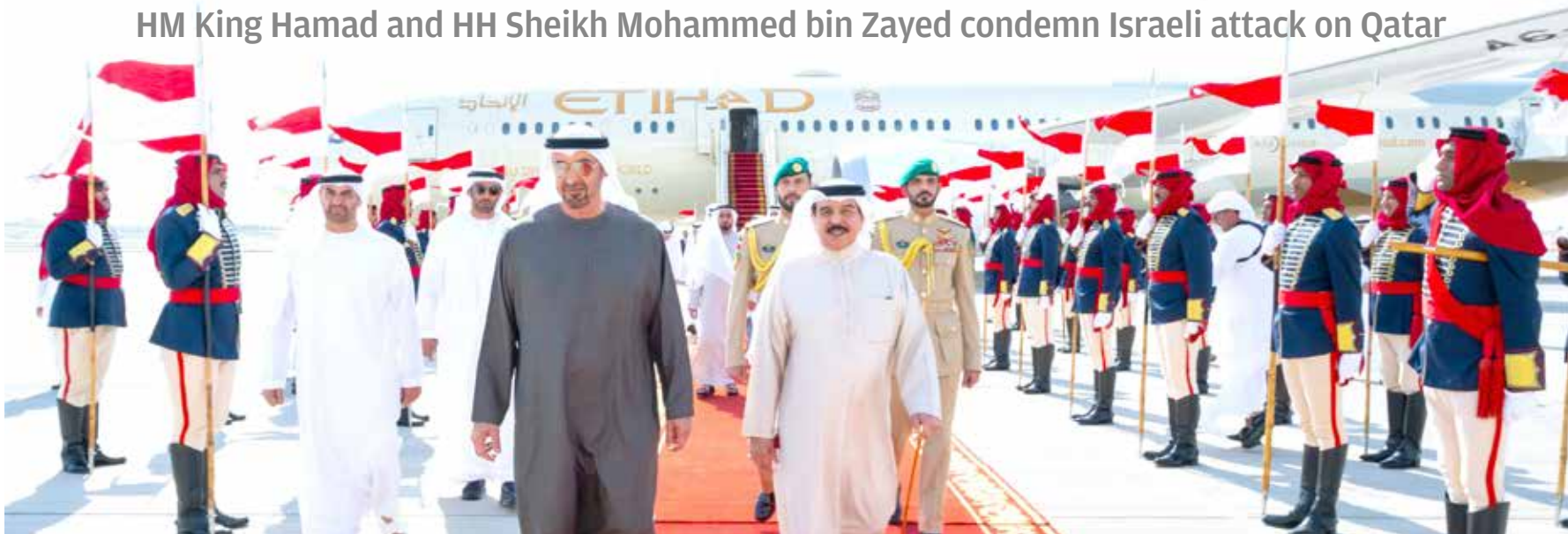
A warm welcome for the UAE leader