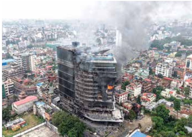
Smoke billows from the burning Hilton Hotels, a day after it was set ablaze by protesters in Kathmandu

Sri Lanka votes to eject former leader Rajapaksa from state mansion ♦ Sri Lanka’s parliament voted yesterday to evict former president Mahinda Rajapaksa and two others from state-owned mansions under austerity measures introduced by the new leftist government. President Anura Kumara Dissanayake’s party voted en masse to endorse a bill that will repeal a 1986 law that granted former heads of state their privileges did not violate the Constitution. Only one opposition MP voted against the bill, which was passed with a two-thirds majority of 150 in the 225-member assembly. The bill was cleared a day after the Supreme Court ruled that stripping former heads of state of their privileges did not violate the Constitution.