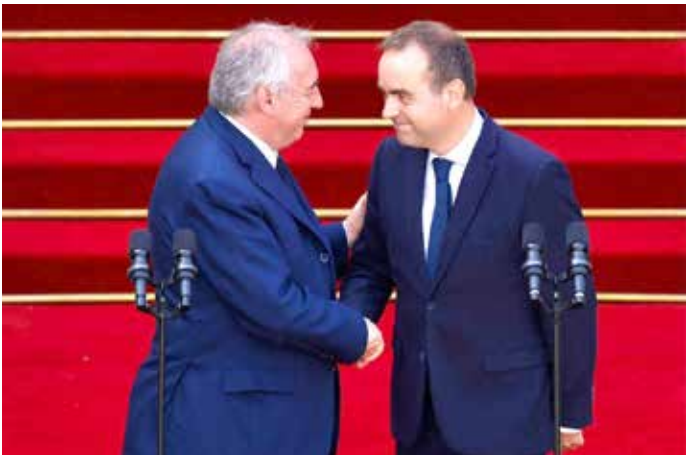
France's newly-appointed Prime Minister and former Minister of Armed Forces Sebastian Lecornu (R) shakes hands with France's outgoing Prime Minister Francois Bayrou (L)

France's new Prime Minister Sebastian Lecornu promised a "profound break" with the past yesterday as he faced the thorny task of trying to build a government with enough parliamentary support to avoid an early demise. Lecornu's first day on the job coincided with street protests across France in a show of grassroots opposition to President Emmanuel Macron, which resulted in clashes with police and dozens of arrests, as well as some disruption to transport, schools and other services. But the protests, called by a collective without a clear leader, had an uneven impact across the country. The president appointed Lecornu -- a close Macron ally and defence minister for the past three years -- late on Tuesday, only 24 hours after his pre-