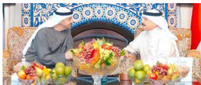
HM the King holds talks with HH Sheikh Mohammed bin Zayed

between Bahrain and the UAE, particularly in light of evolving regional developments.