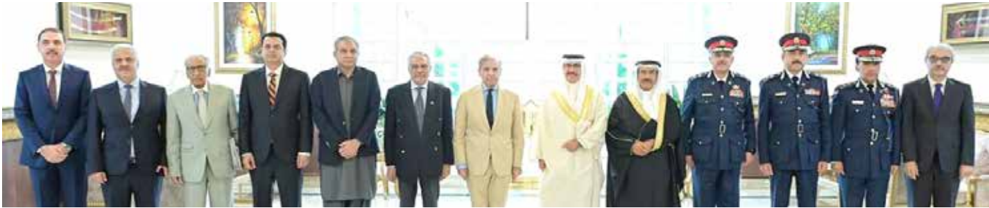
H.E. Interior Minister General Shaikh Rashid bin Abdullah Al Khalifa with Pakistan President Asif Ali Zardari, Prime Minister Shehbaz Sharif and senior officials

They discussed several issues of common interest, in addition