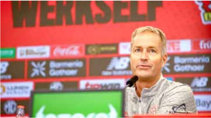
Bayer Leverkusen coach Kasper Hjulmand

New Bayer Leverkusen coach Kasper Hjulmand yesterday said that he did not take the job to "prove anything" after an underwhelming experience when he last coached in German football. Hjulmand returns to Germany after a less than successful spell in charge of Bundesliga club Mainz in 2014-15, where he was let go after a run of one win in 13 games. And his last match as a coach was in charge of Denmark at Euro 2024, when his side lost 2-0 to hosts Germany in the last 16. At his official unveiling, the 53-year-old Dane told reporters: "I don't go into this job, or any job, to prove anything. "I do it because I love the game and the passion behind it. I love the Bundesliga." The former Denmark coach was named Leverkusen manager on Monday, replacing the