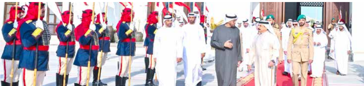
HM King Hamad bids farewell to HH UAE President

Apart from regional developments, the leaders discussed long-standing bilateral relations and explored ways to enhance cooperation, coordination, and joint initiatives to serve their shared interests.