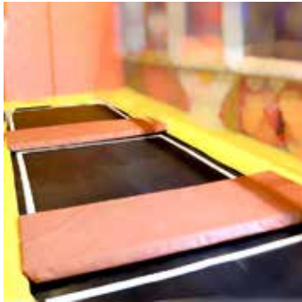
Father claims unsafe design caused the accident

how they get approved to run this business,” he said, questioning how such facilities are allowed to operate.