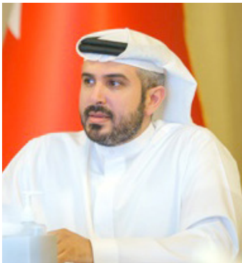
HH Shaikh Mohammed bin Salman

His Highness affirmed Bahrain's commitment to sustainable development to ensure progress incorporates environmental conservation and con-