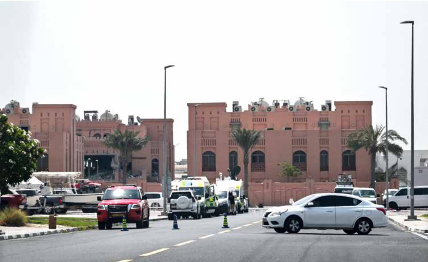
A picture taken from a distance shows the damaged building (L) in the compound housing members of Palestinian militant group Hamas’s political bureau which was targeted the previous day by an Israeli strike in Qatar’s capital Doha

Israel vows to hunt Hamas leaders worldwide after Qatar strike draws US rebuke