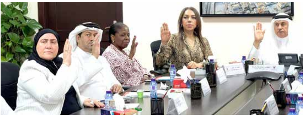
The Capital Trustees Board meeting in progress

Members approved the minutes of the last sitting, noted the ministry's replies to proposals lodged during the recess and endorsed the standing general