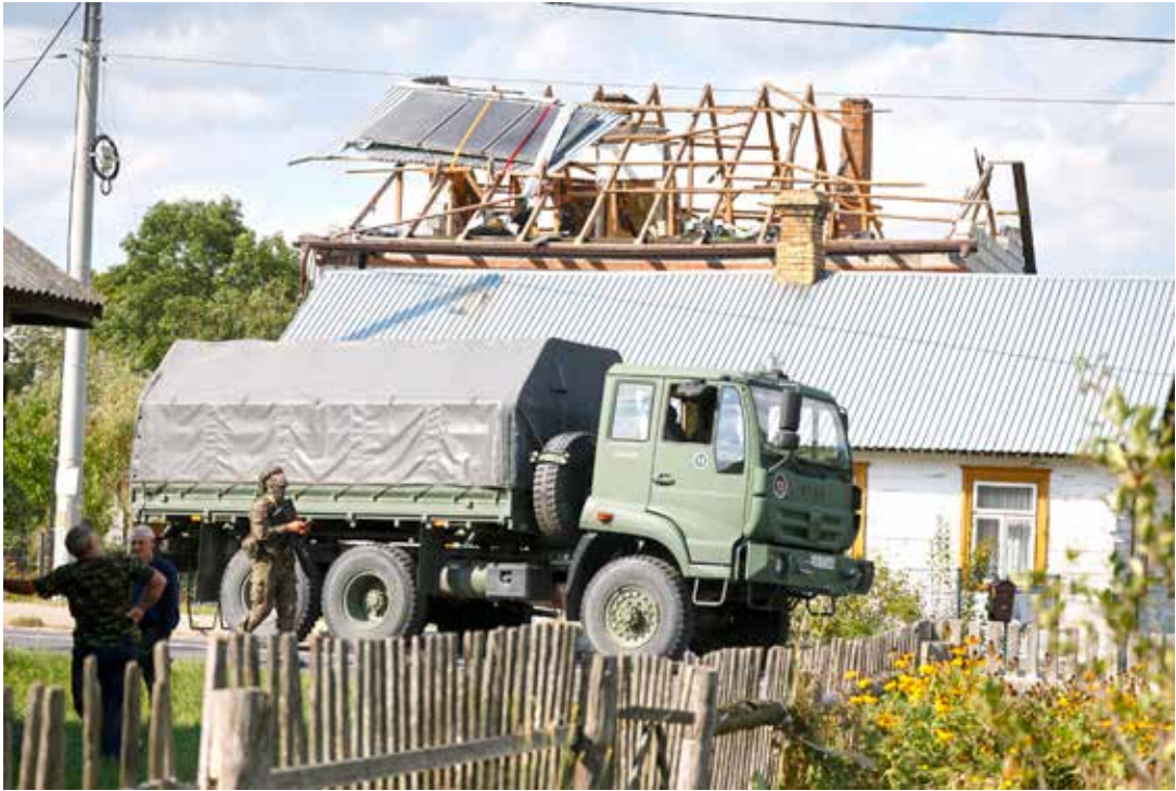
Police and army inspect damage to a house destroyed by debris from a shot down Russian drone in the village of Wyrki-Wola, eastern Poland

Poland gathered its NATO allies for urgent talks yesterday after Russian drones flew into Polish airspace during an attack on Ukraine, Prime Minister Donald Tusk said, warning that the situation was inching closer to "open conflict". Poland's airspace was violated 19 times, Tusk said, and at least three drones were shot down after Warsaw and its allies scrambled jets -- but authorities said nobody was harmed. Footage posted by local media showed firefighters and police in the village of Wyrki, eastern Poland, inspecting a house with its roof ripped open and debris littered nearby following an impact from a drone. Russian drones and missiles have entered the airspace of NATO members including Poland several times during Russia's three-and-a-half-year war, but a NATO country has never attempted to shoot them down. Tusk said he had invoked NA-