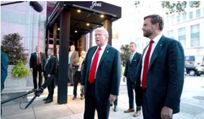
US President Donald Trump (C), flanked by US Vice President JD Vance, US Secretary of Defense Pete Hegseth and US Secretary of State Marco Rubio, speaks to reporters outside the restaurant Joe's Seafood, Prime Steak & Stone Crab in Washington