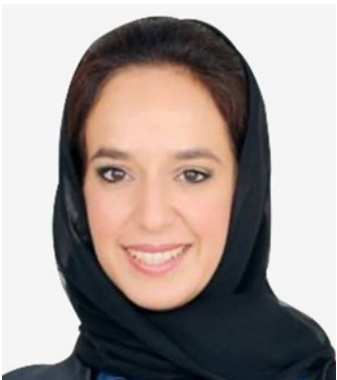
HH Shaikha Hessa bint Khalifa Al Khalifa

Her Highness Shaikha Hessa bint Khalifa Al Khalifa said the award, envisioned by HRH Princess Sabeeka bint Ibrahim Al Khalifa, has become a national platform that honours institutional and individual efforts contributing to women's advancement. Over eight cy-