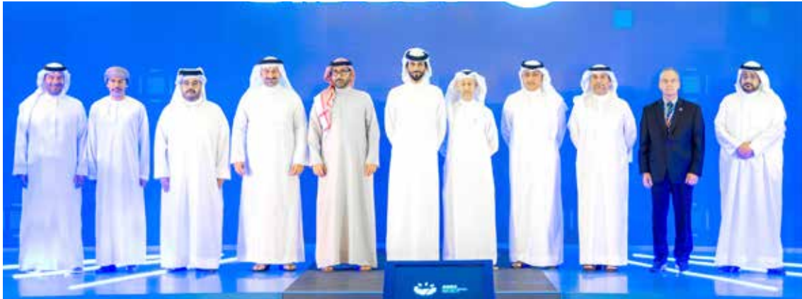
His Highness Shaikh Nasser bin Hamad Al Khalifa with distinguished guests and other attendees at the event

HH Shaikh Nasser bin Hamad: ASRY's solar energy project embodies the Kingdom's forward-looking vision for environmental innovation and the transition to clean energy