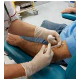
A person receives a dose of the Jynneos vaccine at Spallanzani Hospital, as vaccinations against monkeypox began in Rome, Italy Reuters | London

Health officials in Europe are discussing whether to follow a move by the United States to stretch out scarce monkeypox vaccine supplies, with the World Health Organisation calling for more data.