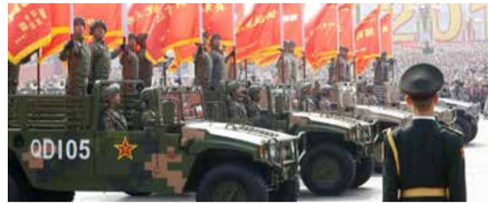
Troops in military vehicles take part in the military parade marking the 70th founding anniversary of People's Republic of China

China's ruling Communist Party had proposed that Taiwan could return to its rule under a "one country, two systems" model, similar to the formula under which the former British