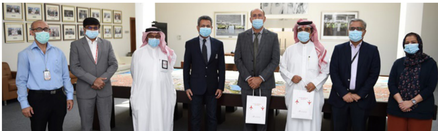
BAC officials during the farewell ceremony