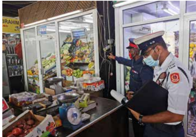
Unsafe electricity connections are inspected by civil defence officers

The posters also shed light on how to evacuate the market and how to properly act in the event of a fire.