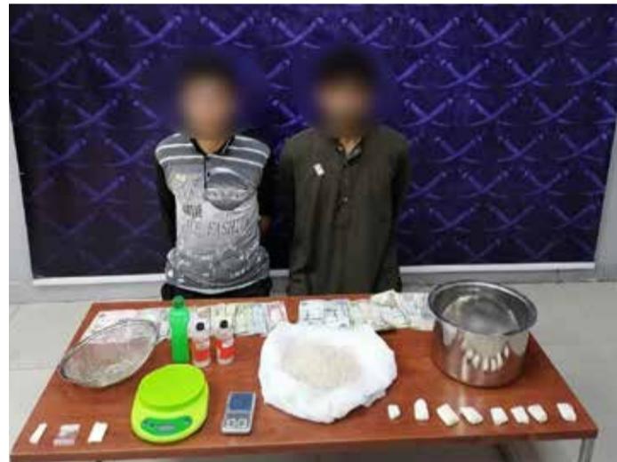
A picture released by the ministry showing the two Asians with the shabu and money they were caught with

The director-general explained that, within the framework of the Anti-Narcotics Directorate police's role in implementing the law and combatting the abuse of drugs and their promoters, the two Asians were identified and were arrested while committing the crime.