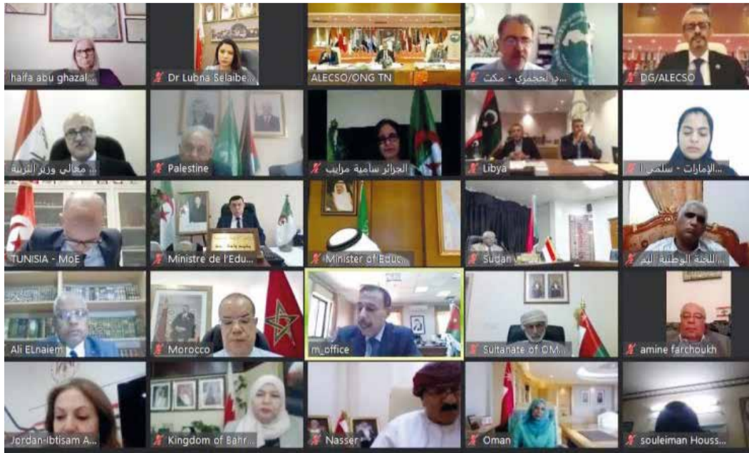
The Arab League Educational, Cultural and Scientific Organization (ALECSO) held its general congress as part of the 25th session.

There is a need for "more support to achieve common goals, to promote Arab cooperation,"