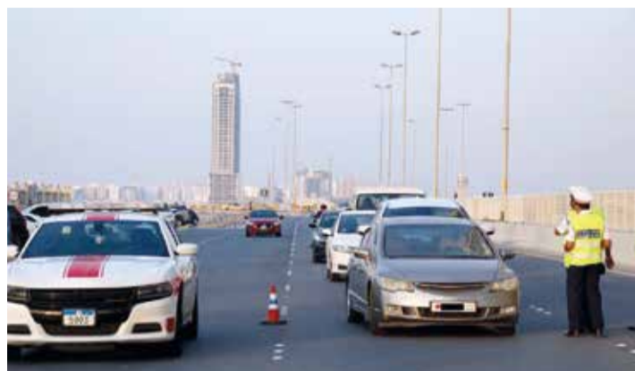
In pictures, traffic authorities during the campaign