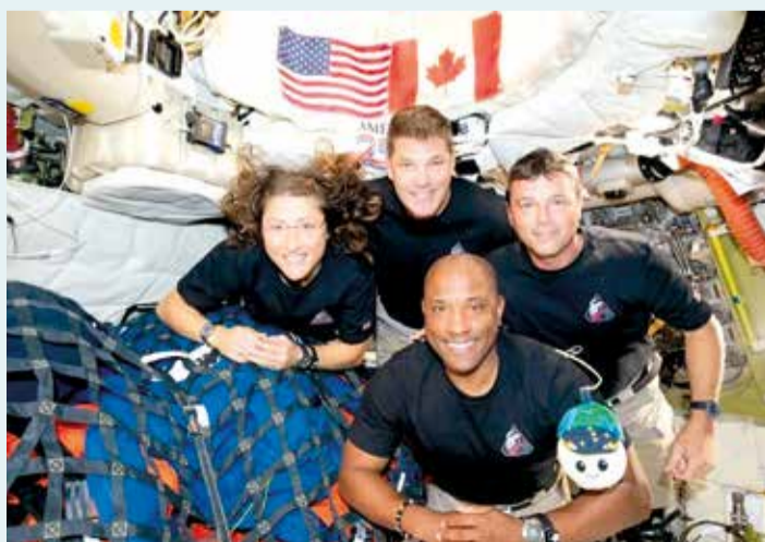
Christina Koch (L), Jeremy Hansen (top), Reid Wiseman (R), and Victor Glover (bottom) posing for a group photo inside the Orion spacecraft

They are scheduled to splash down in the Pacific Ocean off the coast of San Diego at 5:07