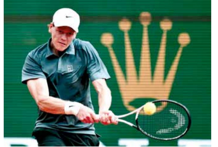
Jannik Sinner in action