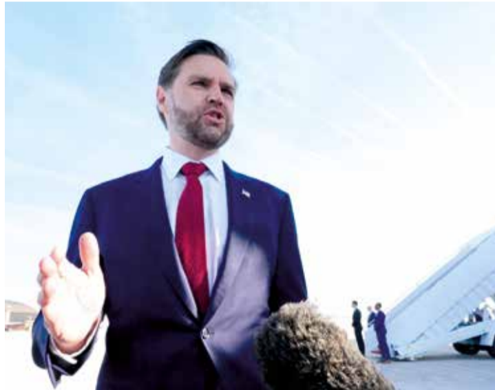
US Vice President JD Vance speaks to reporters before boarding Air Force Two

United States remains open to diplomacy, any attempt by Iran to manipulate the process would be met with a firm response.