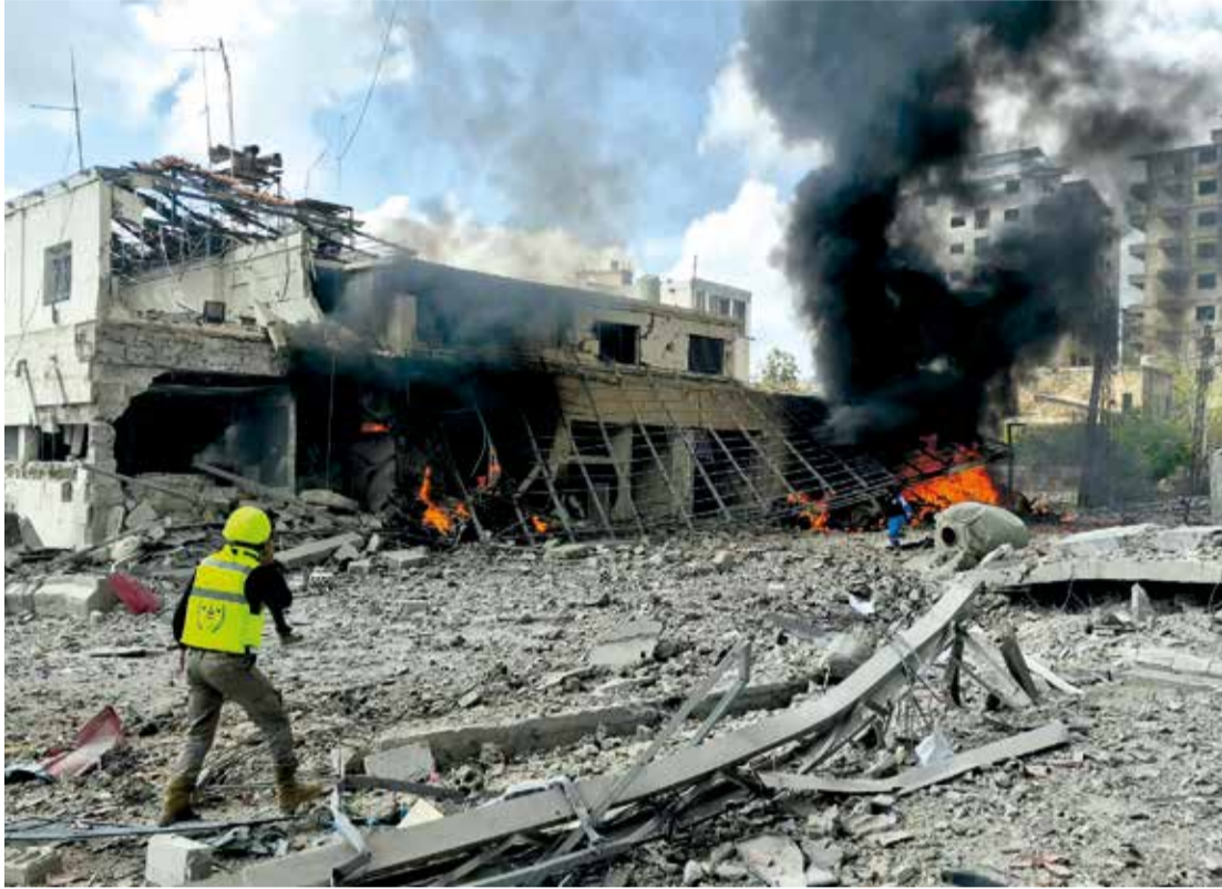
First responders rush to the site of an Israeli airstrike that targeted the Lebanese State Security Center, in Nabatieh

Barack Obama and Raúl Castro meet in Panama, the first meeting of US and Cuban heads of state since the Cuban Revolution