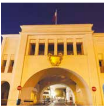
over the Kingdom, the Bahrain Defence Force (BDF) said, marking a sharp break from weeks of sustained aerial threats and offering a crucial breather amid heightened regional tensions.

Bahrain's skies fell silent yesterday, with no missiles or drones detected