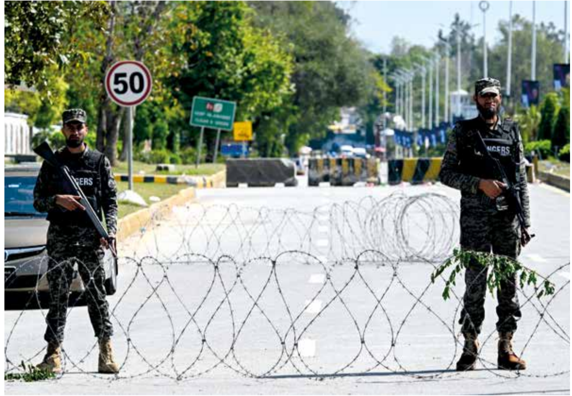
Security personnel stand guard near the expected venue of the US-Iran talks in the Red Zone area of Islamabad

Israel approves 34 new West Bank settlements: media, NGO