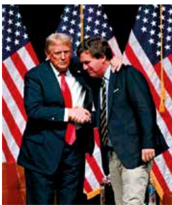
US President Donald Trump and Tucker Carlson

In the president's cross-hairs were Tucker Carlson and Megyn Kelly -- two former Fox News hosts turned independent podcasters -- as well as Candace Owens and Alex Jones, also podcasters and prominent conspiracy theorists.