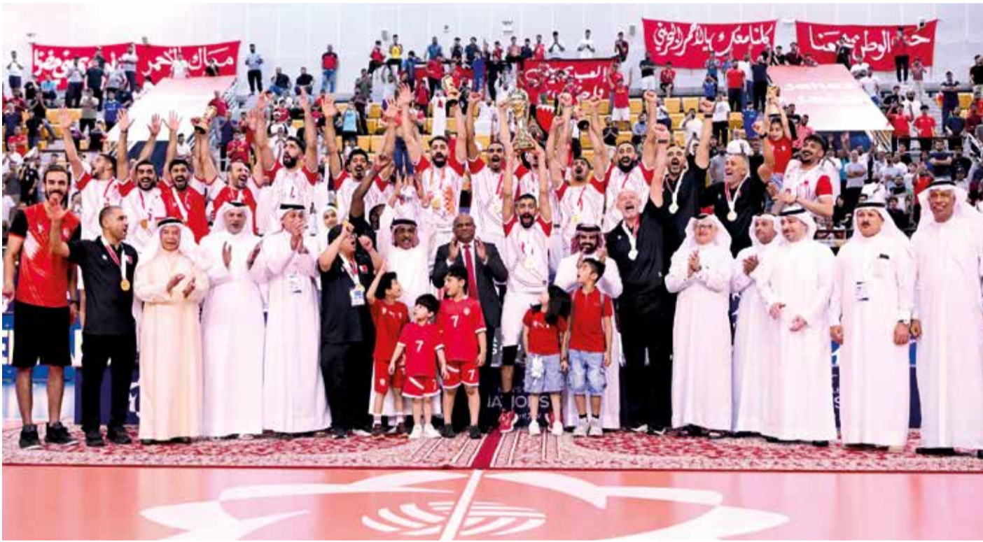
Bahrain captain Nasser Anan lifts the inaugural 2025 AVC Men's Volleyball Cup on home soil