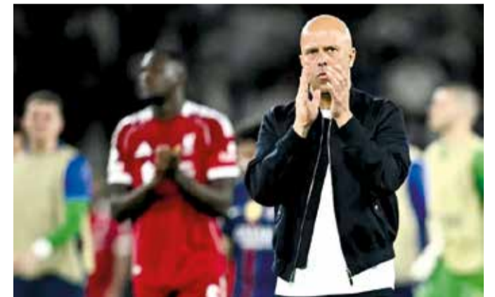
Liverpool manager Arne Slot