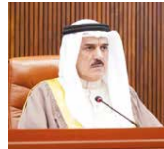
Ahmed Al Musallam, Parliament Speaker

The Services Committee backed the bill in principle but