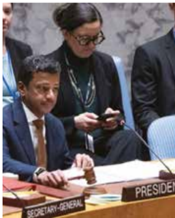
Permanent Mission of the Kingdom of Bahrain to the United Nations in New York, on behalf of the United Arab Emirates, Saudi Arabia, Qatar, Kuwait and Bahrain.

The warning came in a joint letter sent to the UN Secretary-General and the President of the Security Council by the