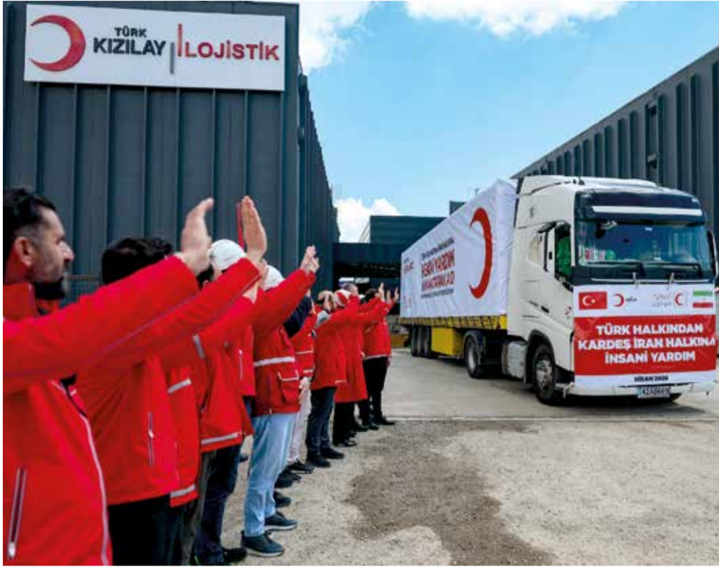
Workers wave as a truck of The Red Cross and Turkey's Red Crescent leaves to send supplies to Iran, in Ankara