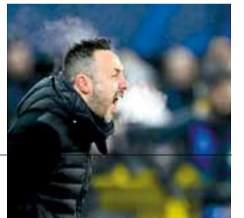
Roberto De Zerbi

"What I want to do, what I want to achieve immediately is the character, is the right spirit, the right courage to play,