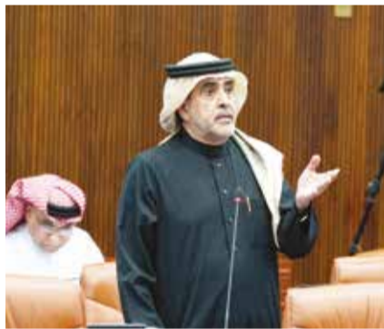
Khalid Buanaq, MP

Authorities noted that cancelled applicants can reapply within two years if they meet