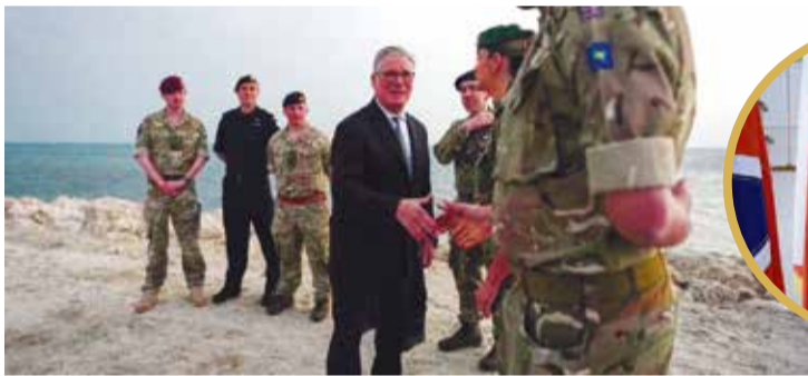
Starmer meets military personnel on a beach in Bahrain