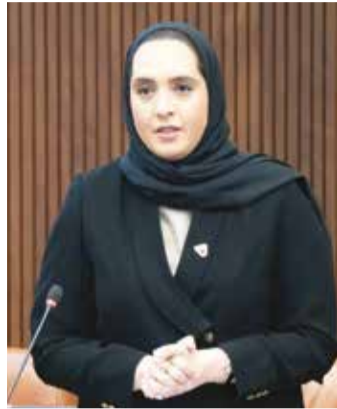
Amna Al Rumaihi, Housing Minister

The first phase of the Muharraq Historic City Development Project is set for completion by the end of 2026, providing housing for 300 Bahraini families, according to Housing and Urban Planning Minister Amna Al Rumaihi.