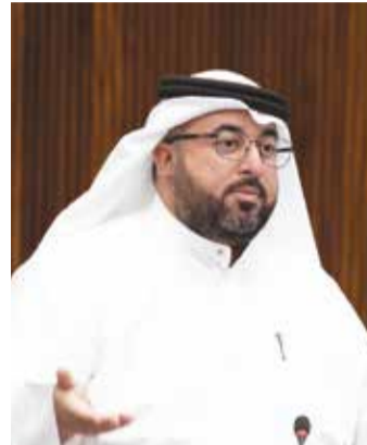
Hamad Al Doy, MP

“The restoration of buildings along the Pearling Path will strengthen Muharraq's position as a cultural and tourism destination.”