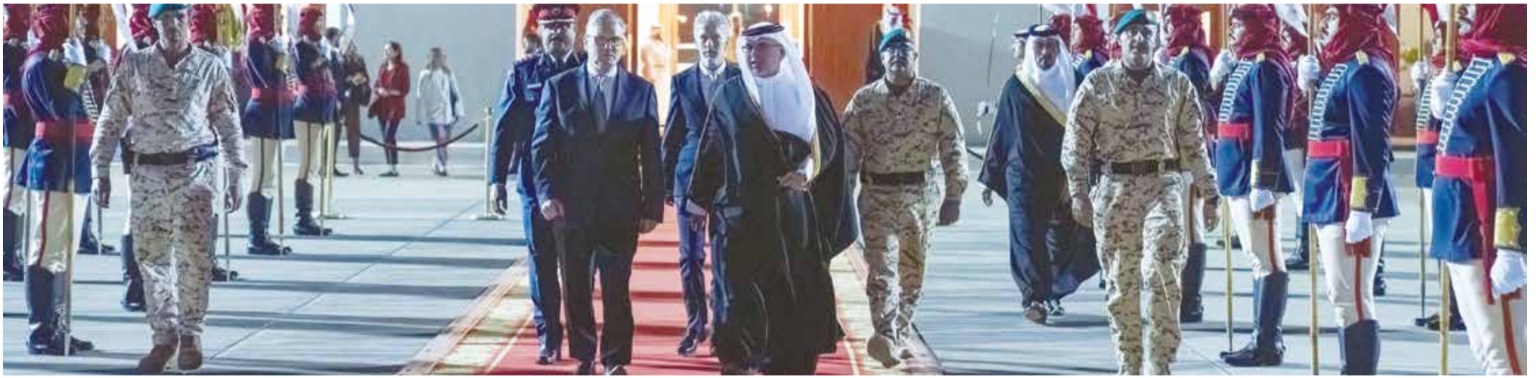
Starmer departs Bahrain on Thursday Night after high-level meetings with leadership during his three day visit to the region

Reaffirms unwavering security commitment to Bahrain during Starmer visit