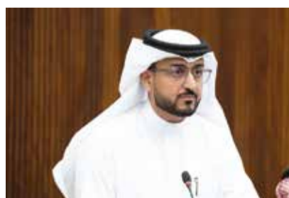
Abdulwahid Qarata, MP

The ministry said 7,000 housing services are set for delivery