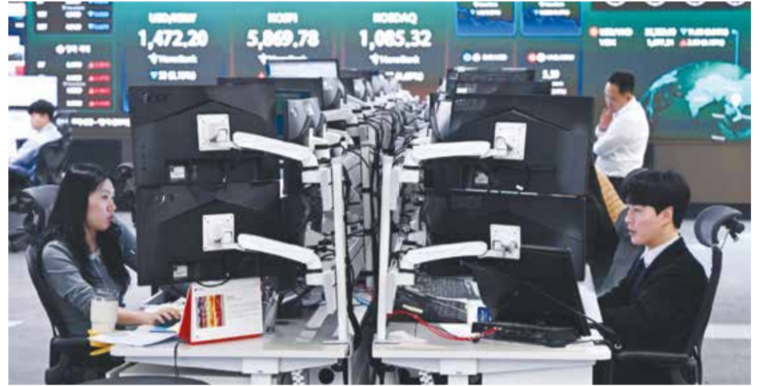
Currency dealers monitor exchange rates as a screen shows South Korea's benchmark stock index (KOSPI) in a foreign exchange dealing room at the Hana Bank headquarters in Seoul

But despite this week's rebound, stock markets remain