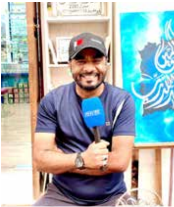
A calligrapher at his stall

Between the stalls sits a calligrapher whose journey began