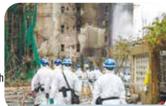
Hong Kong fire death toll climbs to 160

◆ The death toll in Hong Kong's worst fire in decades rose to 160 after an additional body was identified, police said yesterday, adding that six people were still listed as missing. The blaze that tore through a high-rise apartment complex late last month was the world's deadliest residential building blazed since 1980. Authorities reported a death toll of 159 last week after all affected buildings had been searched. The toll increased by one on Tuesday after forensic testing revealed that a set of remains already included in the toll turned out to also include a second person, according to police commissioner Joe Chow. Officers have finished clearing away the fallen scaffolding around the towers and found one piece of "suspected human bone", which is pending tests, Chow added. The identities of 120 out of the 160 dead have been identified via DNA or fingerprint testing.