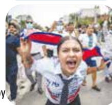
Nepal approves 114 parties for post-uprising polls

◆ Ukraine should hold elections, Trump says