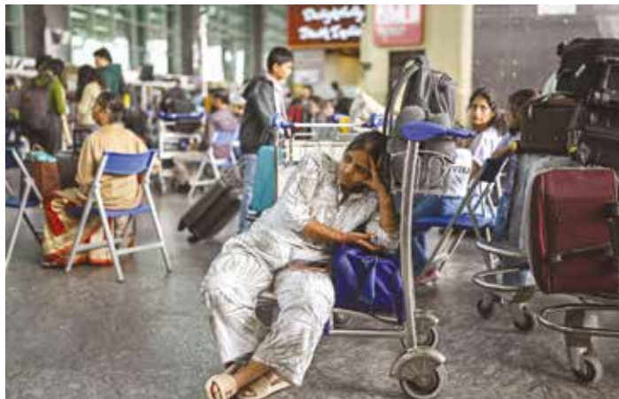
A passenger waits outside the IndiGo Airlines kiosk at the Kempegowda International Airport in Bengaluru

But India's aviation regulator, the Directorate General of Civil Aviation (DGCA), told the airline to cut its planned flights by five percent, as it had "not demonstrated an ability to oper-