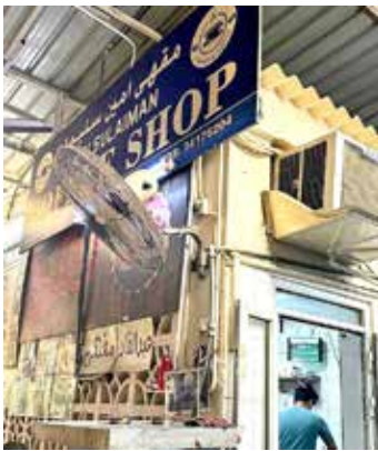
Abdul Qadir Cafe a souq classic for 60 Years

only source of income," he says proudly. "Bahrain has always supported me."