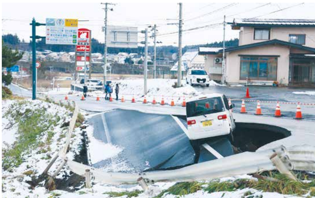
A vehicle rests on the edge of a collapsed road in Tohoku town in Aomori Prefecture

that we've never experienced. It lasted maybe for about 20 seconds," Shimohata said by phone.