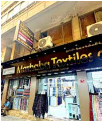
Marhabat Textiles: Threads that tell a 1976 story

ple who keep this legacy alive shine brightest. This year, we sat with artisans and shopkeepers whose stories reflect the Souq's enduring spirit.