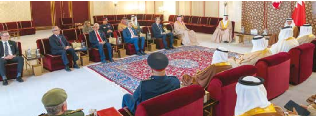
His Royal Highness meets with the RFFS sponsors