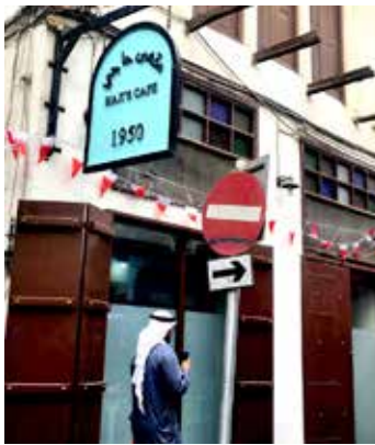
Where generations meet over a cup of tea

Walk a little deeper and you'll find Marhabat Textiles, a shop that has stitched itself into the history of the Souq.