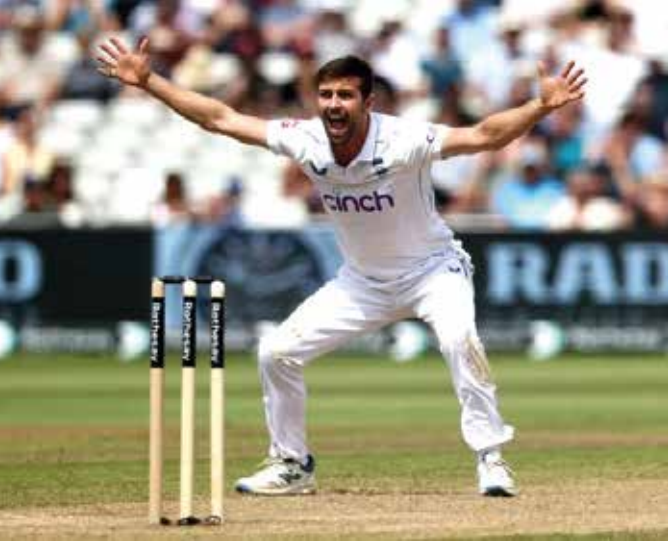
England's Mark Wood reacts during a match (file photo)