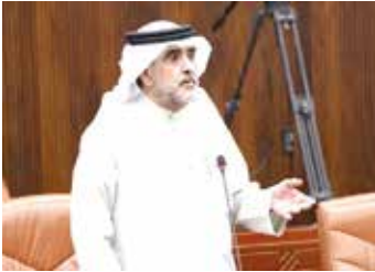
MP Khaled Buanaq

Parliament yesterday backed an urgent proposal asking the government to add extra checks, within the laws in force, on foreign investors, foreign owners of commercial registrations and registered workers under the flexi visa system, to stop them leaving Bahrain for good without settling what they owe, after the vote was postponed from last week’s session.