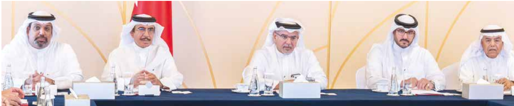
HRH the Crown Prince and Prime Minister chairs a meeting of the Supreme Commission for the RFFS

HRH Prince Salman highlights HM King's steadfast backing for families of fallen servicemen