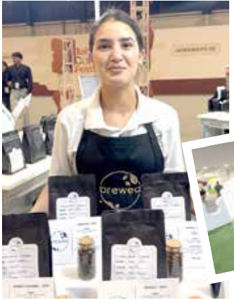
The festival features a variety of local and international coffee brands

The festival also featured an extensive range of café essentials, lining up everything from professional coffee machines and advanced grinders