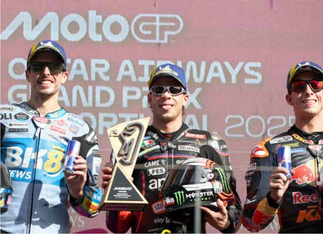
First placed Aprilia Racing team's Italian MotoGP rider Marco Bezzecchi (C), second placed BK8 Gresini Racing MotoGP team's Spanish MotoGP rider Alex Marquez (L) and Red Bull KTM Factory Racing team's Spanish MotoGP rider Pedro Acosta celebrate on the podium

Aprilia rider Marco Bezzecchi produced the perfect ride on a testing Algarve International Circuit to win the Portuguese MotoGP yesterday. Starting from pole, the 26-year-old Italian controlled the 25-lap race from start to finish ahead of Alex Marquez (Ducati-Gresini) and Pedro Acosta (KTM). After a frantic opening lap in which Franco Morbidelli slid off the track, Bezzecchi took total control and never allowed Marquez to close. The Italian finished 2.583 seconds in front of Marquez who recovered from a mistake in qualifying to claim his 12th podium of the season. For the second day running, Marquez was kept on his toes throughout by 21-year-old Acosta who finished second behind