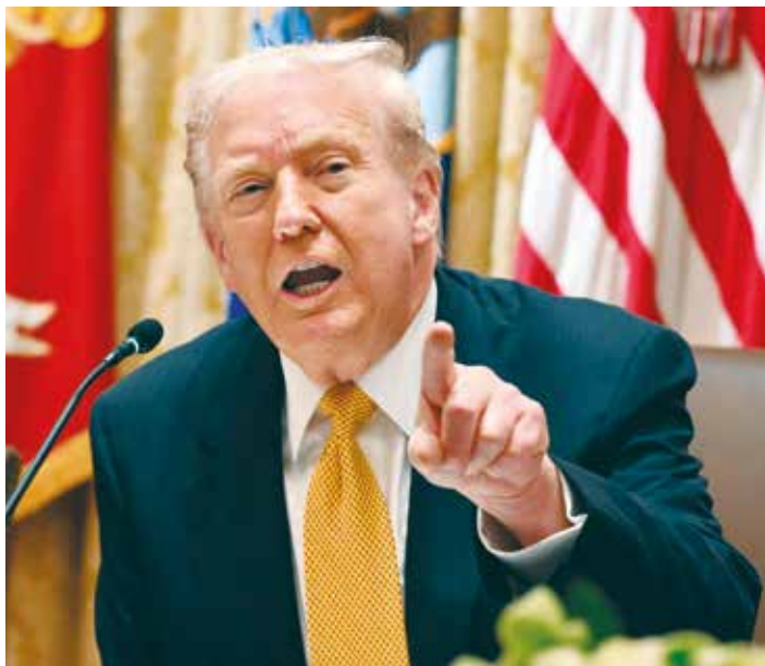
U.S. President Donald Trump

A UK government minister yesterday described as "incredibly serious" alle-