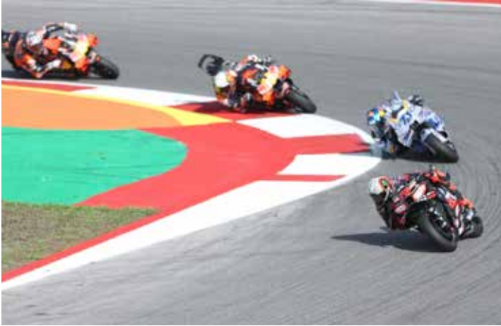
(From R) Aprilia Racing team's Italian MotoGP rider Marco Bezzecchi, BK8 Gresini Racing MotoGP team's Spanish MotoGP rider Alex Marquez and Red Bull KTM Factory Racing team's Spanish MotoGP rider Pedro Acosta compete

tra to catch Pedro and Alex because yesterday they were super-quick." Bezzecchi's second win of the season, and his fifth overall in MotoGP, meant he can take third place in the championship be-