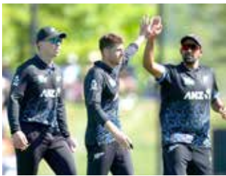
New Zealand's Mitchell Santner, Michael Bracewell and Ish Sodhi celebrate

dashed at 88-8 in the 13th over before Shepherd and fellow seamer Shamar Springer began striking the ball cleanly to the boundary.