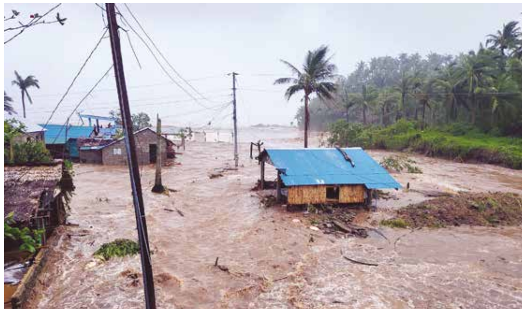
Houses amid surging floodwaters as Super Typhoon Fung-wong hit the coast in Pandan, Catanduanes province

Rescuer Juniel Tagarino in Catbalogan City told AFP the body of a 64-year-old woman attempting to evacuate had been pulled out from under debris and fallen trees.