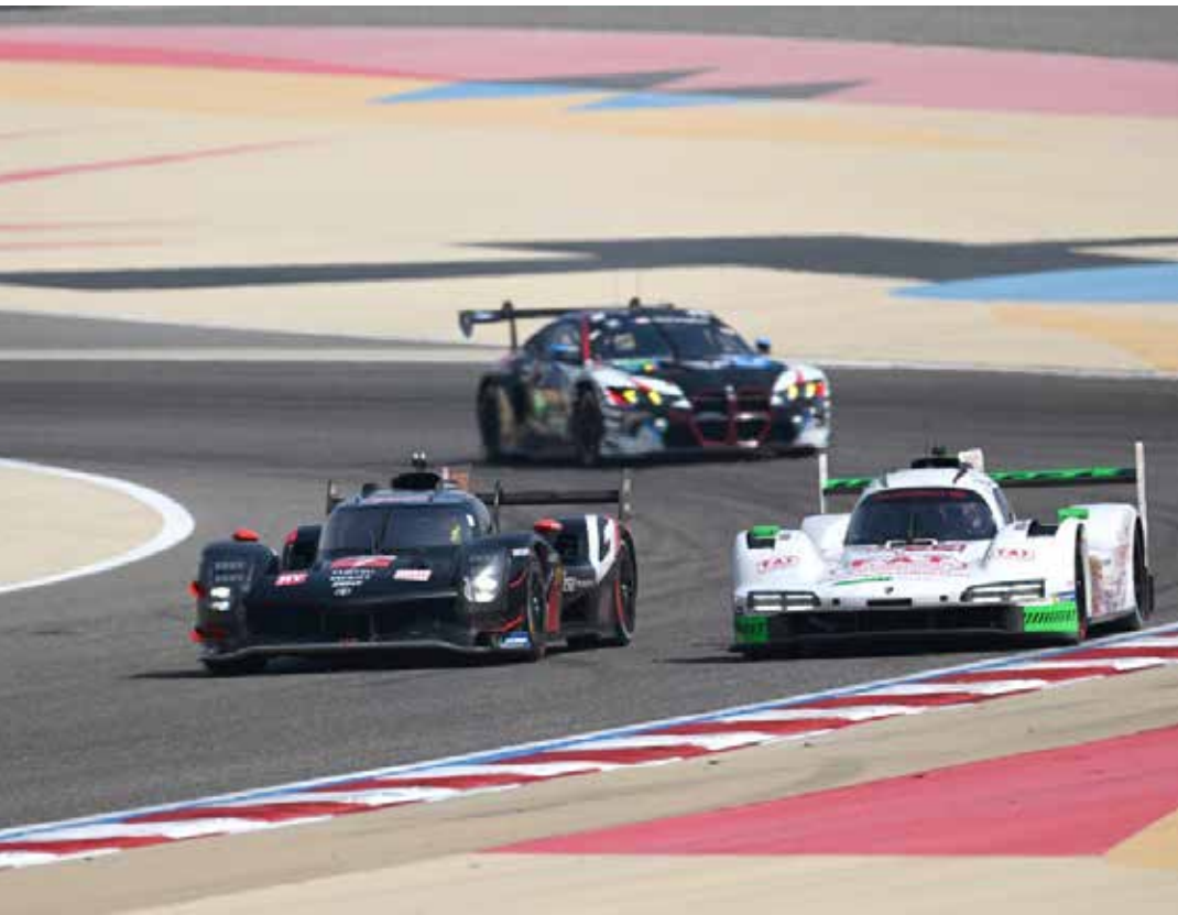
Action from the end-of-season Rookie Test

Antonio Felix da Costa sets pace for Alpine Endurance Team in end-of-season WEC Rookie Test at BIC