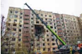
Aa heavily damaged residential building in Dnipro

Moscow, which has escalated attacks on Ukraine's infrastructure in recent months, launched hundreds of drones at energy facilities across the country overnight into Saturday.