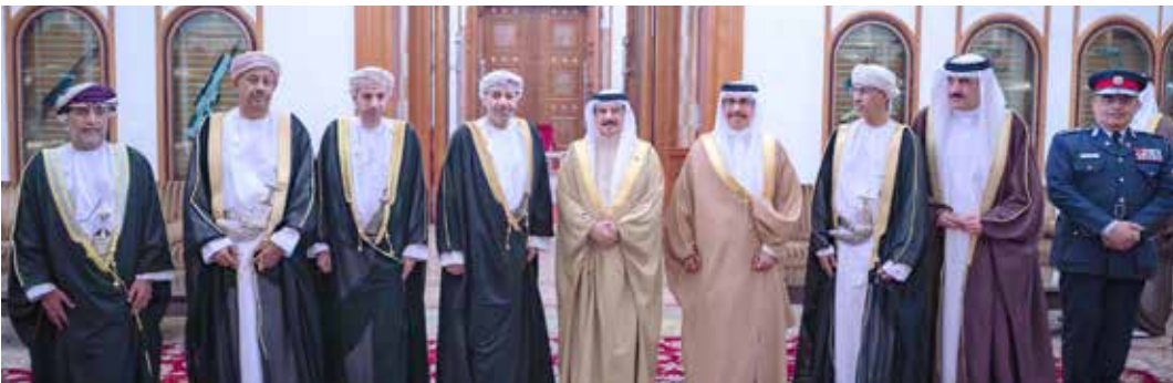
HM the King receives the Omani Interior Minister of Interior.

The visit was at the invitation of General Shaikh Rashid bin Abdullah Al Khalifa, Minister