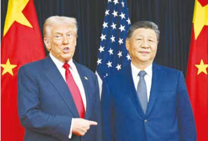
US President Donald Trump (L) and China's President Xi Jinping

C hina suspended an export ban to the United States that had targeted gallium, germanium and antimony, metals crucial for modern technology, Beijing's commerce ministry announced Sunday in a further de-escalation of the trade war with Washington. The restrictions banned the export of so-called dual-use goods, materials that can have both civilian and military applications. Imposed in December 2024, the ban will now be suspended until November 27, 2026, Beijing's commerce ministry said in a statement.