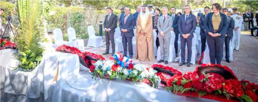
The British Embassy in the Kingdom of Bahrain yesterday commemorated Remembrance Day, an annual observance honouring military and civilian victims who lost their lives in past and present wars and conflicts. The ceremony, held in the embassy's garden in Manama, was attended by officials, diplomats, students, religious leaders, members of the armed forces, and representatives of the diplomatic and expatriate communities.