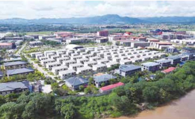
the KK Park complex in Myanmar's eastern Myawaddy township, as pictured from Mae Sot district in Thailand's border province of Tak.