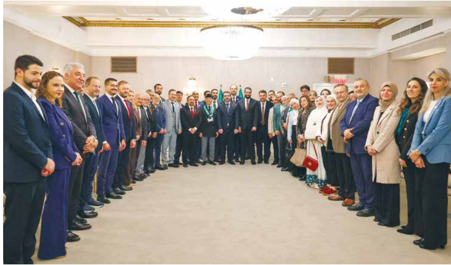
Syrian Foreign Minister Asaad al-Shaibani (Top-CL) and Syria's President Ahmed al-Sharaa (Top-CR) posing with representatives of Syrian-American organizations in Washington DC.

The United States plans to establish a military base near Damascus "to coordinate humanitarian aid and observe developments between Syria and Israel," a diplomatic source in Syria told AFP.