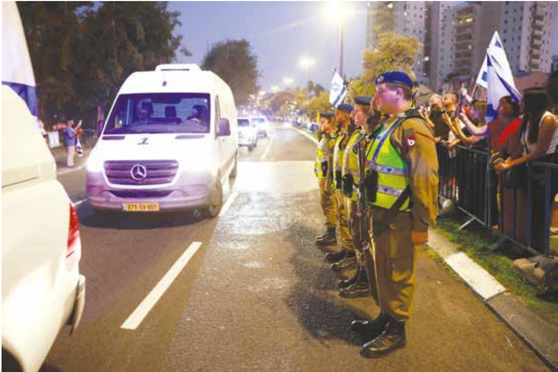
Israeli soldiers salute and people hold national flags as a van carrying human remains, thought to be those of Lt. Hadar Goldin, whom Hamas claims to have returned as part of a ceasefire agreement between Israel and Palestinian factions in Gaza, arrives at the National Center for Forensic Medicine in Tel Aviv