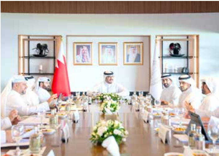
His Highness Shaikh Isa bin Salman bin Hamad Al Khalifa chairs the meeting

His Highness emphasised the importance of implementing forward-looking development plans and programmes that enhance the quality and competi-