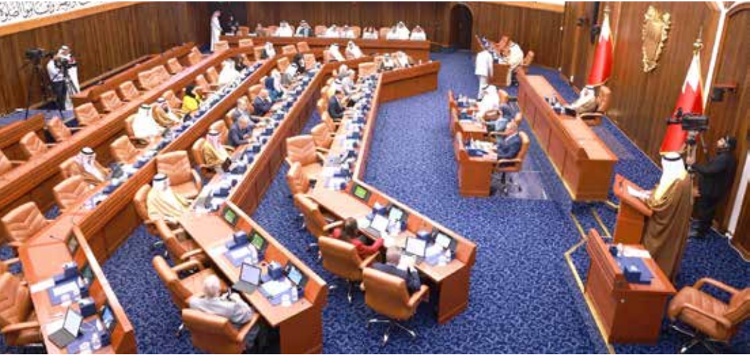
Shura session in progress

Foreign Affairs, Defence and National Security Committee head Dr Ali Al Rumaihi said: “The convention, initiated by the brotherly Kingdom of Saudi Arabia, fits with related international agreements. We heard from the Interior, Foreign Affairs and Justice ministries, and we recommend approval.”