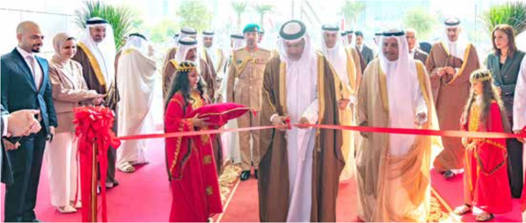
HRH the Crown Prince and Prime Minister officially inaugurates the expansion project with a ribbon-cutting

During the inauguration, HRH the Crown Prince and Prime Minister toured the new extension, noting the seamless blend of modern facilities with tradi-