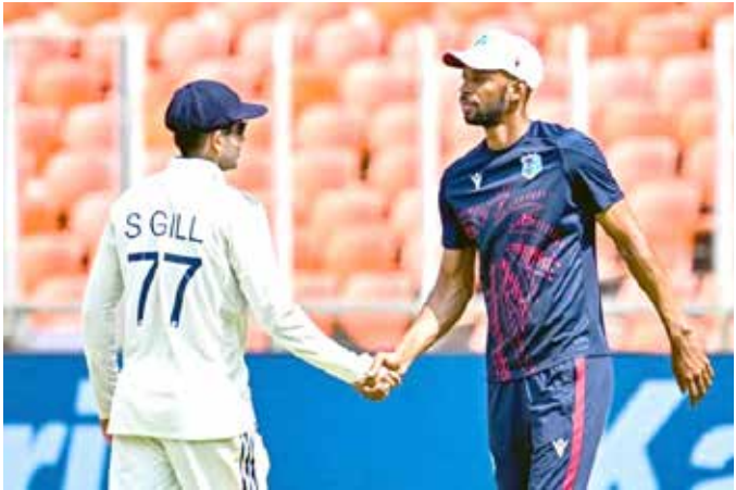
India's captain Shubman Gill (L) shakes hands with his West Indies' counterpart Roston Chase