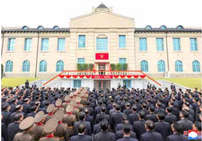
North Korean leader Kim Jong Un (top C) delivering a speech at the Party Founding Museum in Pyongyang

◆ A moderately strong earthquake struck yesterday near a northern Philippine mountain city home to hundreds of thousands of people, forcing people out of buildings and shutting down schools, officials said. Employees rushed out of office buildings in the city of 366,000 following the shallow quake which occurred at 10.30 am, 10 days after a powerful quake killed more than 70 people