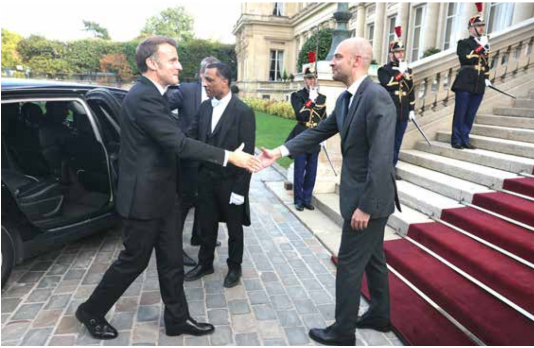
France’s outgoing Minister for Europe and Foreign Affairs Jean-Noel Barrot (R) greets France’s President Emmanuel Macron at the Quai d’Orsay, France’s Ministry for Europe and Foreign Affairs, in Paris

An announcement of a new prime minister looked more likely on Friday, and could even include a cabinet lineup, a source