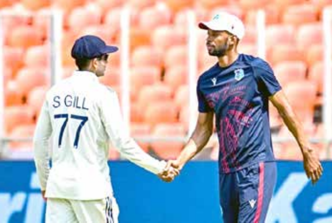
India's captain Shubman Gill (L) shakes hands with his West Indies' counterpart Roston Chase