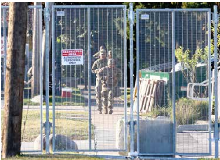
Members of the Texas National Guard walk inside the perimeter of a US Immigration and Customs Enforcement (ICE) detention facility in Broadview, Illinois

The government argues the troops are needed to protect federal agents during immigration raids in the Democratic strong-