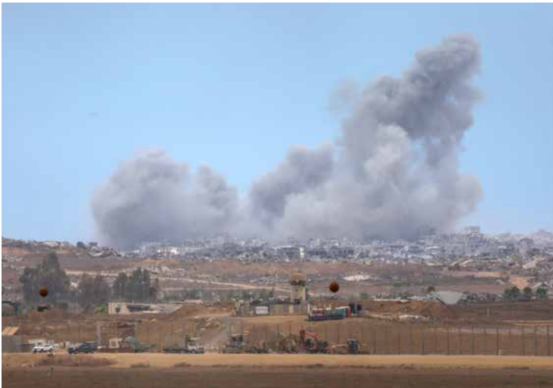
A smoke plume billows following Israeli bombardment on the Gaza Strip as seen from across the border in southern Israel

The Israeli army said it was preparing to pull back troops in Gaza, in line with the agreement. Trump's plan also calls for the