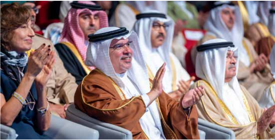
HRH the Crown Prince and Prime Minister attends the award ceremony

Held for the first time outside UNESCO's Paris headquarters, the 2025 ceremony marked the 20th anniversary of the prize's establishment.