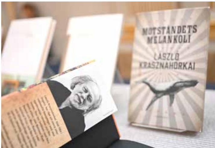
Books of Hungarian writer Laszlo Krasznahorkai are on display at the Swedish Academy in Stockholm

The Academy highlighted Krasznahorkai’s first novel published in 1985, “Satantango”, which brought him to promi-