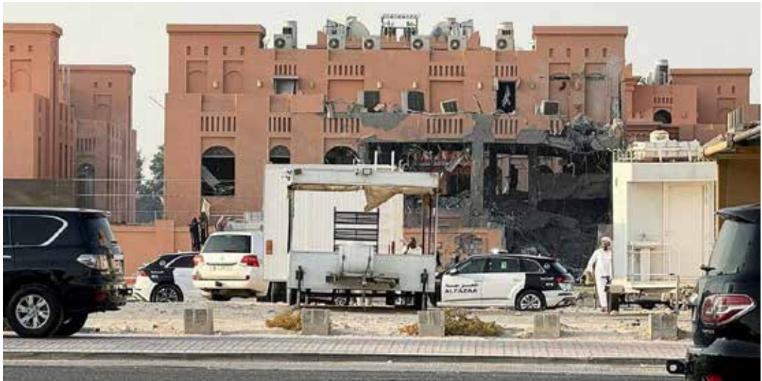
Residential buildings housing Hamas political bureau members in Qatar targeted by Israeli attack

The Shura Council and the Council of Representatives of the Kingdom also affirmed their full support and solidarity with the State of Qatar. The councils announced its backing for all measures and actions Qatar takes to protect its security, stability, and sovereignty, and to