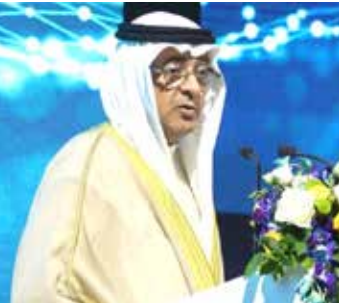
H.E. Jasem Mohamed Al Budaiwi, Secretary General of the Gulf Cooperation Council