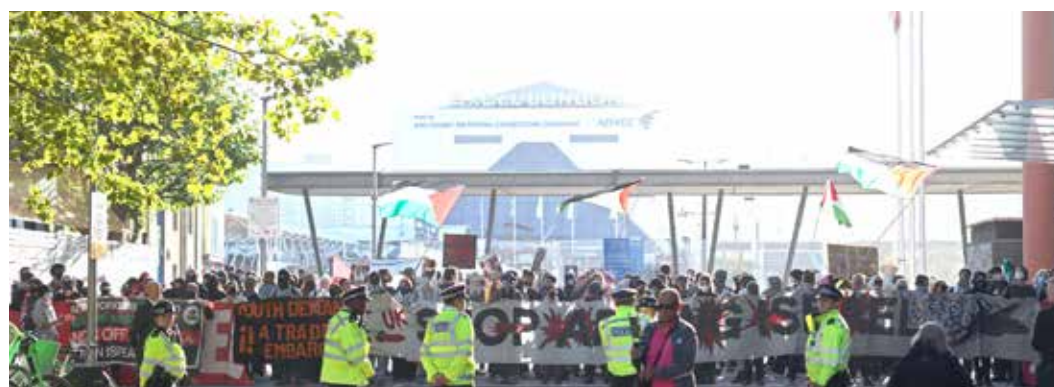
Demonstrators wave Palestinian flags as they protest outside the entrance to the Defence and Security Equipment International (DSEI) fair at the ExCeL centre, in east London

Three protesters were arrested for assaults on police officers, London's Metropolitan Police said. The British government