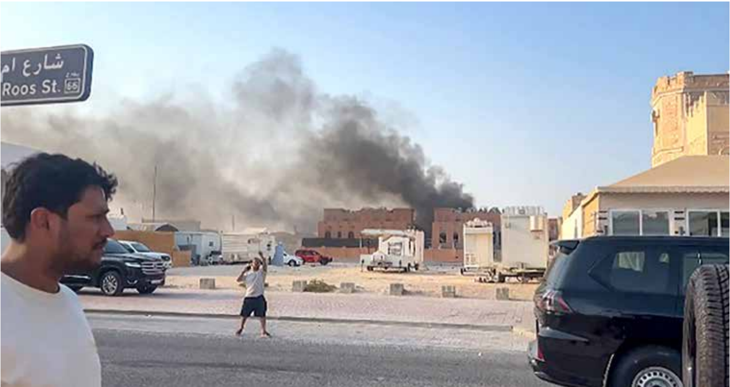
Smoke billowing after explosions in Doha's capital Qatar

The strikes have drawn condemnation, including from UN chief Antonio Guterres, who condemned Israel's "flagrant violation" of Qatari sovereignty. Iran, a key backer of Hamas, condemned the attack as a "gross violation of all international rules and regulations, a violation of Qatar's national sovereignty and territorial integrity, and an attack on Palestinian negotiators". Western allies Saudi Arabia, Jordan and the United Arab Emirates also condemned the attack, among others. "Israel knows exactly what it just did. It just killed the negotiations and any chance of getting its hostages back," said Muhammad Shehada, a political analyst at the European Council on Foreign Relations. "The office in Doha was central to mediation and de-escalation efforts with Hamas... So basically Netanyahu just took a sledgehammer to this, those decades of diplomacy," he added.