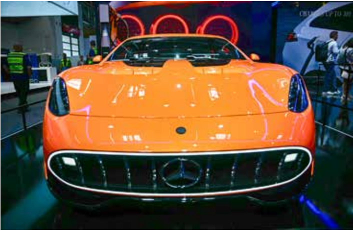
The concept car AMG GT XX from Mercedes-AMG GmbH