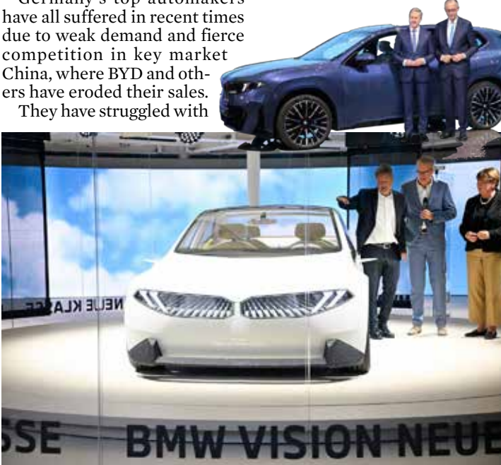
German Minister of Economics and Climate Protection Robert Habeck visits BMW