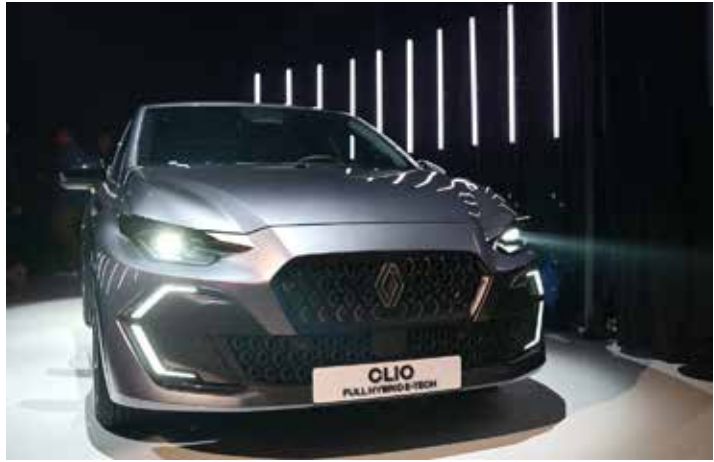
The new Clio car with full-hybrid e-tech of French car maker Renault