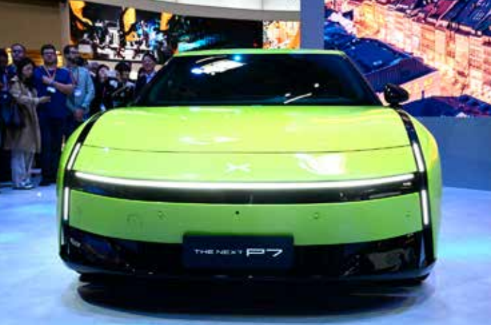
A XPENG P7 electric vehicle by Chinese EV manufacturer XPENG