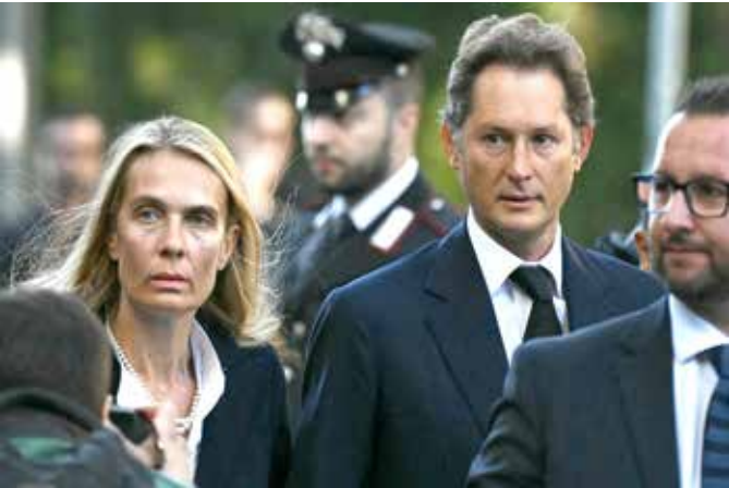
John Elkann and his wife Lavinia Borromeo Milan, Italy