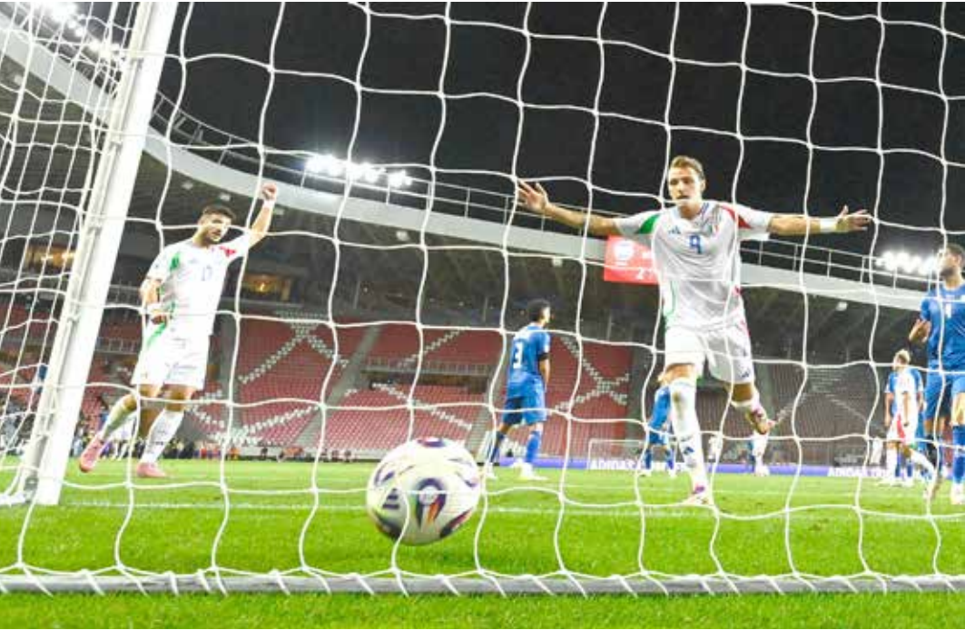
Italy's players celebrate their goal against Israel during the 2026 World Cup qualifiers Europe zone group I football match between Israel and I

Italy trail leaders Norway by three points and still have a chance of taking first place