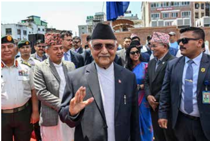
Nepal's Prime Minister KP Sharma Oli

Shortly after, chanting protesters -- some wielding assault rifles, according to an AFP re-