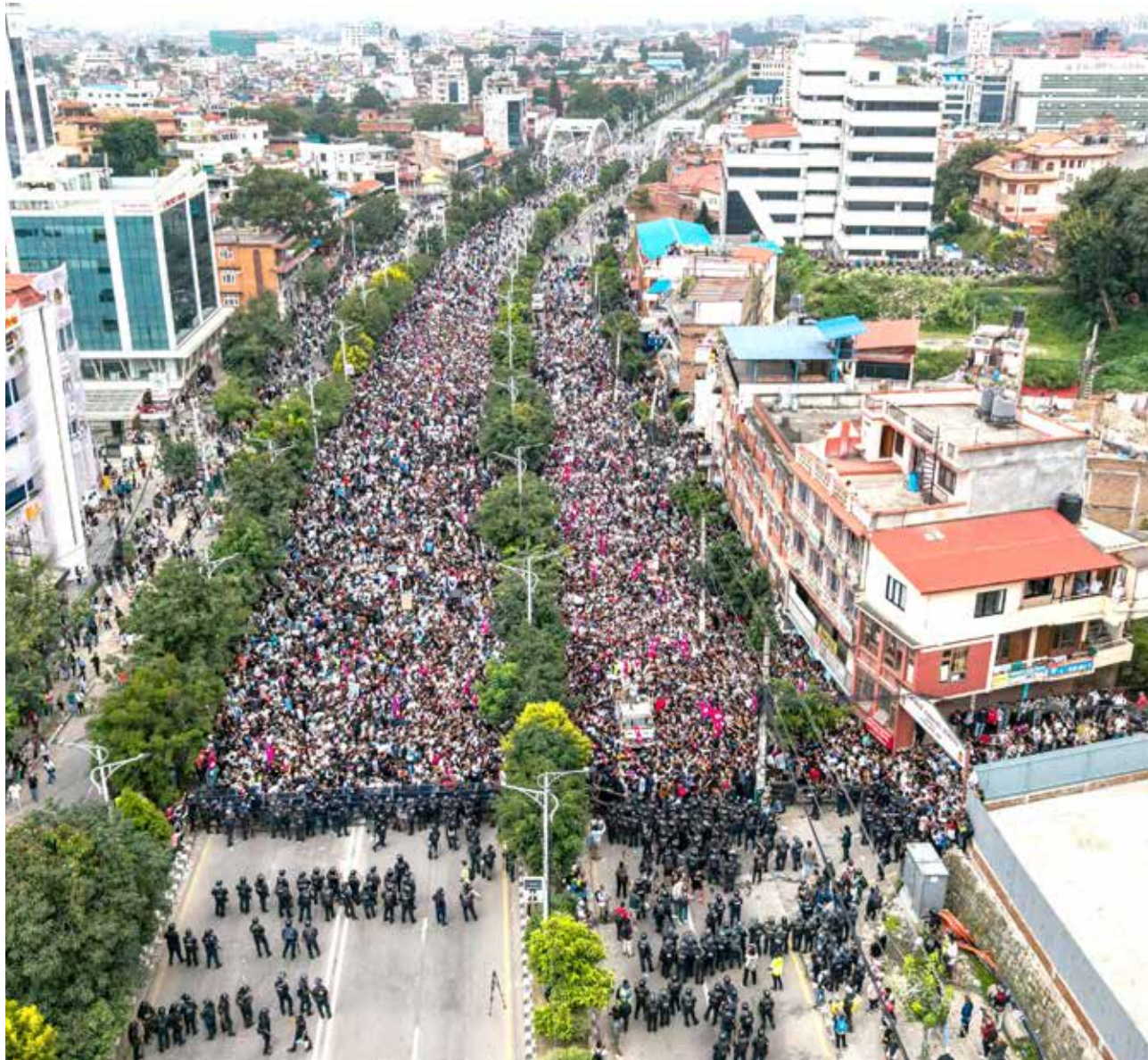
An aerial view shows demonstrators gathered outside Nepal's Parliament during a protest in Kathmandu