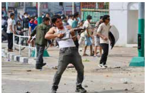
A protester wields a firearm