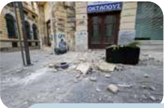
Greece rattled by 5.4-magnitude offshore earthquake

◆ A magnitude 5.4 earthquake struck off the Greek island of Evia early on Tuesday and was felt in Athens, authorities said. The quake hit around half past midnight local time (2130 GMT) 45 kilometres (28 miles) northeast of the Greek capital, said the National Observatory of Athens. The epicentre was four kilometres off the resort of Nea Styra in the southwest of Greece's second-biggest island Evia, also known as Euboea, the institute said. There were no reports of casualties or damage. The observatory had initially reported the magnitude at 5.3 but later revised its reading. The mayor of the nearby city of Marathon, Stergios Tsirkas, described the quake as "very intense", in comments on ERT television.