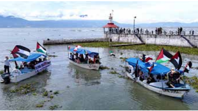
Members of the Committee of Solidarity with Palestine sail boats during an action in support of "The Global Sumud Flotilla" -delegations from 39 countries heading to Gaza Sidi Bou Said, Tunisia