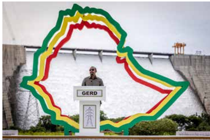
Prime Minister of Ethiopia Abiy Ahmed delivers his remarks during the official inauguration ceremony

ident William Ruto and Somalia's President Hassan Sheikh Mohamud.