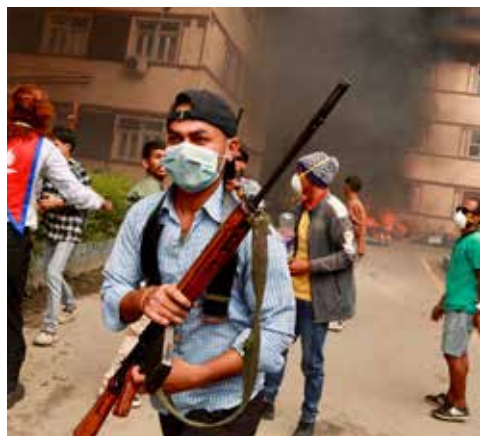
A protester carries a firearm