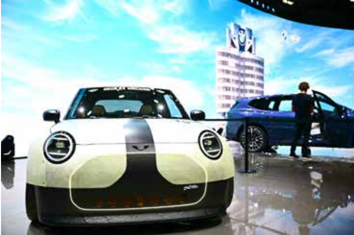
A MINI T53 Deus ex Machina car

Europe's top car manufacturer Volkswagen presented a series of more affordable electric vehicles Monday as Chinese EV titan BYD said it would start producing a cut-price model on the continent. The duelling announcements at the closely-watched Munich auto show highlight the fierce battle shaping up between Europe's traditional automakers and fast-growing Chinese rivals. VW -- along with peers BMW and Mercedes-Benz from the long troubled German auto sector -- are seeking to make up lost ground in the race for electric dominance. Volkswagen unveiled four small EV models from its namesake VW brand, as well as its Cupra and Skoda marques. With starting prices of around 25,000 euros ($29,000), lower than many current EVs made by European manufacturers, their commercial launch is set for