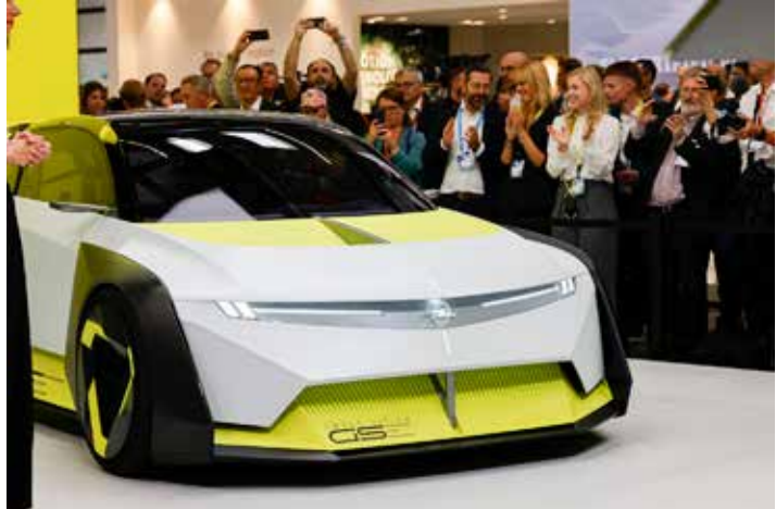
An Opel Corsa Vision GSE concept car

the shift to EVs as demand has proven weaker in Europe than many had anticipated and prices remain too high for many motorists. Calls have meanwhile been growing for the EU to review a plan to end sales of new combustion engine vehicles by 2035 as part of efforts to tackle climate change. Stellantis, whose brands include Jeep and Fiat, as well as BMW and Mercedes have all expressed scepticism or outright opposition to the plan. Volkswagen's Blume added his voice to the criticism on Monday, saying that it was "unrealistic" to aim for "100% electric mobility" in a decade. "We need reality checks every year," he said.