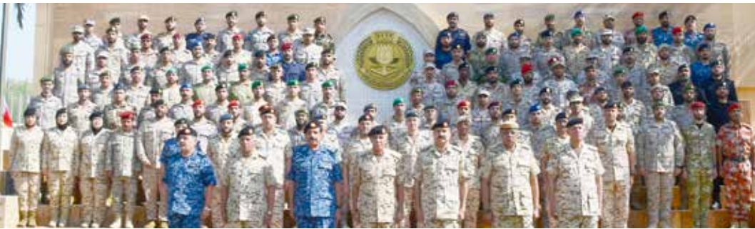
Senior BDF officials with course participants

The course was inaugurated at the Royal Command, Staff, and National Defence College under the patronage of His Excellency Field Marshal Shaikh Khalifa bin Ahmed Al Khalifa, Commander-in-Chief of the Bahrain Defence Force. His Excellency Lieutenant General Theyab bin Saqr Al Nuaimi, Chief of Staff, said the participation of officers from neighbouring states reinforced cooperation and broadened the exchange of expertise. The programme equips participants to take on leadership, op-