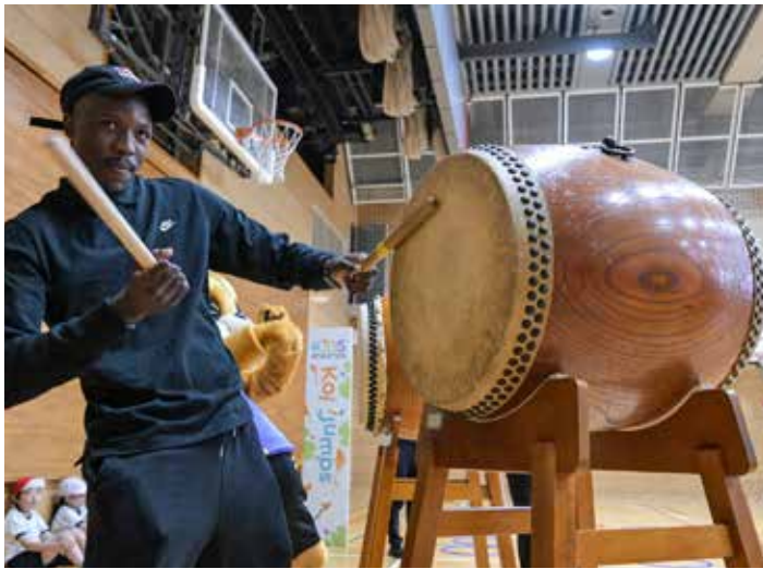
Olympic 200m champion and a global ambassador for the Kids Athletics development programme, Letsile Tebogo of Botswana (L), plays a drum during a visit to a primary school gymnasium ahead of the start of the World Athletics Championships in Tokyo

Tebogo labelled his flamboyant American rival "arrogant" after the race, and Lyles's out-sized character is likely to command the global spotlight again when the world championships