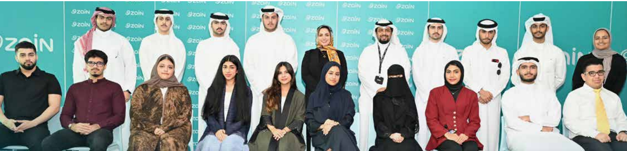
Zain Bahrain has concluded its "Zain Career Connect" summer internship program, reaffirming the company's ongoing commitment to the development of Bahraini youth. Held across July and August, the program welcomed university students from different backgrounds and offered them valuable opportunities to gain industry exposure, benefit from guided mentorship, develop practical skills, and build professional connections. Through Zain Career Connect, Zain Bahrain continues to support young talent by bridging the gap between academic learning and the workplace, empowering students with the tools and experience they need to succeed in their future careers.