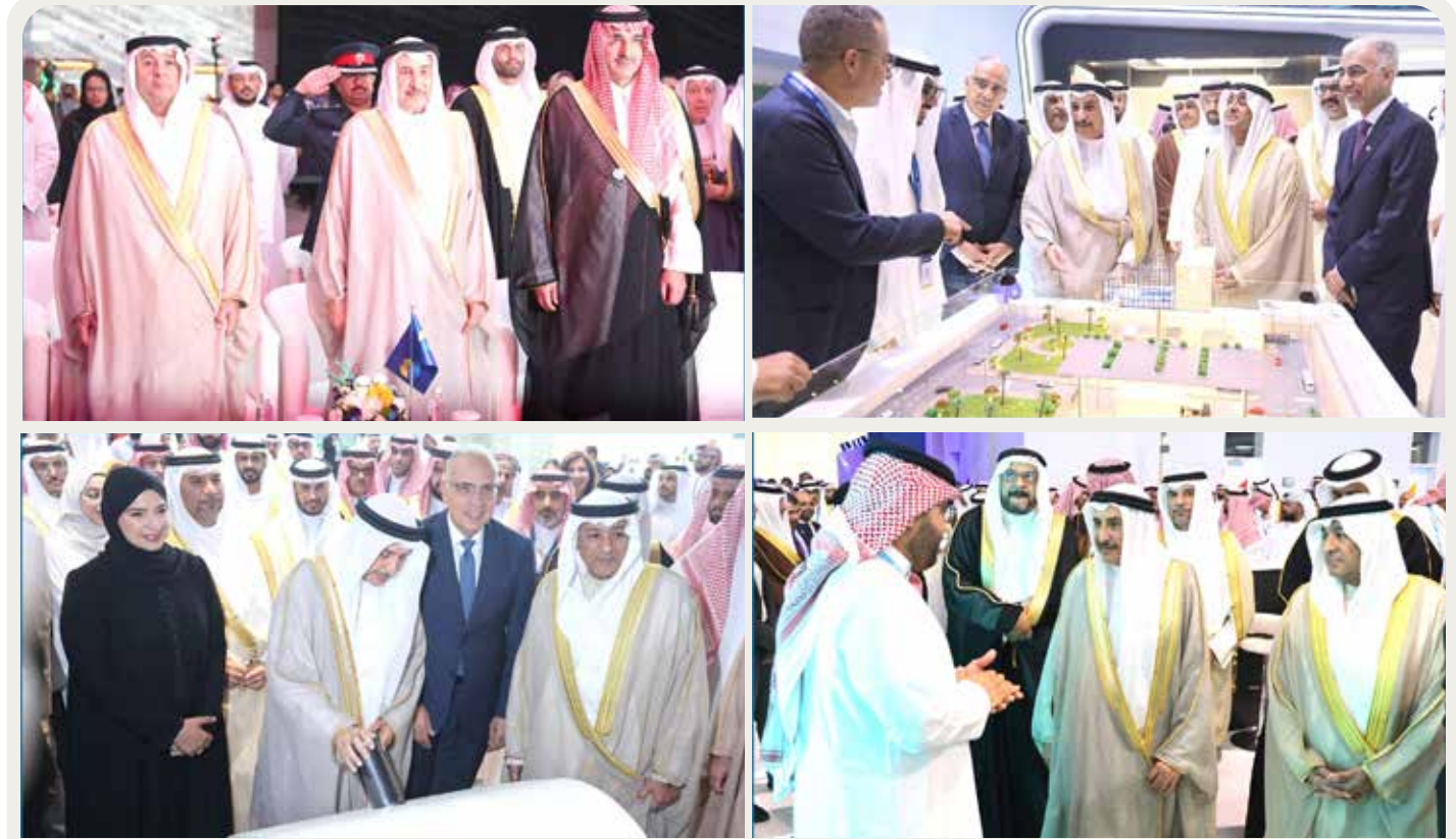
H.E. Shaikh Khalid bin Abdulla Al Khalifa, Deputy Prime Minister, inaugurates the GWECCC 2025 Exhibition

“Through innovation, research, and investment in renewable energy, the GCC countries are balancing economic