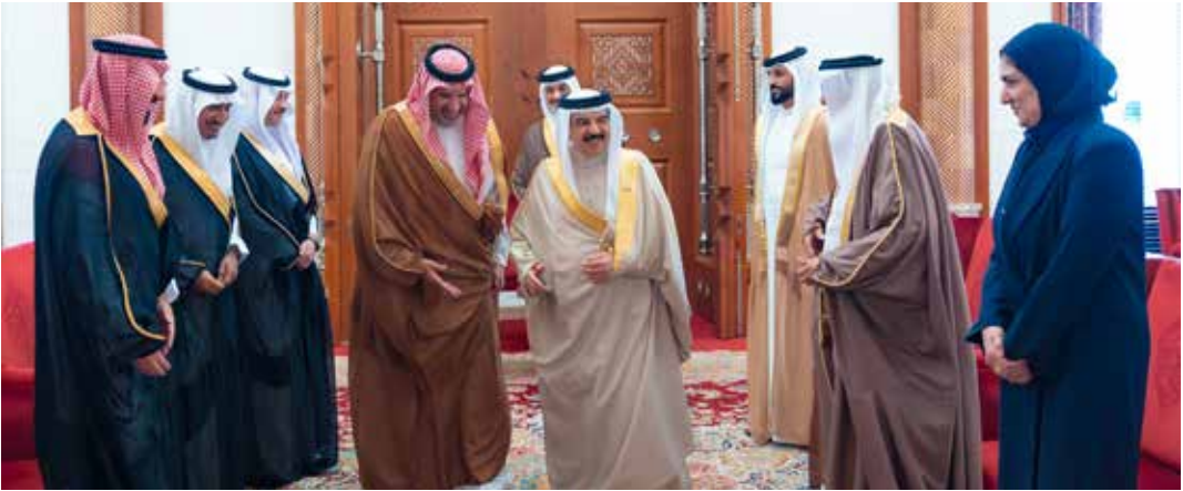
HM the King receives HRH Prince Faisal bin Salman

HM the King made the remarks as he received yesterday, at Al Safriya Palace, His Royal Highness Prince Faisal bin Salman bin Abdulaziz Al Saud, Special Advisor to the Custodian of the Two Holy Mosques,