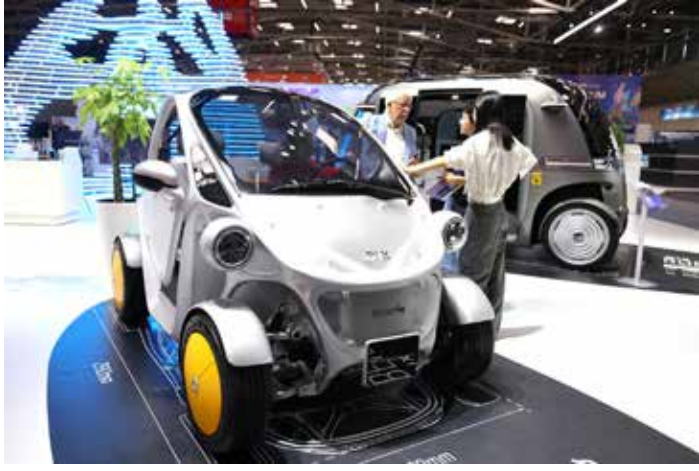
A PIX Beastie mini electric vehicle with a 3D printed unibody chassis

And he conceded that the situation in China, where VW has lost market share to local rivals, was highly competitive. BYD "without a doubt is doing a great job there," he said. Resistance to EU ban BYD meanwhile announced that its Dolphin Surf electric compact car, already on sale in Europe since May for around