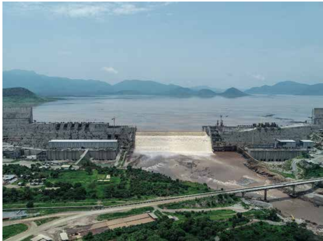
An aerial view Grand Ethiopian Renaissance Dam on the Blue Nile River in Guba, northwest Ethiopia.

"GERD will be remembered as a great achievement not only for Ethiopia, but for all black people," Abiy said at the opening ceremony, attended by regional leaders including Kenyan Pres-