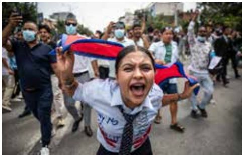
A demonstrator shouts slogans during a protest outside the Parliament in Kathmandu

Disclaimer: (Views expressed by columnists are personal and need not necessarily reflect our editorial stance)