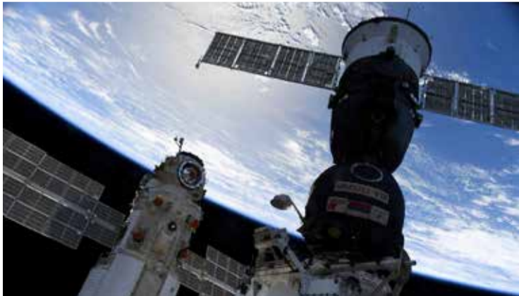
Russian Multipurpose Laboratory Module "Nauka" (Science) being docked next to the Soyuz MS-18 spacecraft on the International Space Station (ISS) ahead as scheduled.

Russia's Oleg Novitsky and Pyotr Dubrov are scheduled to leave the station to continue work on the Nauka science module that docked in July.