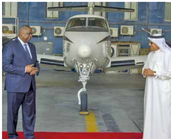
Minister Al Zayani with Lloyd James Austin III

The app, which lists more than 70 doctors, allows obtaining advice from consultants, learn about latest packages and receive appointment alerts, among others.