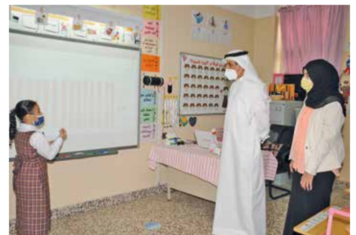
The minister during a school visit

Dr Al Nuaimi was at Al Andalus Primary School for Girls