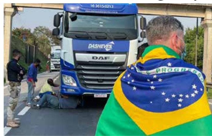
A demonstrator wraps the Brazilian national flag around his shoulders as truckers block the BR-116 Regis Bittencourt highway

The truckers launched their protest Tuesday on Brazilian Independence Day, when Bolsonaro held massive demonstrations to rally his base against what he calls attacks by the Supreme Court and electoral authorities.