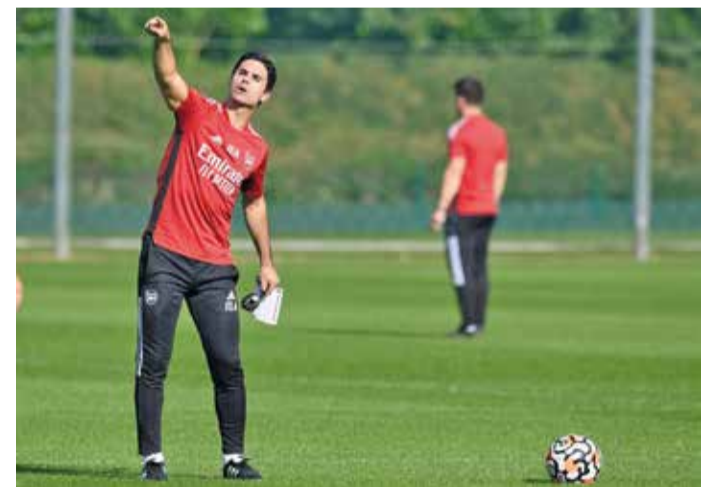
Arsenal manager Mikel Arteta during a training session

Arteta's position as manager is under increasing threat, with