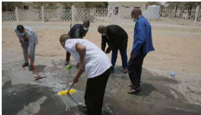
Representative picture.

The alternative penalty will be as per Article (2) of the law. The ministry could also re-