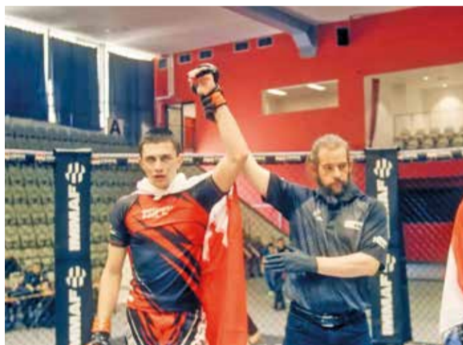
A winner from Team Bahrain celebrates after his match