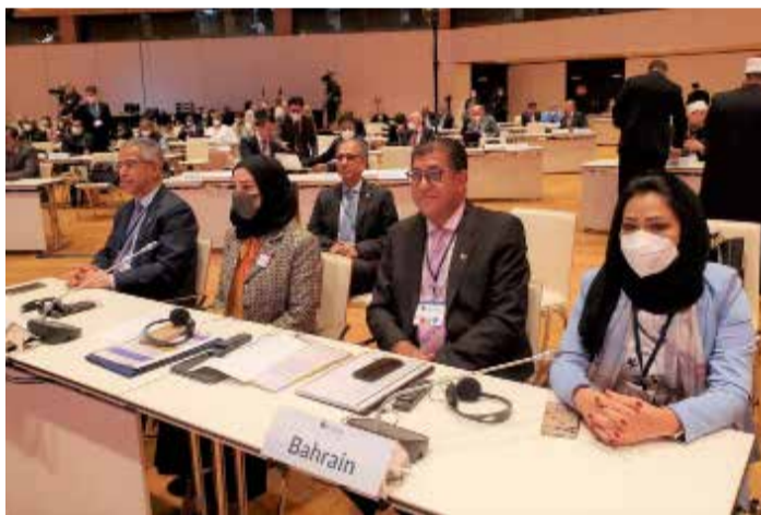
Bahrain's delegates to the first Global Counter-Terrorism Summit in Vienna

Parliaments, she said, should review governments' legislation and policies to combat terrorism