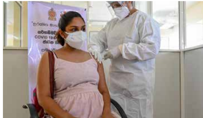
A health worker inoculates a pregnant woman with a dose of the Chinese-made Sinopharm Covid-19 coronavirus vaccine in Colombo