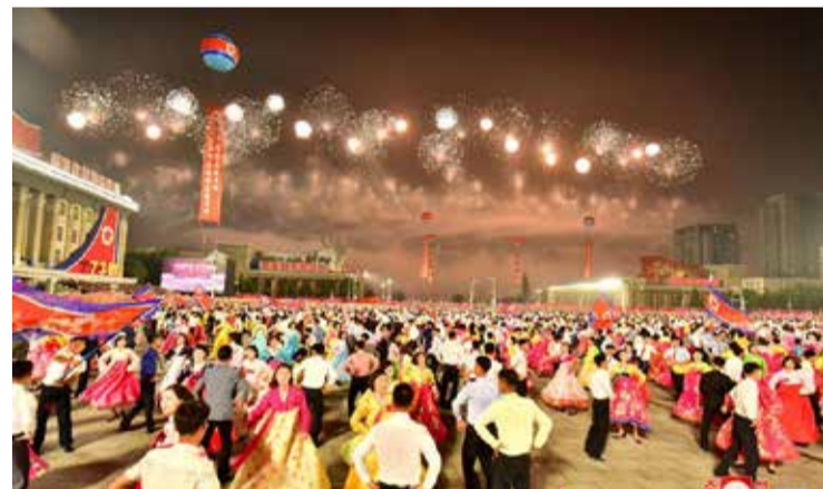
People dance during a paramilitary parade in Pyongyang

Talks aimed at persuading North Korea to give up its nuclear weapons and ballistic missile arsenals have stalled since 2019.