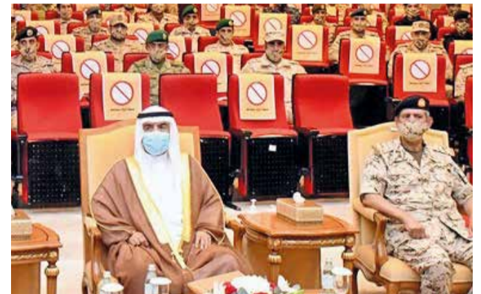
Defence Affairs Minister, Lieutenant-General, Abdullah bin Hassan Al Nuaimi, yesterday attended the launch of the 14th Joint Command and Staff Course at the Royal Command, Staff and National Defence College. College Commander Rear Admiral Abdullah Saeed Al Mansoori thanked the minister for attending the course launch ceremony.