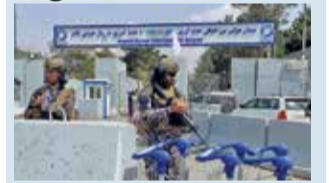
Taliban forces stand guard at the entrance gate of Hamid Karzai International Airport