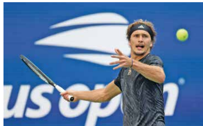
Alexander Zverev in action during his match

"I'm really happy to get through in three."