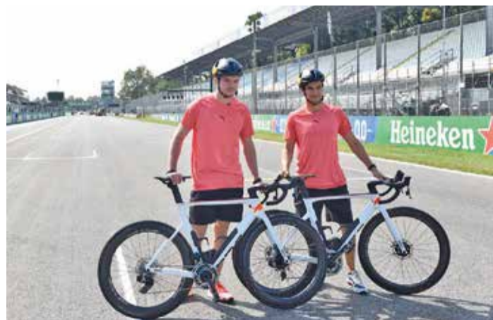
Red Bull's Max Verstappen and Sergio Perez with bicycles on the circuit ahead of the Italian Grand Prix

Teams can currently run qualified young drivers with the required licence in first Friday practice during a normal