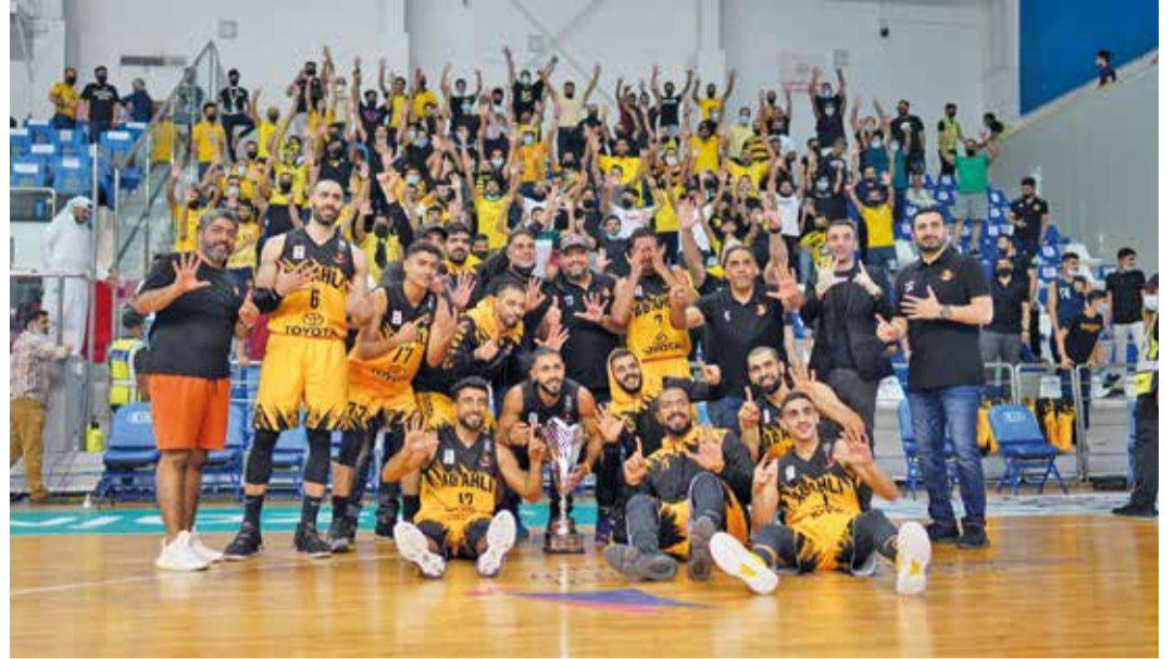
Ahli players and team officials celebrate with the Zain Super Cup