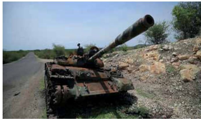
A tank damaged during the fighting between Ethiopia's National Defense Force and Tigray Special Forces stands on the outskirts of Humera town in Ethiopia

TPLF officials could not be reached for comment, and troop movements in Afar could