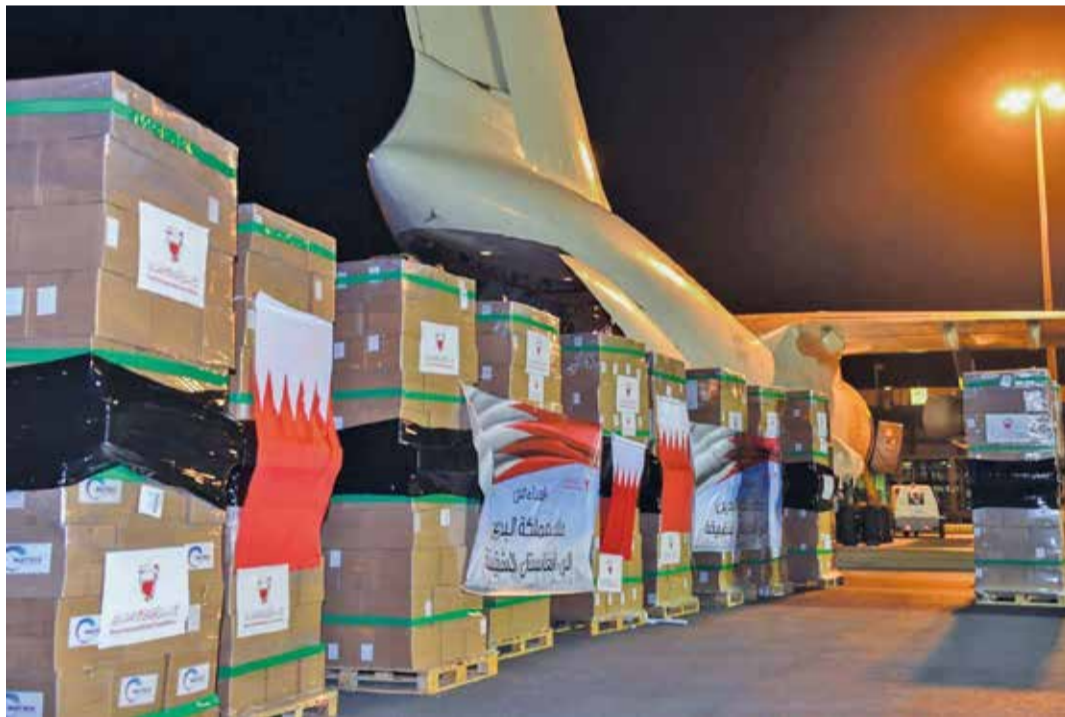
Relief materials stand ready at the airport before loading into an aircraft at airport, yesterday

The latest shipment is to help the people of Afghanistan with medical, food and relief supplies.