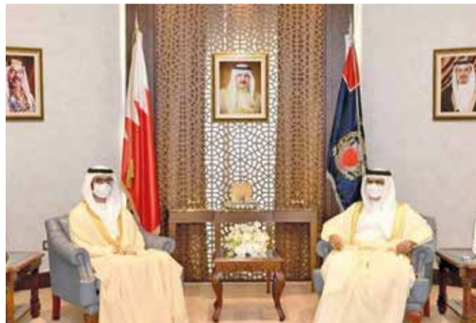
Interior Minister General Shaikh Rashid bin Abdulla Al Khalifa received the Ambassador to the United Arab Emirates to Bahrain Shaikh Sultan bin Hamdan bin Zayed Al Nahyan. Discussions focused on boosting bilateral relations and other issues of common interest.