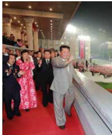
North Korea leader Kim Jong Un (C) attends