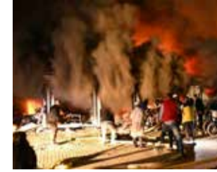
People rush to put out the fire AFP | London

Fourteen people have died in a fire at a hospital treating coronavirus patients in North Macedonia, authorities said yesterday.