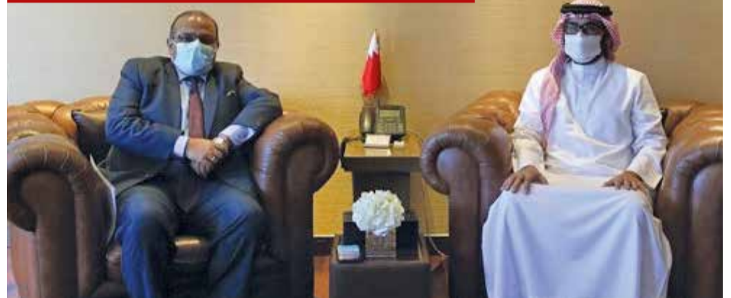
Ayman bin Tawfeeq Al Moayed, the Minister of Youth and Sports Affairs, held talks yesterday with Piyush Srivastava, the Indian Ambassador to Bahrain. The minister praised the strong bilateral ties and their development in various fields, especially in youth and exchanging expertise, noting the Ambassador's efforts in bolstering Bahraini-Indian ties. Indian Ambassador expressed his pride in the steadily growing friendly relations, stressing India's keenness to enhance cooperation with Bahrain in various fields.