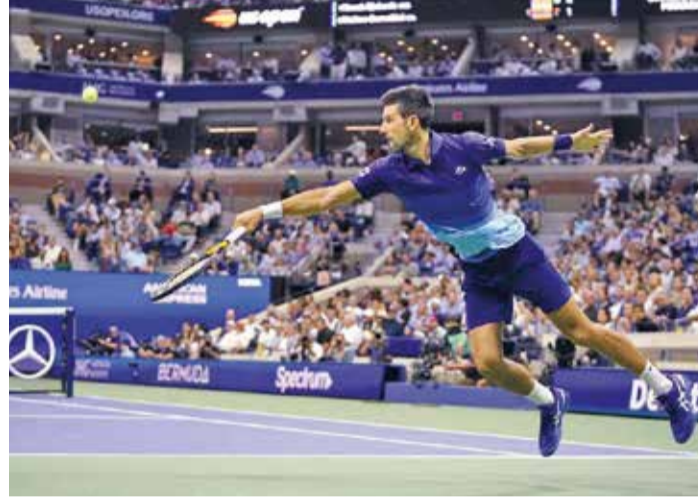
Novak Djokovic of Serbia stretches to hit a return to Matteo Berrettini of Italy

Djokovic is trying to become the first man to win all four major titles in the same year since Rod Laver in 1969, but he wasn't