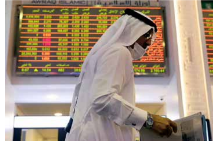
An investor walks through the Dubai Financial Market